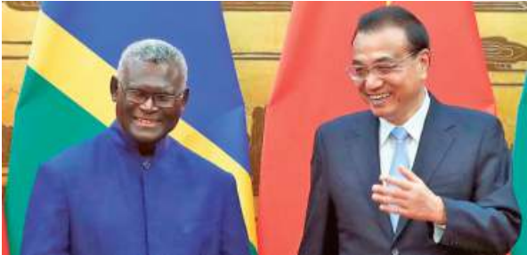
New alignments: Solomon Islands PM Manasseh Sogavare and Chinese Premier Li Keqiang in Beijing.

China is also pushing to end the region’s status as a