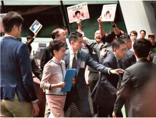
Under fire: Carrie Lam leaving the legislature after being heckled by pro-democracy lawmakers in Hong Kong.

Millions have taken to the streets of Hong Kong, initially against a now-dropped bid by its leaders to allow extra-