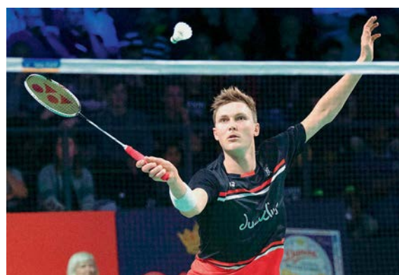
Denmark's Viktor Axelsen in action against Japan's Kenta Nishimoto during their men's singles match at the Denmark Open badminton tournament in Odense on Wednesday. Axelsen won 21-19, 21-19.