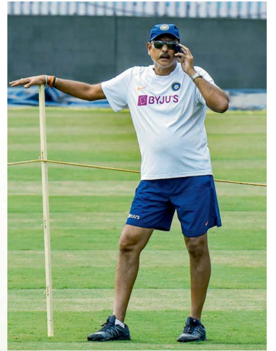
Indian cricket coach Ravi Shastri speaks into his phone during a practice session ahead of the third Test against South Africa in Ranchi on Thursday.