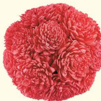
HÖSTMYS Decoration ball, dark pink, 10 cm Rs. 299