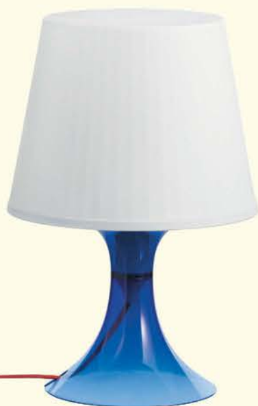
LAMPAN Table lamp Rs. 499