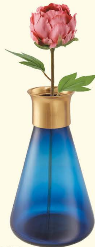
MASKERING Vase, blue glass, 21 cm Rs. 369

This festive season, get your home something new.