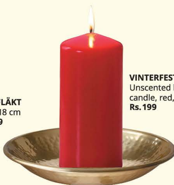
VINTERFEST Unscented block candle, red, 15 cm Rs. 199