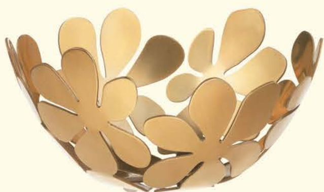
STOCKHOLM Bowl, 20 cm Rs. 999