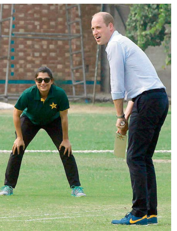
Britain's Prince William, Duke of Cambridge, plays cricket during his visit to the National Cricket Academy in Lahore in this handout picture released by Pakistan Cricket Board on Thursday.

Lara was lavish in his praise for Virat Kohli, whom he termed the 'Ultimate Captain'. "He's (Kohli) the ultimate captain. In terms of his performances, he leads by example. And I mean that in all facets of the game, and off the field too. He is came off very well in the background of MS Dhoni, who laid the foundation, and did things in a different way. So, I think Indian cricket, as we all know, is headed in the right direction," he said. — PTI