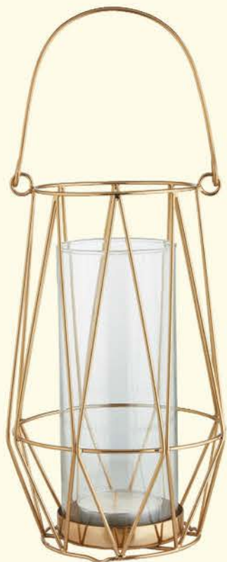
VINDFLÄKT Tealight holder, 24 cm Rs. 699