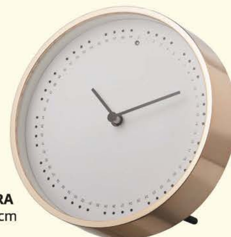
PANORERA Clock, 15 cm Rs. 999