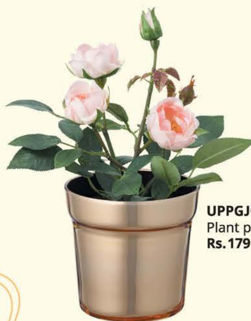
UPPGJORD Plant pot, 10 cm Rs. 179

Complete meal for Rs.190 at IKEA Restaurant