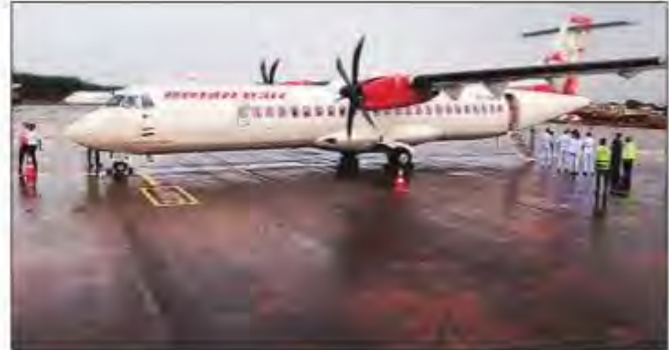
A small Alliance Air flight, a subsidiary of Air India, made the inaugural landing at the newly upgraded Jaffna International Airport at Palaly in Sri Lanka.