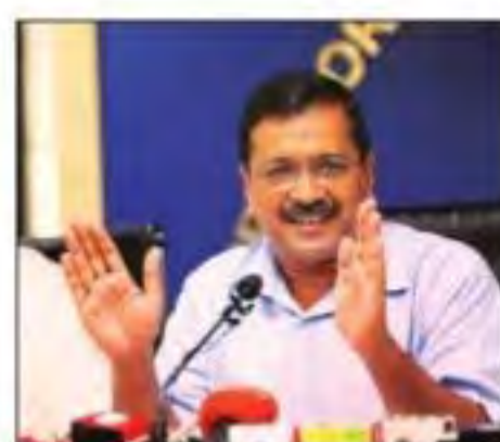
Kejriwal at a press conference.

Delhi Transport Corporation (DTC), which will provide conductors and also manage the revenue generated by them. The bus owners will be in charge of providing drivers as well as maintenance work, an official statement said.