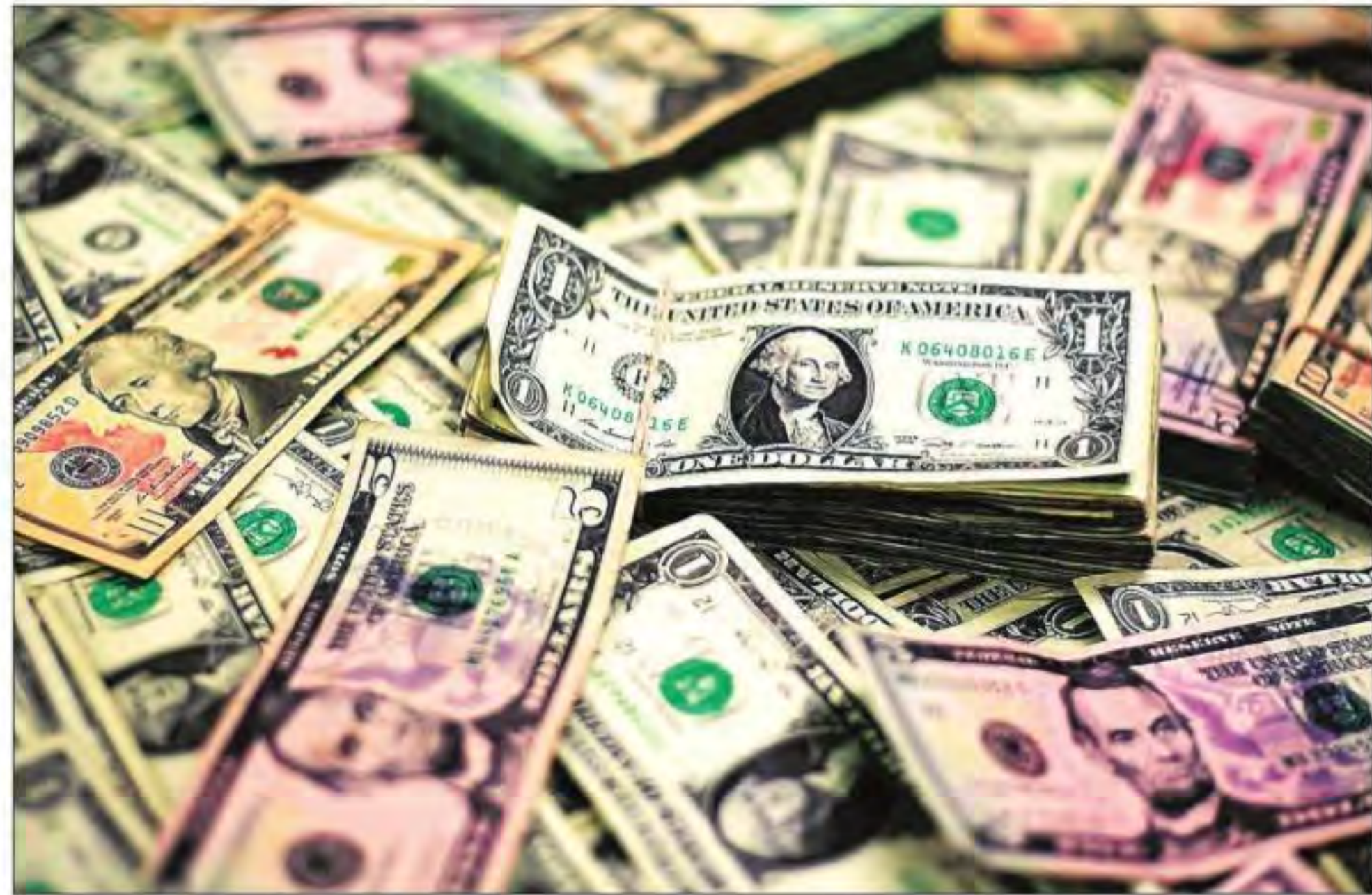
The best way to hide and move stolen wealth is to set up a raft of anonymous shell companies and bank accounts.

The most important thing, campaigners say, is to take steps to stop dirty money arriving in the first place. Banks are becoming better at reporting dodgy deposits. Purveyors of luxury goods are less alert. Boat dealers in