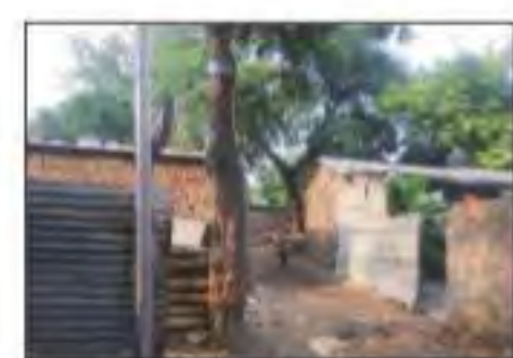
Plea said encroachments led to 'massive felling of trees'