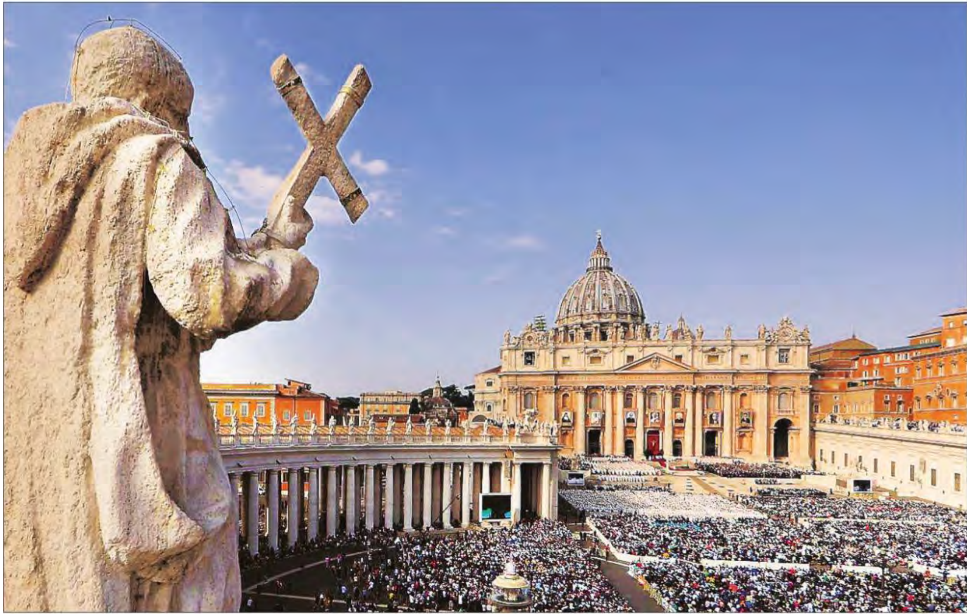
In 2011 the Vatican agreed to inspection of its financial sector by Moneyval, Europe's anti-money-laundering and anti-terrorist-financing watchdog. It has since created an institutional framework similar to those of more conventional states.

that in 2011, under Pope Benedict, the Secretariat of State sank almost €200m in a fund registered in Luxembourg. Among its investments was a 45% stake in a London property. A Vatican official identifies it as the converted Harrods depository. The building's managers did not respond to a request for confirmation.