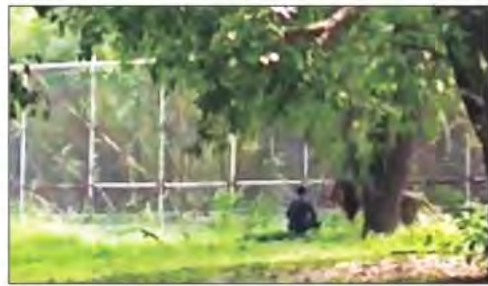
A video grab shows the man in the lion enclosure.