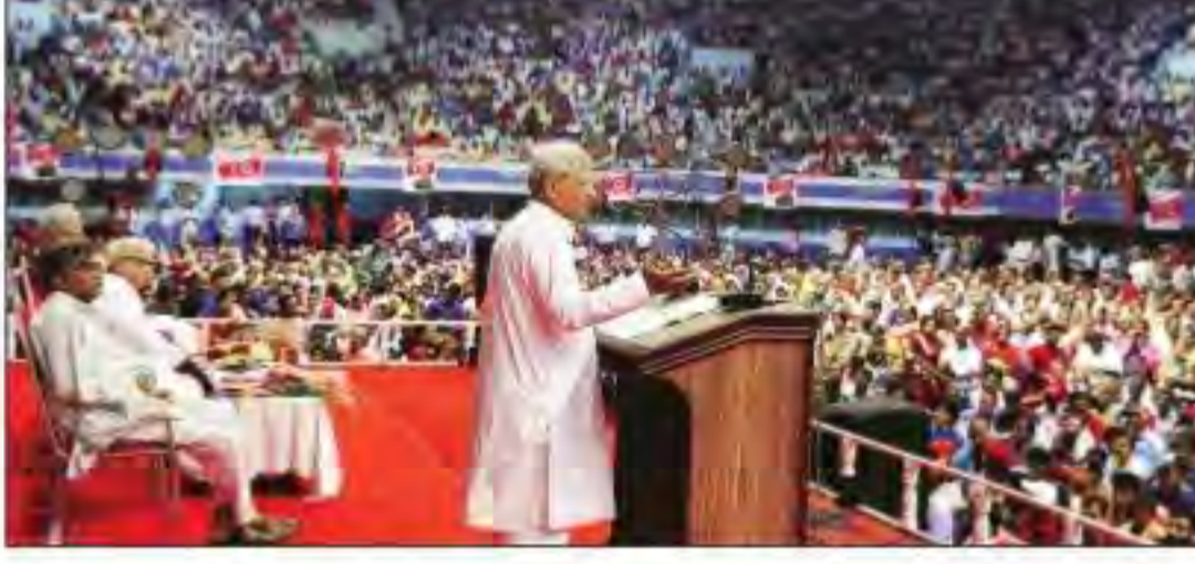
Sitaram Yechury at an event to commemorate 100 years of the Communist Party of India at Netaji Indoor Stadium in Kolkata on Thursday.

EXPRESS NEWS SERVICE KOLKATA, OCTOBER 17 CPM GENERAL secretary Sitaram Yechury on Thursday slammed the BJP and RSS over the issue of NRC and Citizenship (Amendment) Bill.