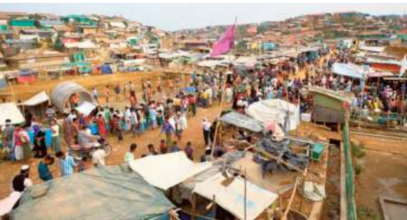
A place to call home: Rohingya Muslims at a market inside the refugee camp in Cox's Bazar, Bangladesh.

Dhaka plans to relocate 1,00,00 refugees