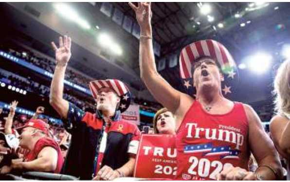
Supporters sporting 'Trump 2020' hats in Dallas. duced a slick video laying out the debunked conspiracy theory about former Vice-President Joe Biden and Ukraine that is now at the centre of the impeachment battle ("Learn the truth. Watch Now!"). The onslaught overwhelmed the limited Demo

become fodder for his campaign. When news of an impeachment inquiry against Mr. Trump broke, the campaign responded with an advertising blitz aimed at firing up the President's base. The campaign slapped together an "Impeachment Poll" (sample question: "Do you agree that President Trump has done nothing wrong?"). It invited supporters to join the Official Impeachment Defense Task Force ("All you need to do is DONATE NOW!"). It pro-