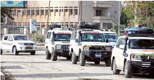
Pulling out: A convoy of ambulances evacuating fighters, injured SDF members and civilians from Ras al-Ain, Syria. fully from the Turkish-besieged border town of Ras al-Ain in northern Syria Sunday, the Syrian Observatory for Human Rights war monitor said. Turkey's Defence Ministry said one Turkish soldier was

AGENCE FRANCE-PRESSE ISTANBUL Turkey on Sunday said Kurdish fighters were withdrawing from the border town of Ras al-Ain under an agreement brokered with the United States. "A convoy of approximately 55 vehicles entered Ras al-Ain and a convoy of 86 vehicles departed in the direction of Tal Tamr," the Turkish defence ministry said in a statement and simultaneously distributed pictures of the evacuation. The Kurdish-led Syrian Democratic Forces withdrew