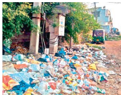
MJ Colony has roads to hell

We, the residents of the MJ Colony, Moula Ali, are very thankful to Speak Out column in Deccan Chronicle for publishing our complaints regarding civic issues in our area (Monday, October 14 - MJ Colony has roads to hell).