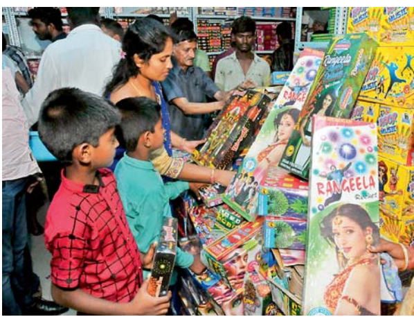
Customers at a firecracker shop in Hyderabad on Sunday.