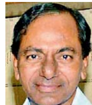
Telangana Chief Minister KCR