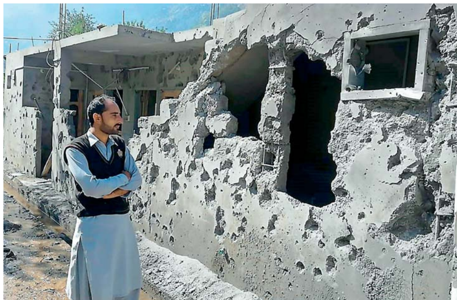
A resident stands in front of his damage house a day after cross border shelling in Jora, a village of Neelum valley in Pakistan-occupied Kashmir on Sunday.

■ Page 7: One killed in Pak shelling on Indian side