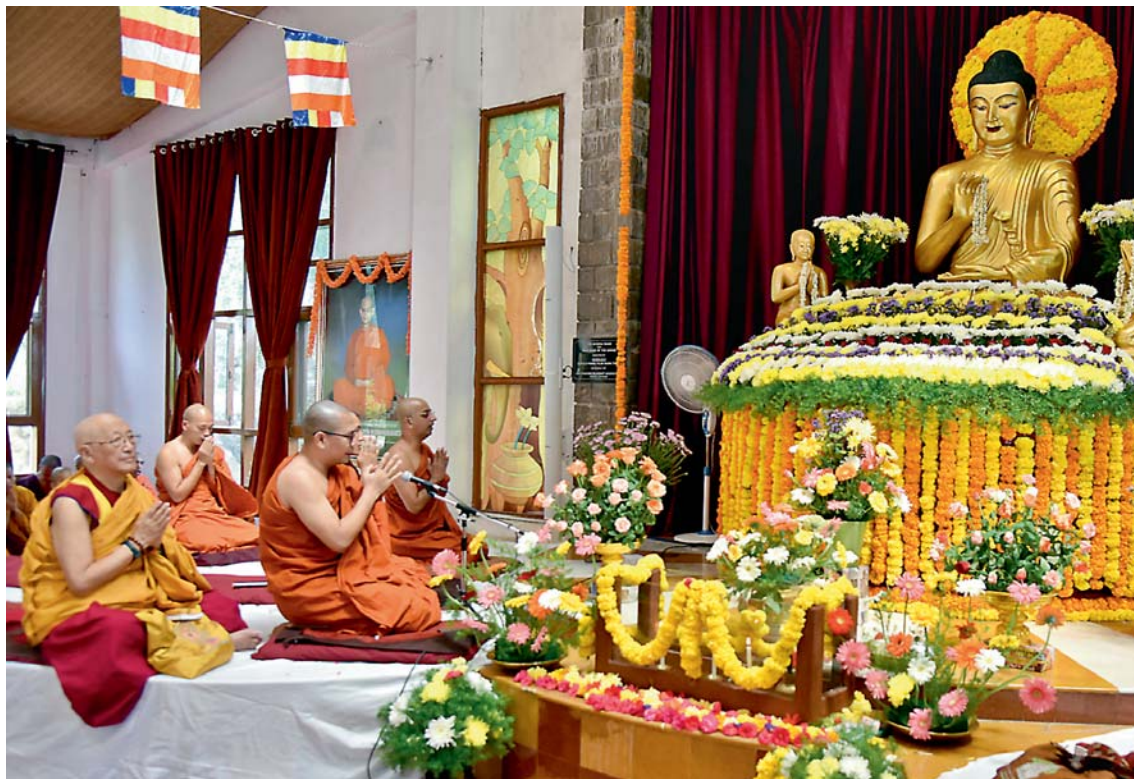
Monks pray at the Mahabodhi Buddha Vihara on the occasion of Kathina Civara Dana (robe offering) ceremony, at Mahendra Hills, Secunderabad, on Sunday.