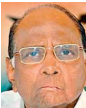
NCP supremo Sharad Pawar