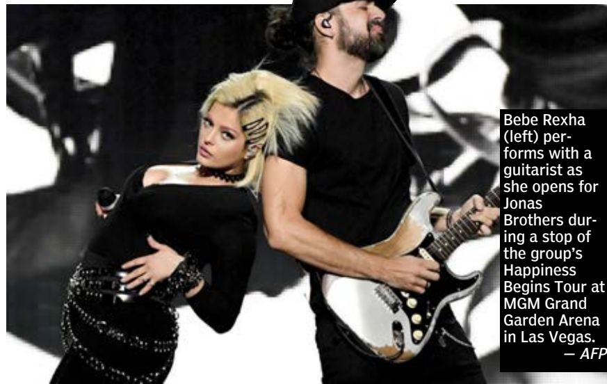
Bebe Rexha (left) performs with a guitarist as she opens for Jonas Brothers during a stop of the group's Happiness Begins Tour at MGM Grand Garden Arena in Las Vegas.