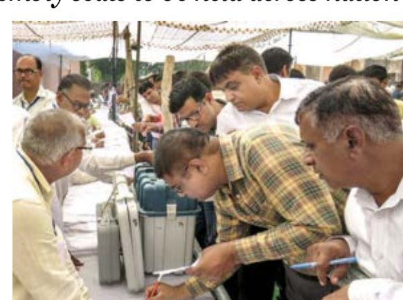
Polls officials collect EVMs and other election materials at a distribution centre in Hisar on Sunday, the eve of the Haryana Assembly polls.

Mumbai/Chandigarh, Oct. 20: Polling will be held on Monday to elect Maharashtra and Haryana assemblies with the BJP and its allies seeking to retain power in the two states on the back of the recent Lok Sabha polls victory, while the opposition is hoping to turn the tide by taking advantage of any anti-incumbency. Bypolls will also be held to 51 Assembly seats and two Lok Sabha constituencies spread across 18 states. In Maharashtra, where the "Mahayuti" alliance of BJP, Shiv Sena and smaller parties is against the "Maha-agadhi" led by the Congress and the NCP, a total of 8,98,39,600 people, including 4,28,43,635 women, are eligible to vote. As many as 3,237 candidates, including 235 women, are contesting in 288 seats and 96,661 polling booths are in place with 6.5 lakh staff for the voting exercise. The ruling BJP is locked in a contest with the Opposition Congress and the fledgling JJP for the