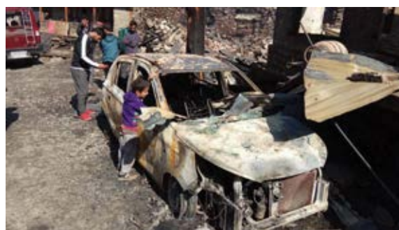
Houses and property damaged due to firing and shelling by Pakistan Army in Gundi Shath village in J&K

In a major counter-attack, the Indian Army early on Sunday morning killed at least six Pakistani soldiers and destroyed four terror launchpads along the Line of Control opposite the Tangdhar sector with heavy targeted artillery shelling. This was in retaliation for the Pakistan Army's truce violation on Saturday night to push terrorists into India, in which two Indian soldiers and one civilian had died in the Tangdhar sector of Kupwara district in the Kashmir Valley. "According to reports which we have received, there has been heavy damage to the Pakistan Army and the terrorists who were in these terror camps. At least six to 10 Pakistani soldiers died and a similar number of terrorists were also killed," said Army Chief Gen. Bipin Rawat. He said unconfirmed reports suggest that the terrorists' casualties were much higher. "There is a kind of radio silence on the other side of the country."