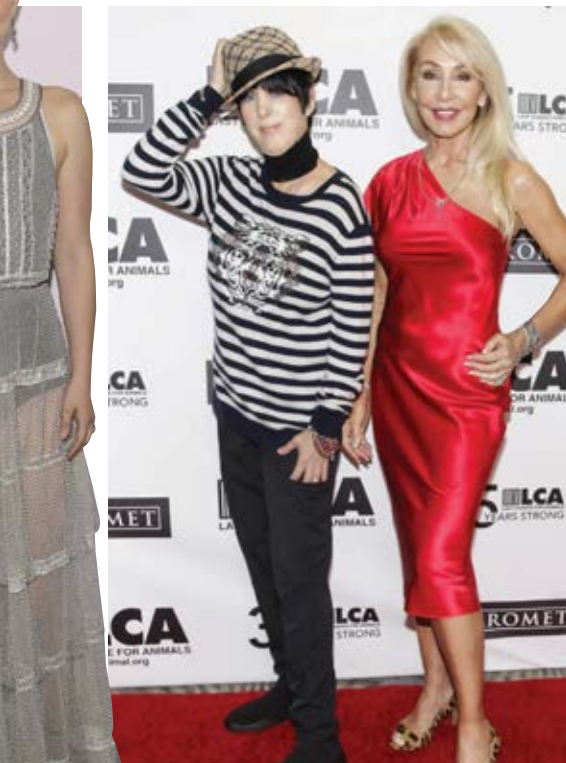
Diane Warren (left) and Linda Thompson at the Last Chance for Animals' 35th anniversary gala in Beverly Hills, California, on Saturday.