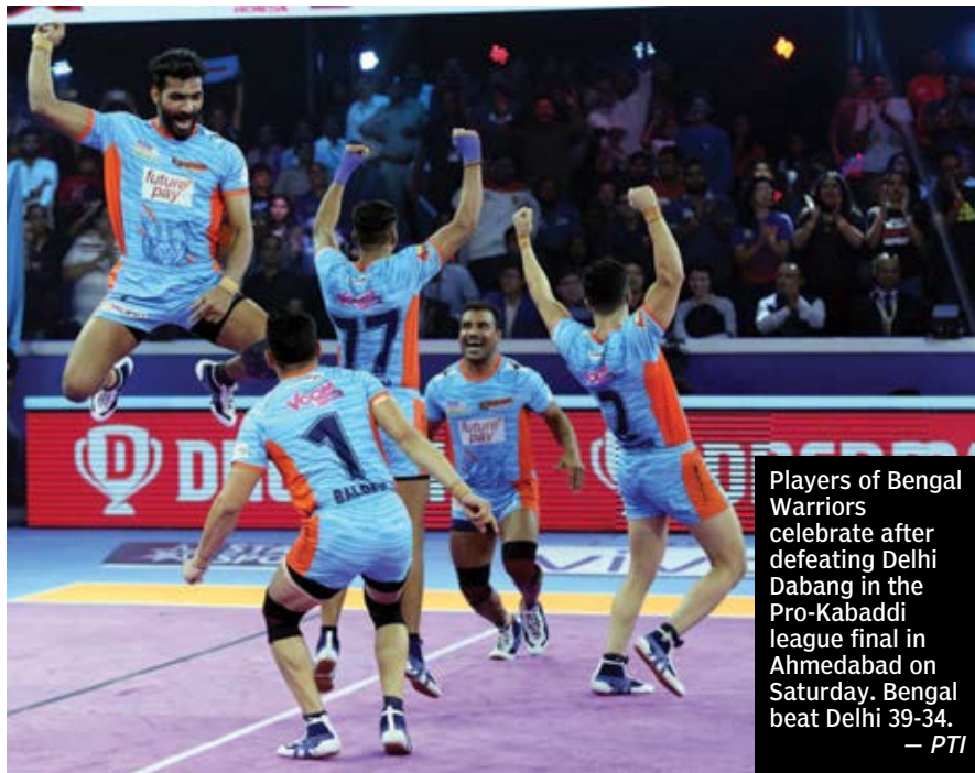
Players of Bengal Warriors celebrate after defeating Delhi Dabang in the Pro-Kabaddi league final in Ahmedabad on Saturday. Bengal beat Delhi 39-34.