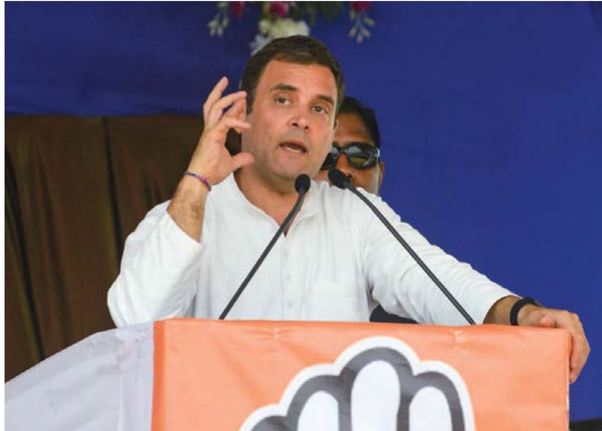
Rahul Gandhi's latest diatribe against Mr Modi seemed tired and ineffectual

During the parliamentary elections in 2019, Rahul campaigned vigorously, attacked Narendra Modi relentlessly blaming him for whatever was going wrong in the country. Alas, the results gave Mr Modi a thumping majority. Like Nadal, Rahul should have realised that his best wasn't good enough to beat the former chaiwala and fierce swayamsevak of the RSS who blunted all the accusations hurled at him with an unending list of decisions taken by him to better the lives of millions of Indians and make India a secure and stronger nation. Many of the failures of Mr Modi mentioned by Rahul might not have been totally untrue but the Indian electorate thought that in spite of everything which his detractors had been saying against him, it was bet-