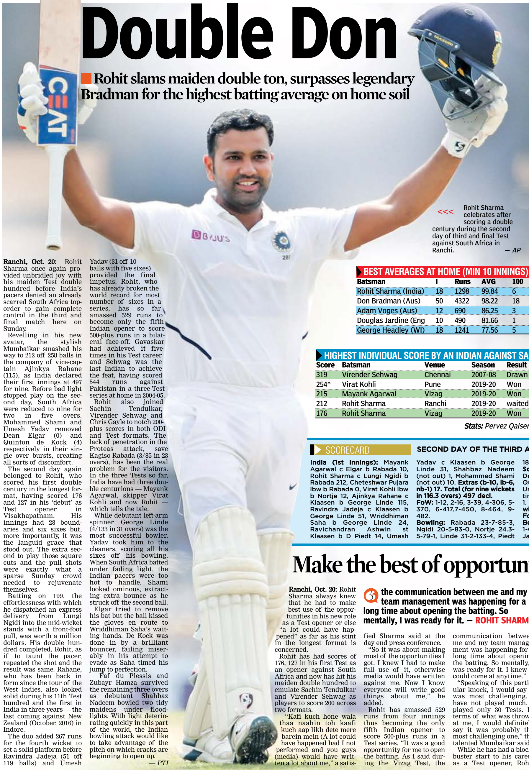
Rohit Sharma celebrates after scoring a double century during the second day of third and final Test against South Africa in Ranchi.

Rohit slams maiden double ton, surpasses legendary Bradman for the highest batting average on home soil