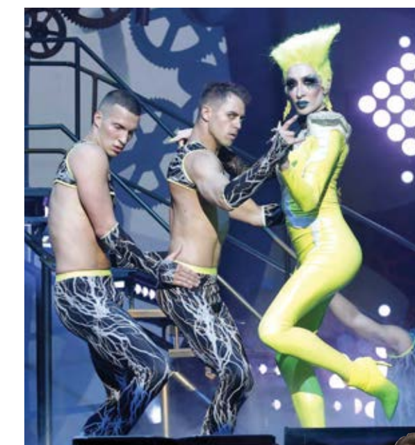
Detox performs during RuPaul's Drag Race: Werq The World 2019 in New York on Saturday.

pavements and amid noisy traffic. We ask the mayor, Virginia Raggi, to stop this unjustified exploitation of animals." ENPA, the national agency for animal protection, said that other horses had fallen on the same manhole. "To make this story even more disturbing is the behaviour of the driver," the agency added. "It was as if nothing had happened, and so the true health of the horse remains a mystery." Rome's horse-drawn carriages is a lucrative business, with tour operators charging as much as ₹27,780.37 for horses to cart four people around key monuments for 2 hours. — Agencies