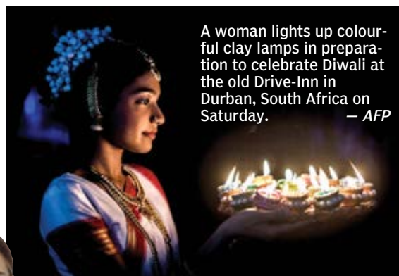
A woman lights up colourful clay lamps in preparation to celebrate Diwali at the old Drive-Inn in Durban, South Africa on Saturday.

"I actually didn't know they were a representation of me," she added. — Agencies