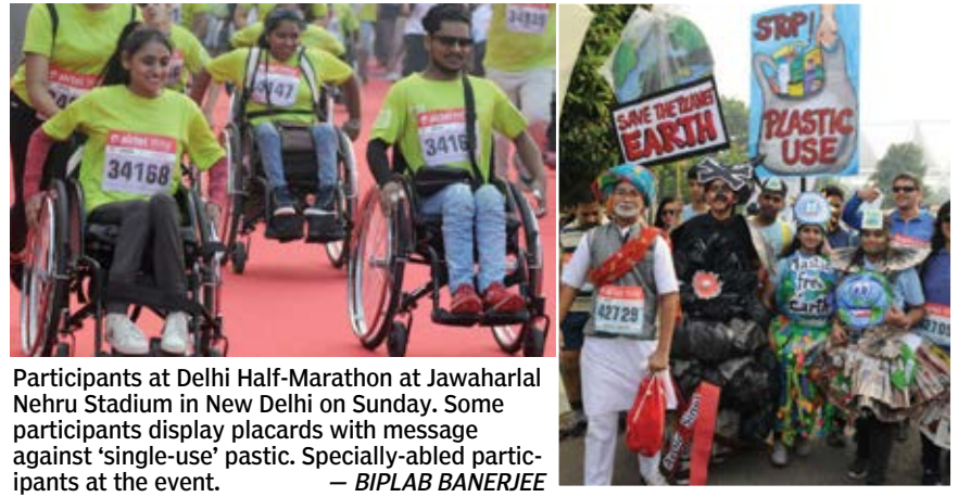
Participants at Delhi Half-Marathon at Jawaharlal Nehru Stadium in New Delhi on Sunday. Some participants display placards with message against 'single-use' plastic. Specially-abled participants at the event.