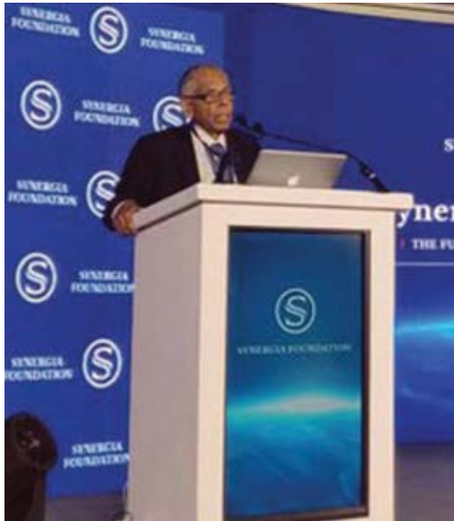
Former National Security Adviser, M.K. Narayanan and Niti Aayog Amitabh Kant at a conclave in Bengaluru

Military conflict might seem unlikely but that's no cause for complacency. "Space wars," says Narayanan, "have come to replace nuclear proliferation. Both China and India have joined the fray with gusto, rapidly expanding their capabilities in outer space and testing Anti SAT weapons. "Countries are capable of building satellites with lasers that can jam enemy signals and Russia is known to be experimenting with proximity operations, connected to an orbital weapons programme. The weaponisation of outer space is a now a reality."