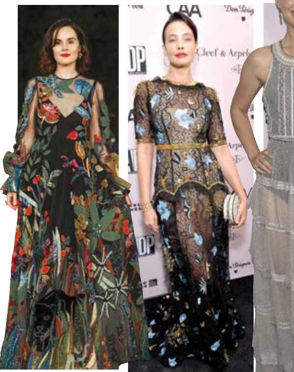
Michelle Dockery on the red carpet for Downton Abbey at the Rome Film Fest on Saturday. Stephanie Corneliussen (left) and Natalie Portman at Dance Project Gala in Los Angeles on Saturday.