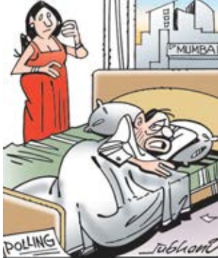
Why can't the EC change the poll timing... evening 6 pm to till the wee hours!