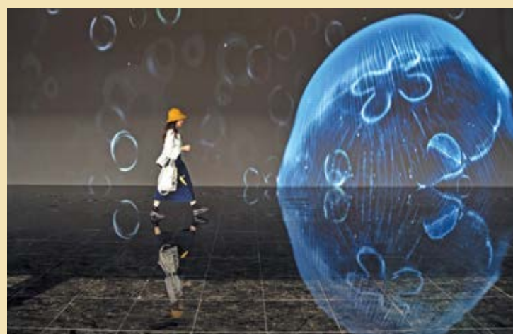
A young woman walks next to a screen during the 6th World Internet Conference in Wuzhen town in the city of Tongxiang in Zhejiang province on Sunday.

The US is threatening crippling sanctions on Huawei, which is expected to be a leading player in the advent of ultra-fast 5G communications that will make many