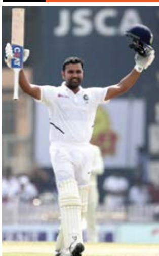
Rohit Sharma celebrates after scoring a double century during the second day of last Test between India and South Africa in Ranchi on Sunday.