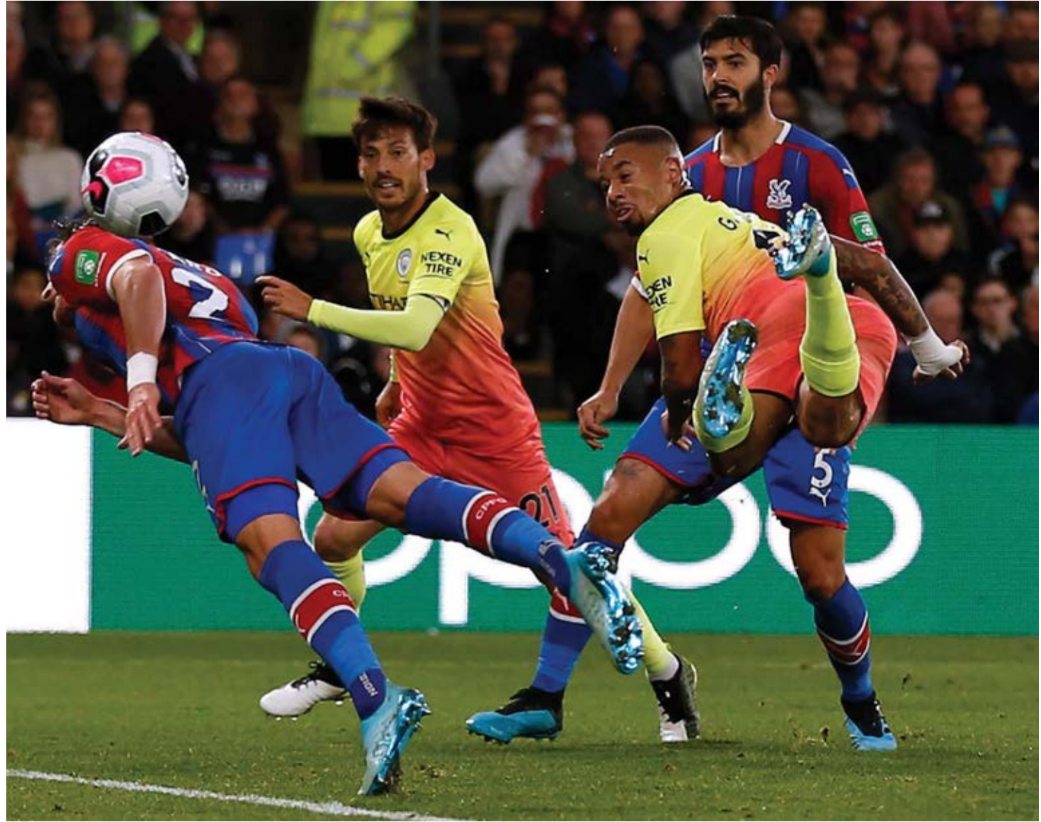
Manchester City's Gabriel Jesus (centre) vies for the ball with James McArthur (left) as Jeffrey Schlupp (right) of Crystal Palace looks on during their English Premier League match at Selhurst Park, south London, on Saturday. City won 2-0.