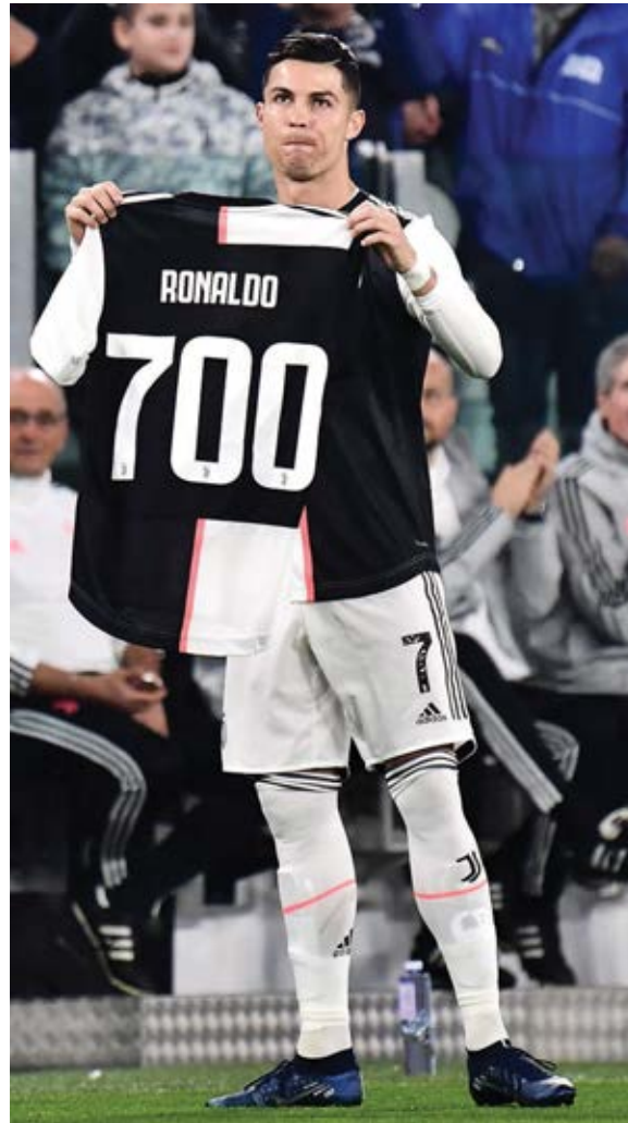
Cristiano Ronaldo of Juventus holds a jersey bearing his name with the number 700, after being honoured for having scored 700 goals so far in his career, prior to their Italian league football match against Bologna on Saturday at the Juventus stadium in Turin.