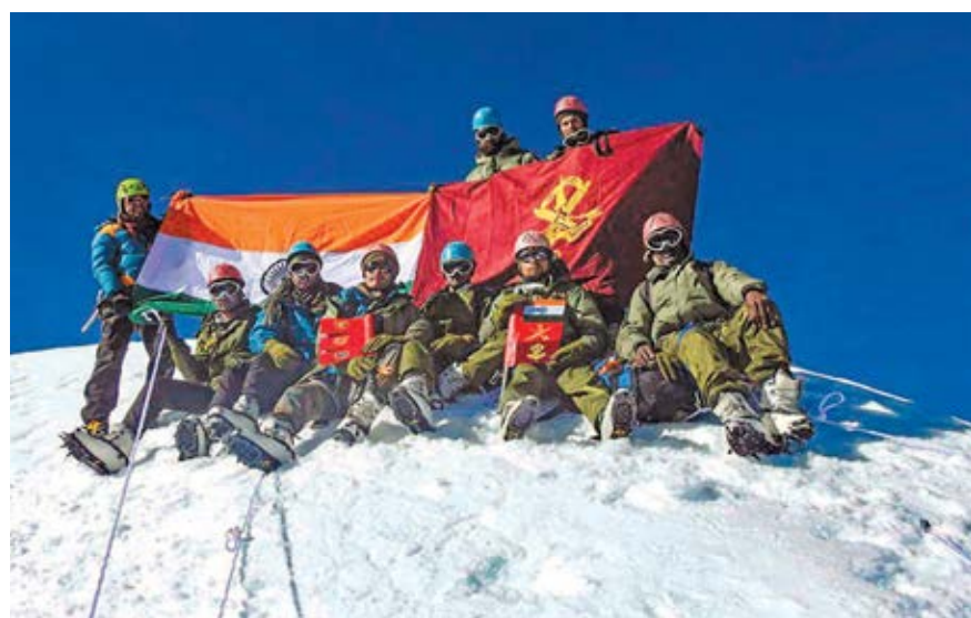
A mountaineering team of 2nd Mahar Regiment of the Indian Army poses for a photograph with the tricolour after scaling Mount Trimukhi peak, situated at an altitude of 6422m, in Uttarkashi. — PTI

New Delhi, Oct. 20: The Railways has decided to prune the Railway Board by 25 per cent, cutting down its strength from 200 to 150 by transferring director-level officials and above to zonal railways in a long pending move to enhance efficiency, sources said on Sunday. The plan was first mooted in 2000 by the Atal Behari Vajpayee government, which recommended right sizing of the apex decision making body of the national transporter. "Currently, there are 200 officials in the board. It will be reduced to 150 with 50 officers of director and above level being transferred to the zonal railways. This was long overdue as it was felt that too many people were doing similar jobs and senior officials were needed in zones to increase efficiency," said a source. The plan would be implemented shortly, he said. The move was part of railway minister Piyush Goyal's 100-day agenda and a top priority for present Railway Board chairman V.K. Yadav. Restructuring of the Railway Board was also recommended by the Bibek Debroy Committee on Railways in 2015. — PTI