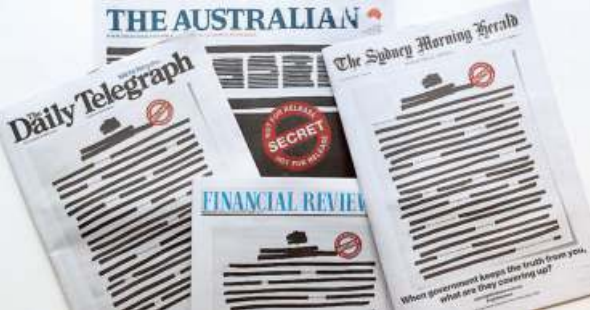
The blacked-out front pages on Monday.

Mastheads from the domestic unit News Corp and rivals at Nine Entertainment ran front pages with most of