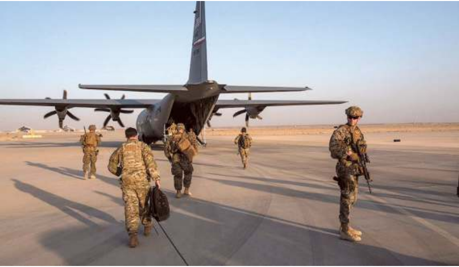
Trimming the force: U.S. military personnel in Helmand Province, Afghanistan.

Other American and Afghan officials, speaking on condition of anonymity to discuss details of the plan, said the eventual force size could drop to as low as 8,600 – roughly the size of an initial reduction envisioned in a draft agreement with the Taliban before Mr. Trump halted peace talks last