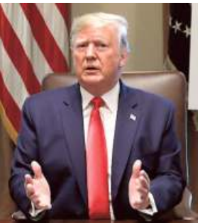
Donald Trump