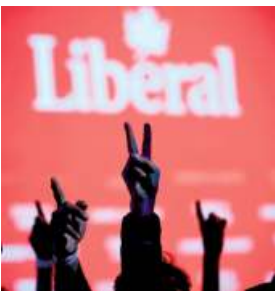
Liberal Party supporters flashing V signs after party's victory in Montreal.

that may have saved his leadership and pulled his party from the brink of irrelevance,” the Toronto Star newspaper reported. With 24 seats in its kitty, the NDP has lost nearly 50% of the seats it had won in 2015. Despite the drop in seats, Mr. Singh, in a celebratory speech on Tuesday, said his party will now be “working hard” to deliver on the “priorities that Canadians have”. “When we get back to Ottawa, every single day we are in Parliament, New Democrats are going to be working to make sure Canadians’ lives are better,” he was quoted as saying by globalnews.ca. Mr. Singh said his party’s elected officials will now head to Ottawa to tackle a number of issues, including taking “real and urgent action” on climate change, making life more affordable