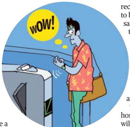
ILLUSTRATION: DEEPAK HARICHANDAN

"These watches will have a chip inserted underneath the dial so the gates can detect the chip once a commuter shows it. A few prototypes have been