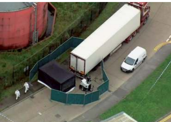
Forensic officers examining the truck found at Essex in south England with 39 bodies on Wednesday.

British Prime Minister Boris Johnson said he was receiving regular updates, and sent his sympathies to the victims' families. "I'm appalled by this tragic incident in Essex," he said.