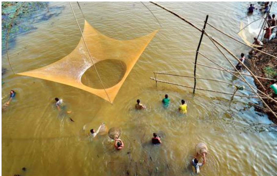
Villagers taking part in community fishing at Tetelia village on the outskirts of Guwahati, Assam, on Wednesday. Once the paddy planting season is over, people descend on shallow waterbodies in groups to try their luck.