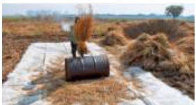
Threshing on at a farm near Delhi.

The MSP of rapeseed and mustard has been increased