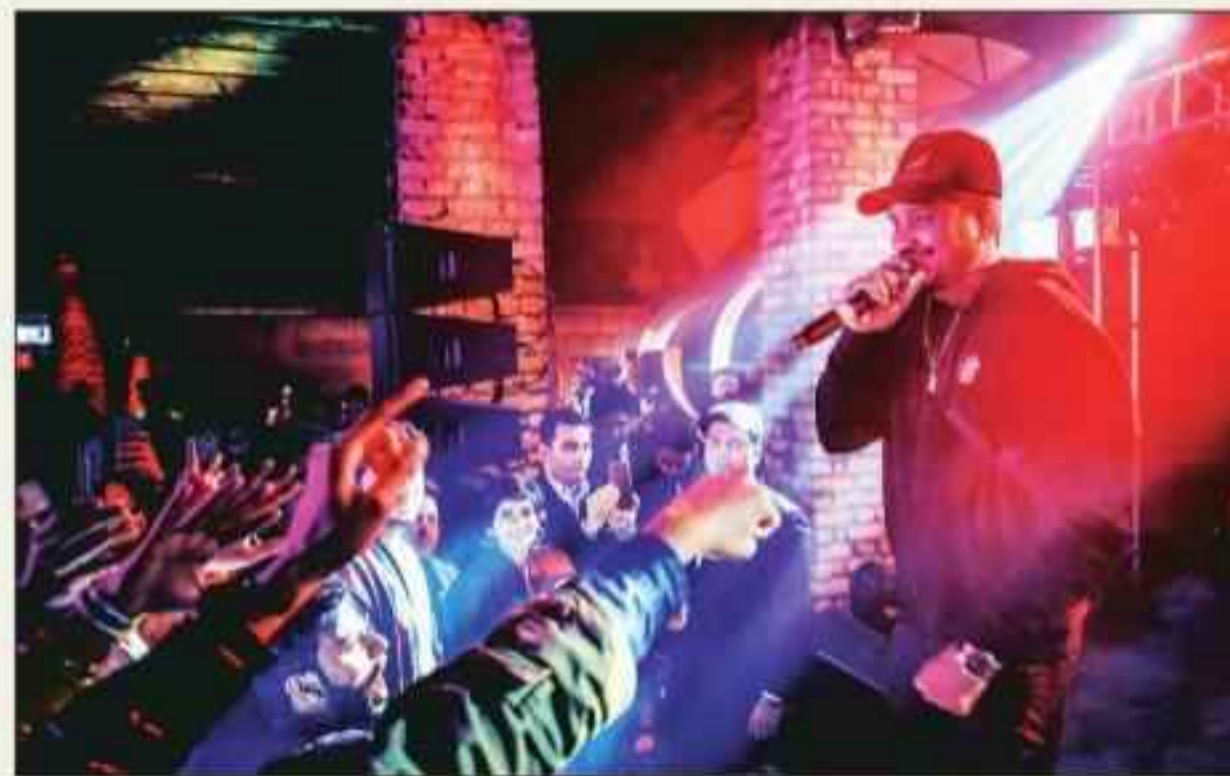
Rapper Divine during a gig

rapping. In the track Kohinoor , you've mentioned artistes who indulge in plagiarism. What's your take on it?