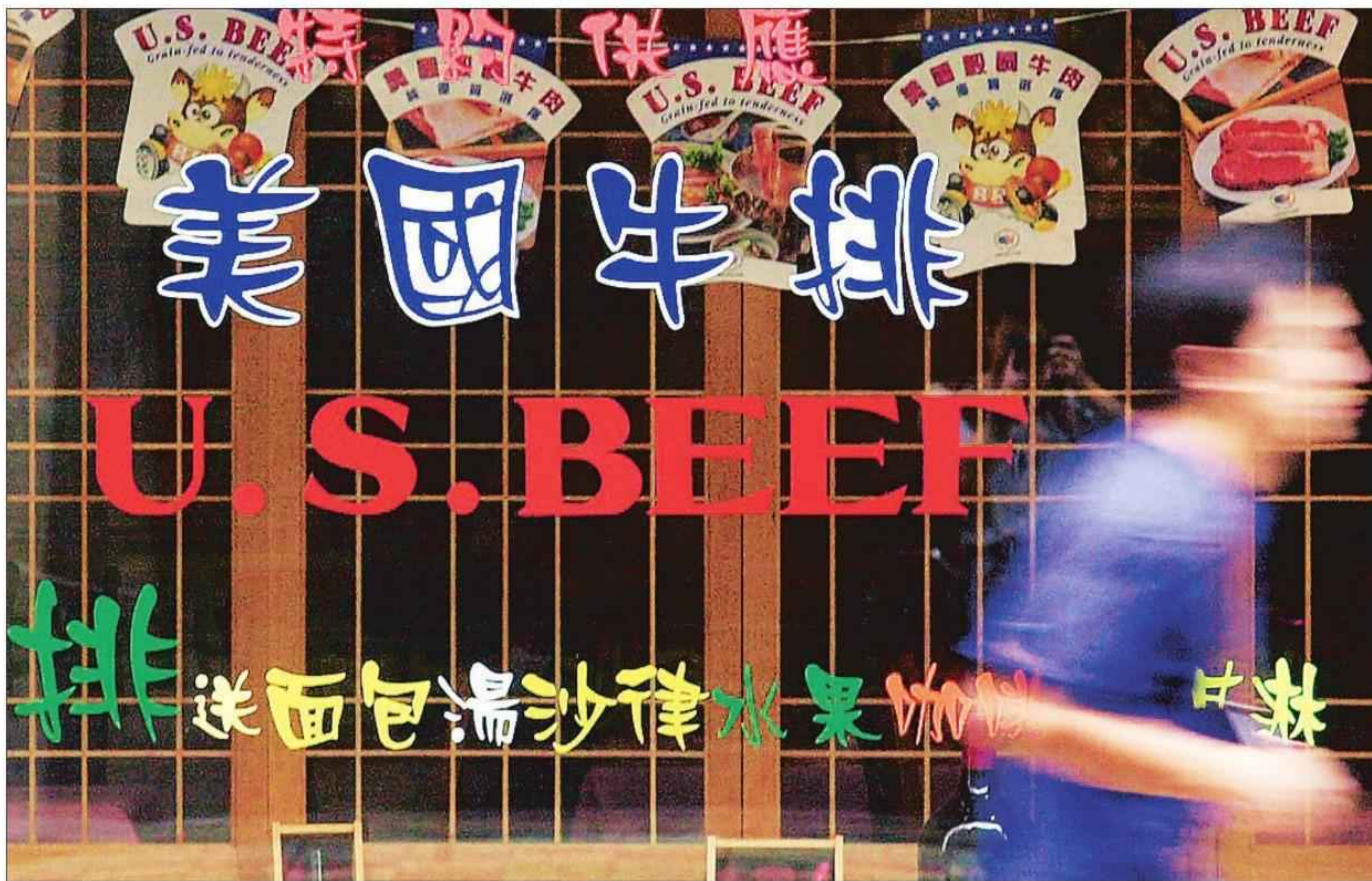
A man walks past a restaurant serving US beef in Shanghai. Around the globe, China's growing hunger for red meat, specifically, has seen its beef imports grow 40-fold between 2010 and 2018.

The planet needs China to curb its appetite for meat