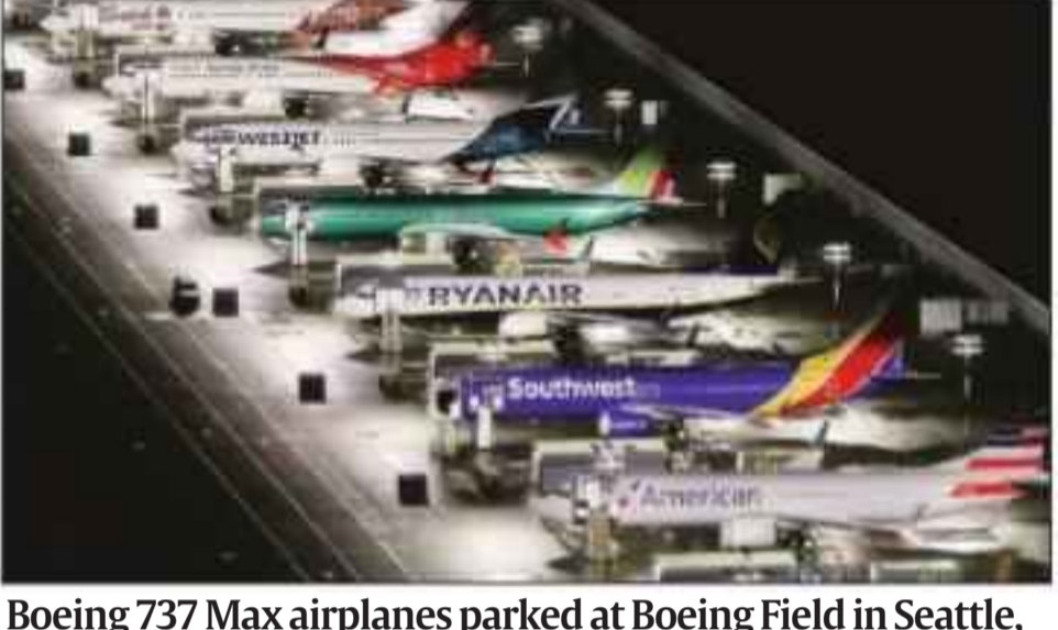
Boeing 737 Max airplanes parked at Boeing Field in Seattle, Washington.