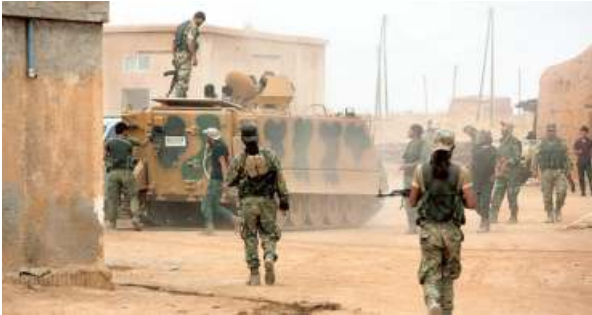
Filling the void: Turkey-backed Syrian fighters taking over areas between Tal Abyad and Kobane on Thursday.

Even as troops withdrew, the Kurds’ top commander threw his weight behind a German-led plan for an internationally secured security zone in the country’s north. Russian forces have started patrols along the flashpoint frontier, filling part of the vacuum left by a U.S. troop withdrawal that effectively returned a third of the country to the Moscow-backed regime of President Bashar al-Assad. U.S. President Donald Trump has praised the agreement reached in Sochi