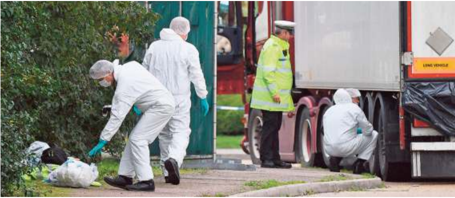
Looking for clues: British forensics experts searching the truck, found to be containing 39 bodies, at Waterglade Industrial Park in Grays, east of London, on Wednesday.

The police are conducting the country’s largest murder probe in more than a decade into what Prime Minister Boris Johnson described as an “unimaginable tragedy”. The local police force, who have arrested the truck’s driver on suspicion of murder, said eight of the dead were women and 31 were men. “All are believed to be Chinese nationals,” the Essex Police said in a statement.