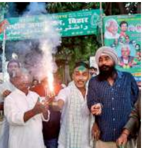
RJD workers celebrating on the streets of Patna on Thursday.

Of the 51 Assembly byelections held across the country, the Opposition Congress and the ruling BJP won three seats each in the six bypolls in Gujarat. OBC