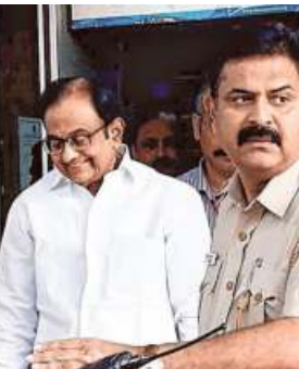
Former Finance Minister P. Chidambaram, centre, at the ED office, in New Delhi on Thursday.

"The captioned ECIR is a reproduction of the subject FIR and the petitioner [Mr. Chidambaram] is neither