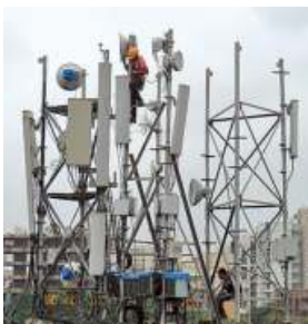
The court dismissed the service providers' objection to the formulation of AGR.

However, the service providers failed to fulfil their obligations to the government and raised frivolous objections.