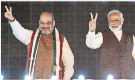
Festive mood: PM Modi and Amit Shah show the victory sign at the BJP headquarters in New Delhi on Thursday evening.

While the NDA managed to maintain a comfortable lead in Maharashtra, the Jannayak Janta Party is expected to become the kingmaker in Haryana as the State witnessed a tight contest