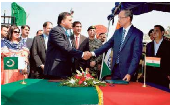
Officials of India and Pakistan after signing an agreement on the Kartarpur Corridor in Gurdaspur on Thursday.

The corridor is being built to connect Dera Baba Nanak in Gurdaspur with Gurdwara Darbar Sahib in Kartarpur, the final resting place of Sikhism founder Guru Nanak, to commemo-