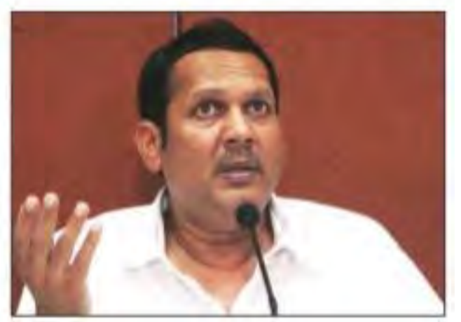
Udayanraje Bhosale at a press conference in Mumbai.

On Thursday evening, a stunned Bhosale said, “I accept the verdict of the kings of democracy — the people are the kings, and