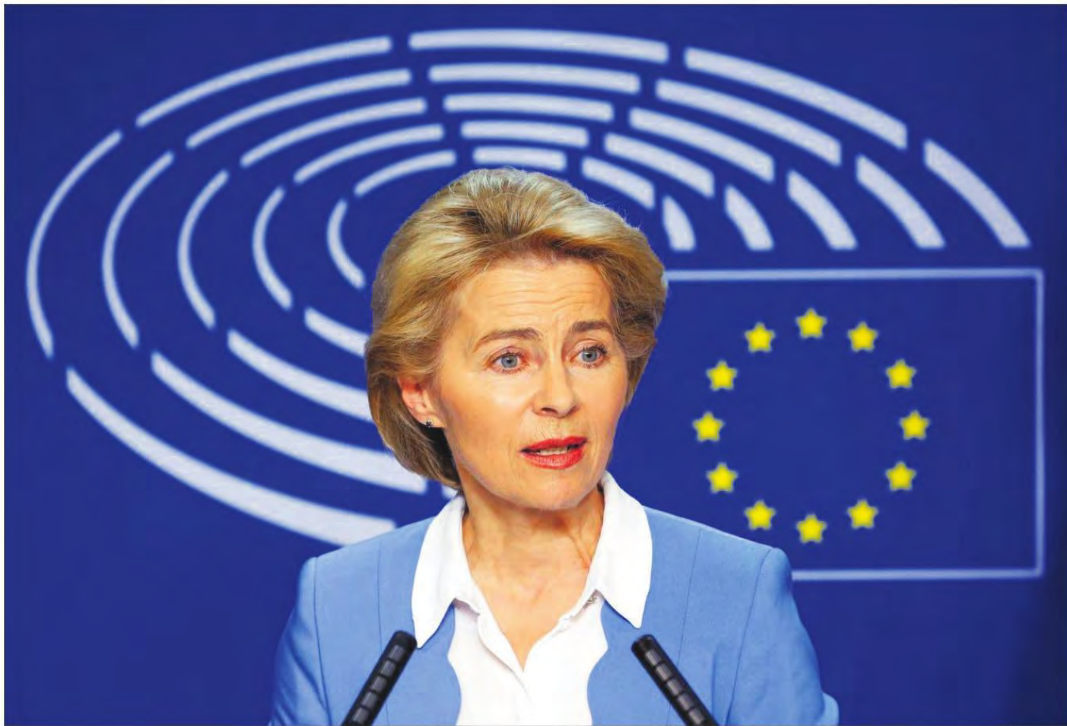
Ursula von der Leyen hails from the EPP but is not considered "one of us" among its parliamentary ranks.

Why the incoming boss of the European Commission is struggling