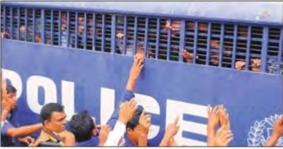
The accused inside a prison van after they were given death sentences in a murder case in Feni, Bangladesh.

The incident had sparked nationwide public outrage and mass demonstrations across Bangladesh with Prime Minister Sheikh Hasina ordering expedited investigation in the quickest possible time. She also met Rafi's family and vowed to bring the killers to justice.