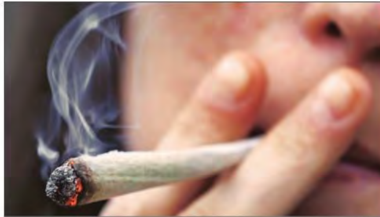
The use of cannabis by pregnant women is on the rise.

THC interacts with the endocannabinoid system, a network of brain cells which communicate with each other using THC-like molecules. Neuroscientists' concerns about using cannabis during pregnancy stem from the fact that, in developing brains, the endocannabinoid system directs cell growth, the