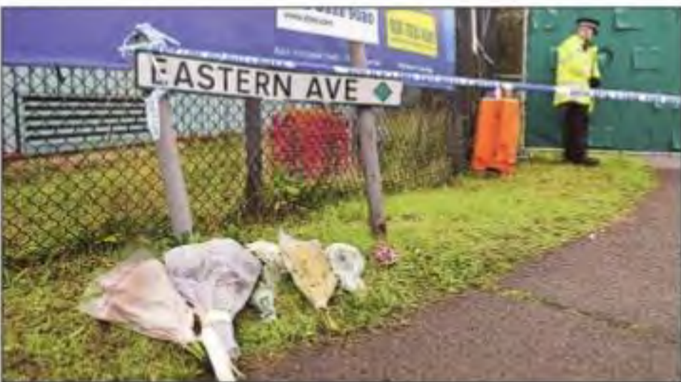
Floral tributes at the Waterglade Industrial Park in Thurrock, Essex, on Thursday, a day after 39 bodies were found inside a truck on the industrial estate.

The tragedy bears striking similarities to a case in 2000 in which 58 Chinese migrants were found dead, also in a refrigerated truck, in Dover, Britain's busiest port. Then as now, the container had been shipped across the English Channel from Zeebrugge, Belgium.