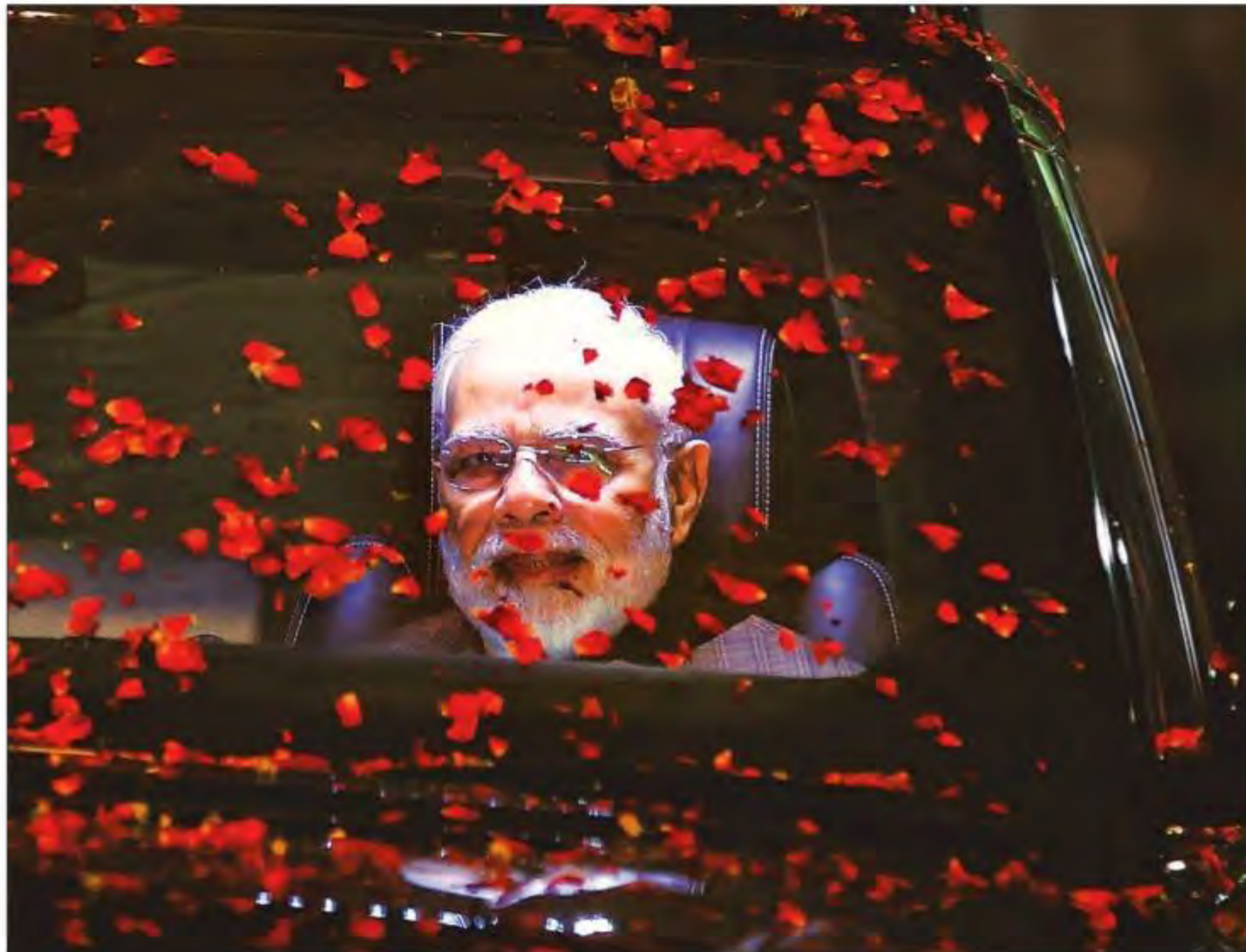
Prime Minister Narendra Modi arrives at the BJP headquarters in Delhi, on Thursday.

The NCP, on the other hand, has never been a force to reckon with in Mumbai. The party has never won more than 10% of the votes in Mumbai ever since its formation in 1999.