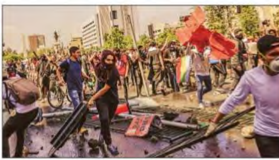
Protesters in Santiago, Chile.

The next day, protesters attacked factories, torched subway