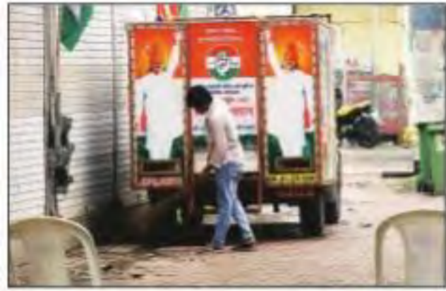
The Congress office in Mumbai on Thursday.