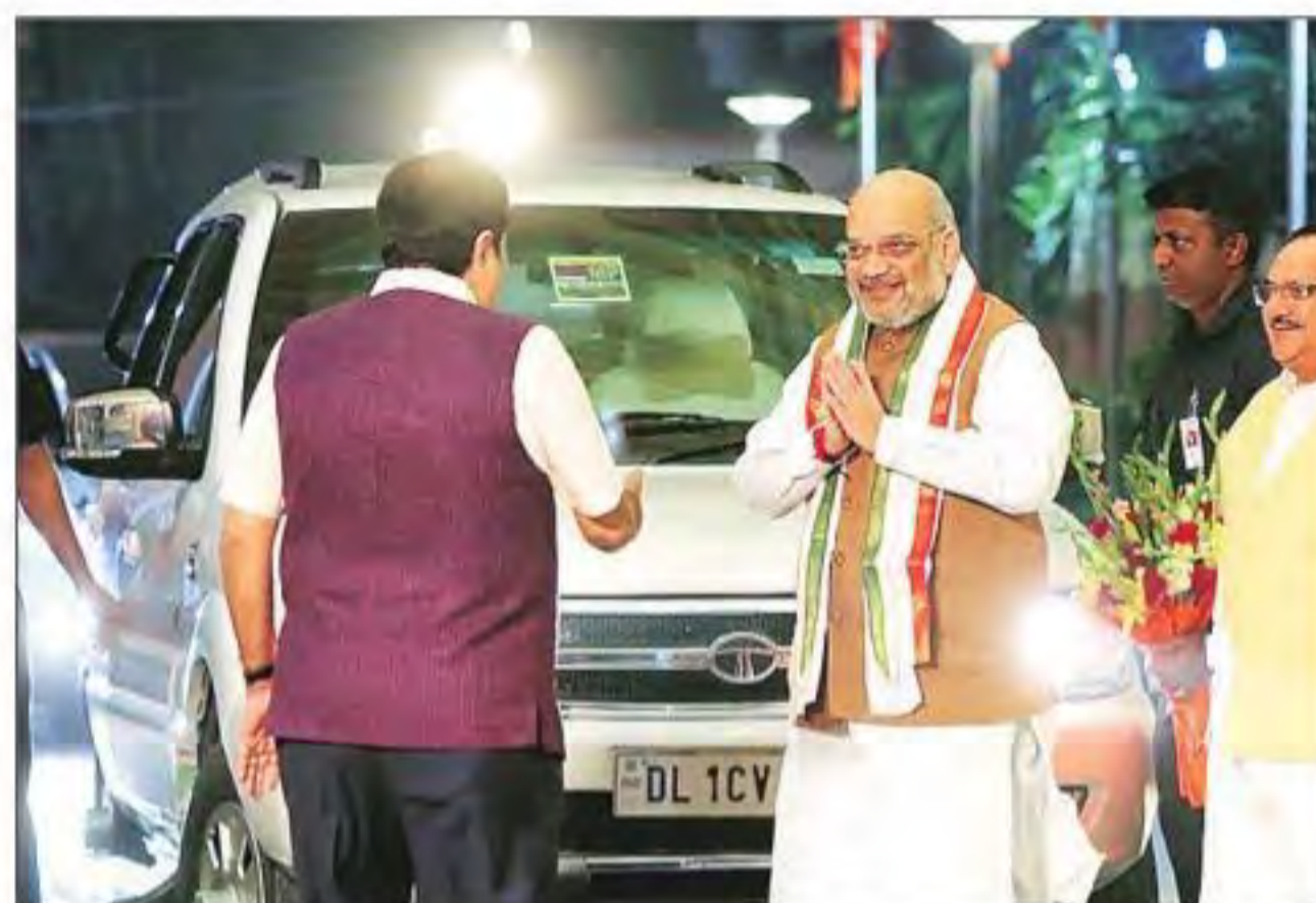
Amit Shah arrives at the BJP office in Delhi, on Thursday.

Both the chief ministers have won people’s trust despite having no prior administrative experience when they took over in 2014, Modi said, adding, “People have put their trust in us. I am aware of the responsibility, and I plan to get to work right away.” He led a large rally through Parli town, in pouring rain, as young boys ran to shake his