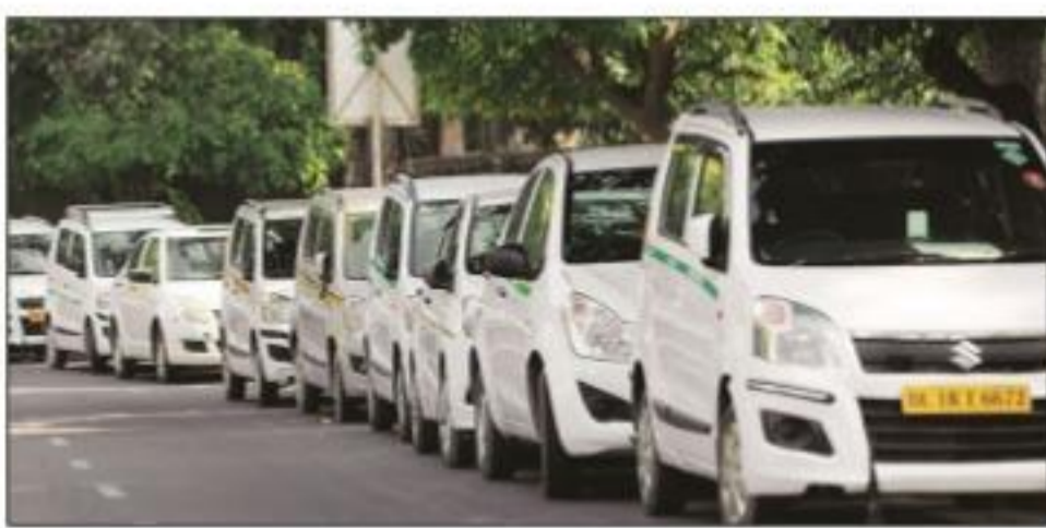
Rs 2,000 is paid to those rushing victims to hospital

Senior health department officials said the mobile apps of the cab service providers will sport a separate logo, saying "Be Delhi's real hero", requesting the passenger and the driver to