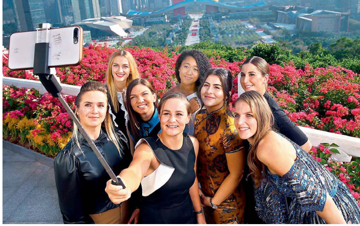
Elina Svitolina (from left), Simona Halep, Petra Kvitová, Naomi Osaka, Belinda Bencic, Karolina Plisková, Bianca Andreescu and Ashleigh Barty pose for a selfie before the start of the WTA Finals in Shenzhen on Friday.