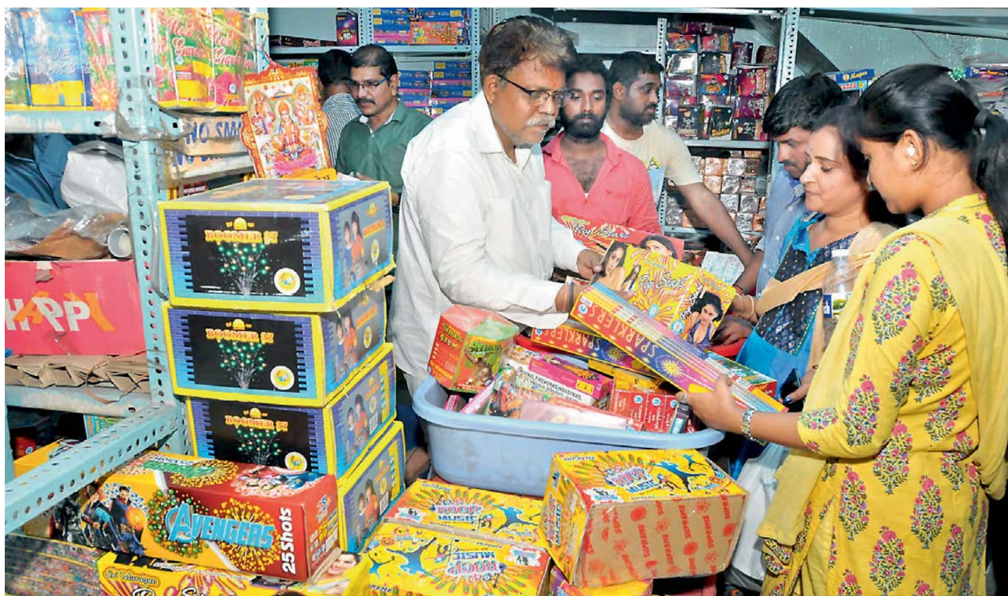
Customers purchase firecrackers ahead of Diwali on Friday.