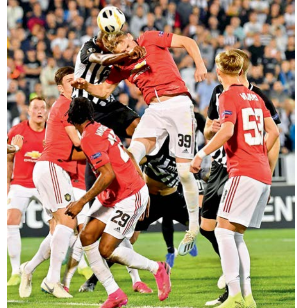
FK Partizan's Sadiq Umar (in black and white stripes) vies with Manchester United's Scott McTominay during their Europa league Group 'L' match at the Partizan stadium in Belgrade on Thursday. United won 1-0.