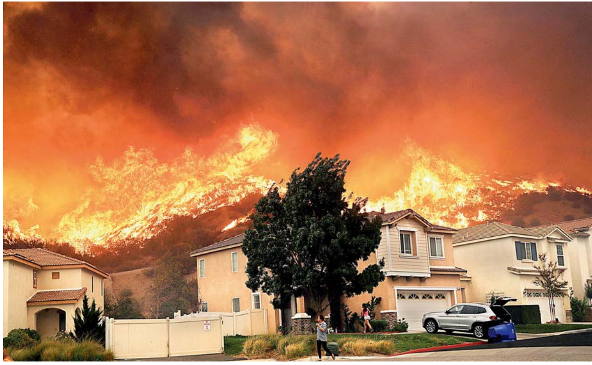
Flames from a wildfire are seen close to a residence in Santa Clarita. Around 50,000 people were asked to flee their homes north of Los Angeles as a fast-moving wildfire driven by high winds erupted and raged out of control.