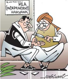
The Goddess of Wealth will knock on your door soon!