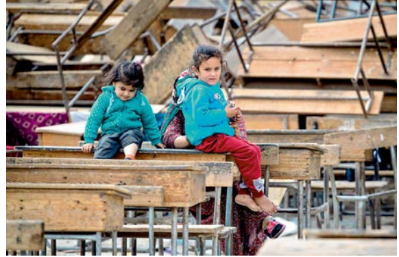
Displaced Syrian children sit on classroom tables at a school turned into a shelter in Hasakeh, Syria.

Moscow Oct. 25: Around 300 more Russian military police have arrived in Syria, the Russian defence ministry said on Friday, under an accord between Ankara and Moscow which halted Turkey's military incursion into northeast Syria. The deal, reached on Tuesday by Presidents Tayyip Erdogan and Vladimir Putin, requires that Russian military police and Syrian border guards remove all Kurdish YPG militia from within 30 km of the Turkish border by next Tuesday.