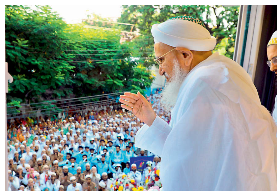
Head of the Dawoodi Bohra community, Dr Syedna Mufaddal Saifuddin, greets devotees at the Hussaini Manzil, Red Hills, on Friday, where a reception was organised to welcome him.

During his stay in Hyderabad, the Syedna will be staying at Hussaini Villa, Nampally.