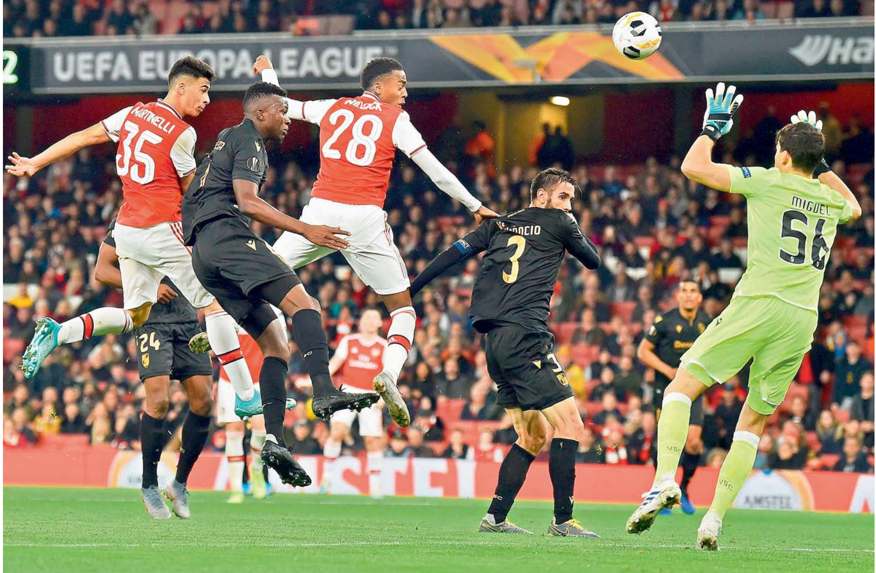
Arsenal's Gabriel Martinelli (left) heads the ball past Vitoria Guimaraes' goalkeeper Miguel Silva (right) to score the equalising goal during their UEFA Europa league Group 'F' match at the Emirates stadium in London on Thursday. Arsenal won 3-2.