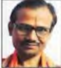
Killed in his Lucknow home on October 18