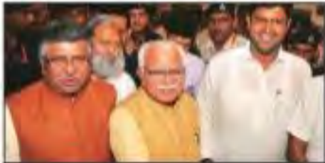
M L Khattar with Dushyant Chautala, R S Prasad in Chandigarh on Saturday.

Dushyant's father Ajay Chautala, who is serving a 10-