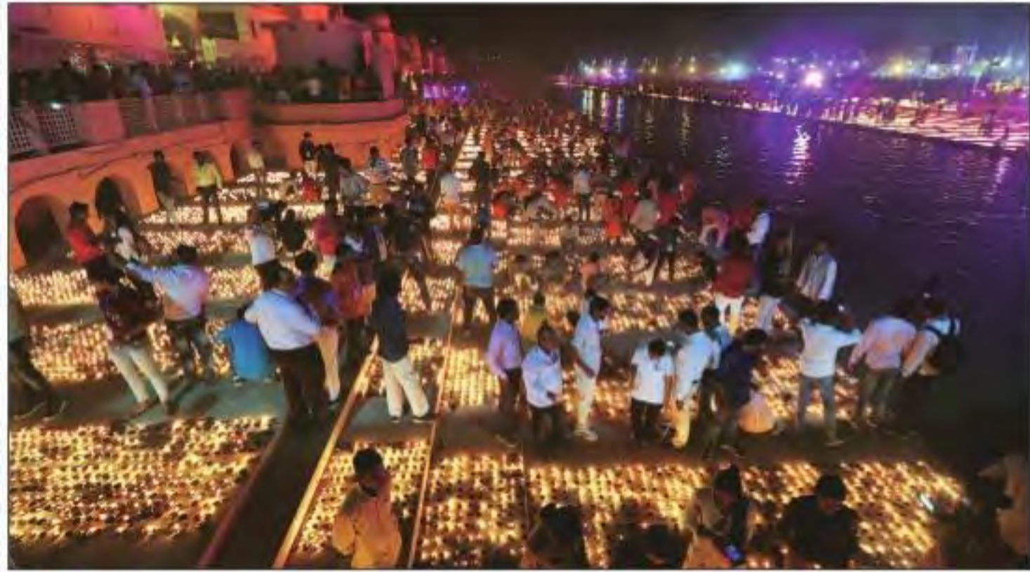
More than five lakh diyas were lit for Deepotsav in Ayodhya on Saturday.