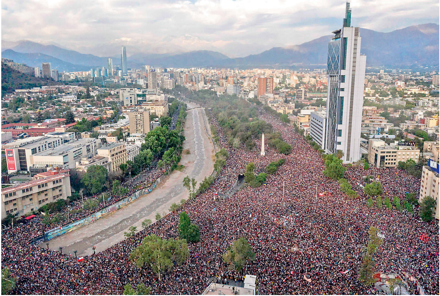
As many as a million Chileans protested peacefully in Santiago in the biggest rallies yet since violence broke out a week ago over entrenched inequality in Chile.

Washington, Oct. 26: Sending Diwali greetings to Hindus, Jains, Sikhs and Buddhists, US President Donald Trump said that the observance of the festival of lights throughout America is an important reminder of the significance of the country's core tenets — religious liberty. A day earlier, Trump celebrated Diwali in the Oval Office with a small group of Indian-Americans. "The observance of Diwali throughout America is an important reminder of the significance of one of our Nation's core tenets — religious liberty," Trump said in a statement ahead of the Diwali celebrations in India, the US and across the world. "My Administration will continue to defend the rights enshrined in our Constitution that enable people of all faiths to worship according to their beliefs and conscience," he said. "As Diwali commences, Melania and I wish those observing the Festival of Lights a blessed and happy celebration," said the US President. For many Hindus, Jains, Sikhs, and Buddhists in the US and around the globe, this sacred period is an opportunity to commemorate the victory of light over darkness, good over evil, and knowledge over ignorance, he said. "Throughout this holy time, members of these faiths engage in prayer, light diyas and lanterns, and partake in traditional feasts and other festivities with friends and family," he said.