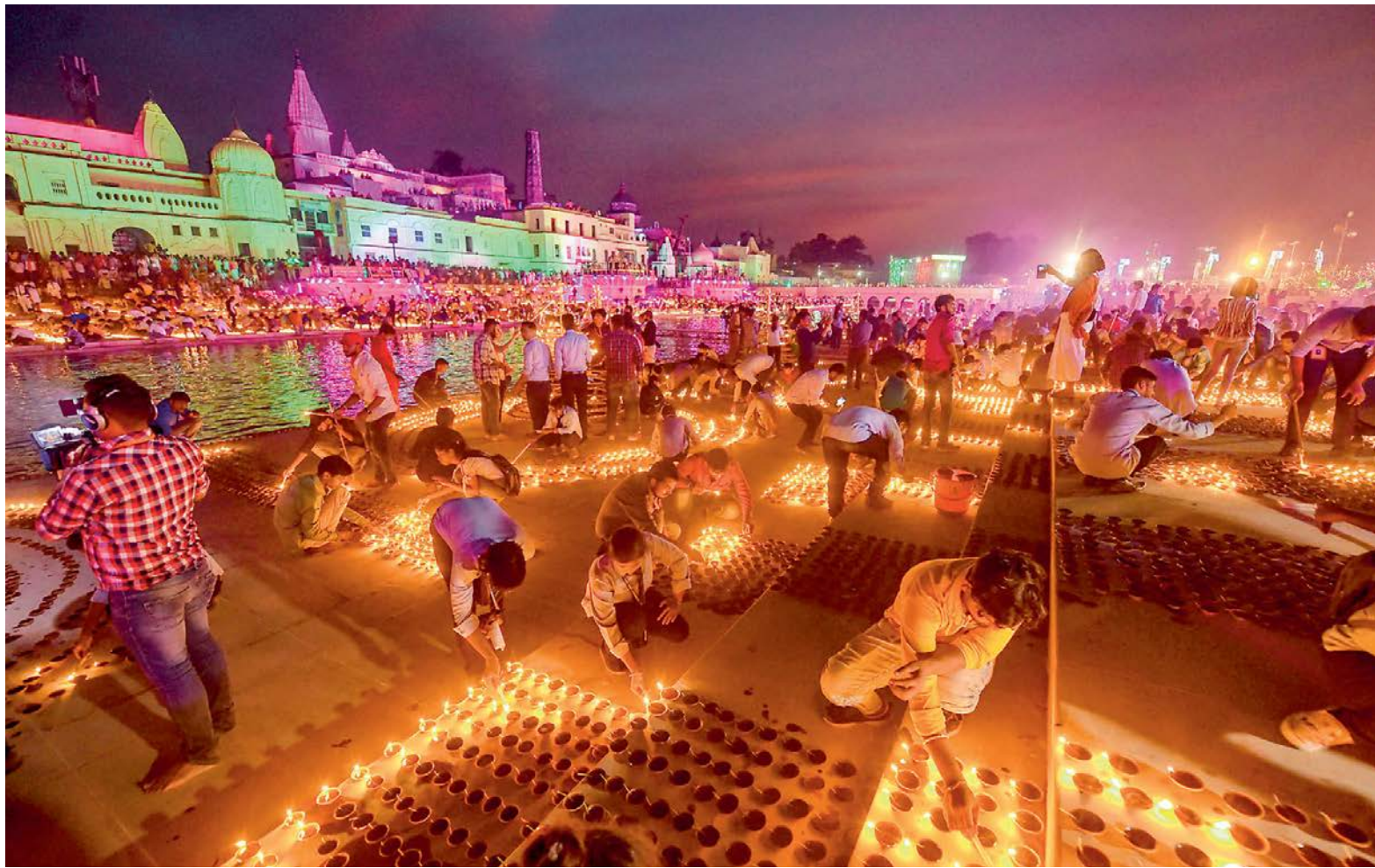
Devotees light thousands of earthen lamps on the bank of the Saryu river during Deepotsav celebrations, on the eve of Diwali, in Ayodhya on Saturday. — PTI

DC wishes its readers a happy and prosperous Diwali