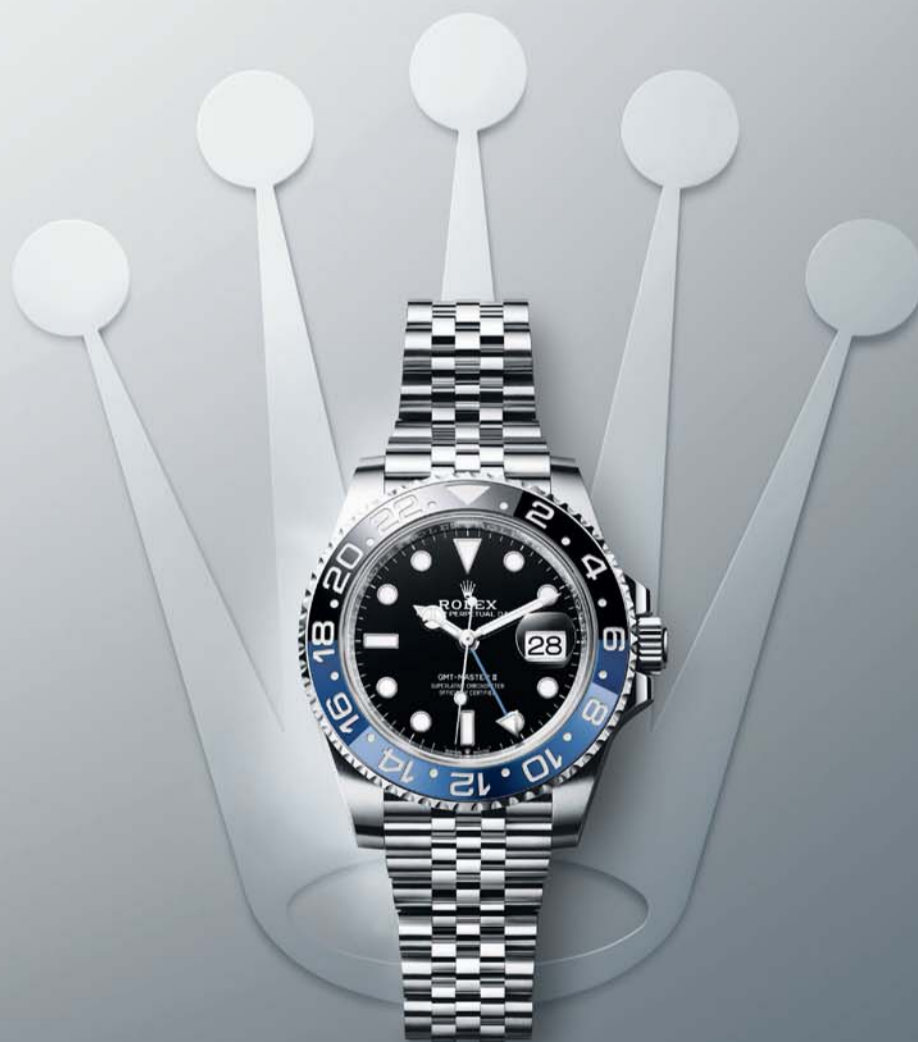
OYSTER PERPETUAL GMT-MASTER II