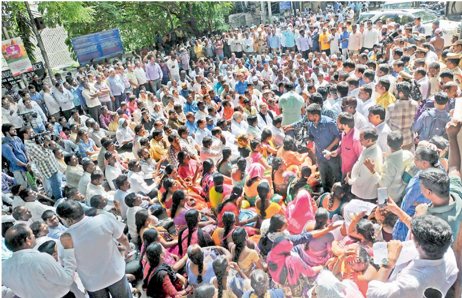
Sacked TSRTC employees through the Hyderabad district collectorate in protest to the Chief Minister's comments on their salary.

CPI leader S. Sudhakar Reddy said, "Till the sacked RTC employees are not taken back on job and their demands not conceded, the strike will continue. CPI will work towards intensifying the strike towards fulfilment of the workers' demands," he stated.