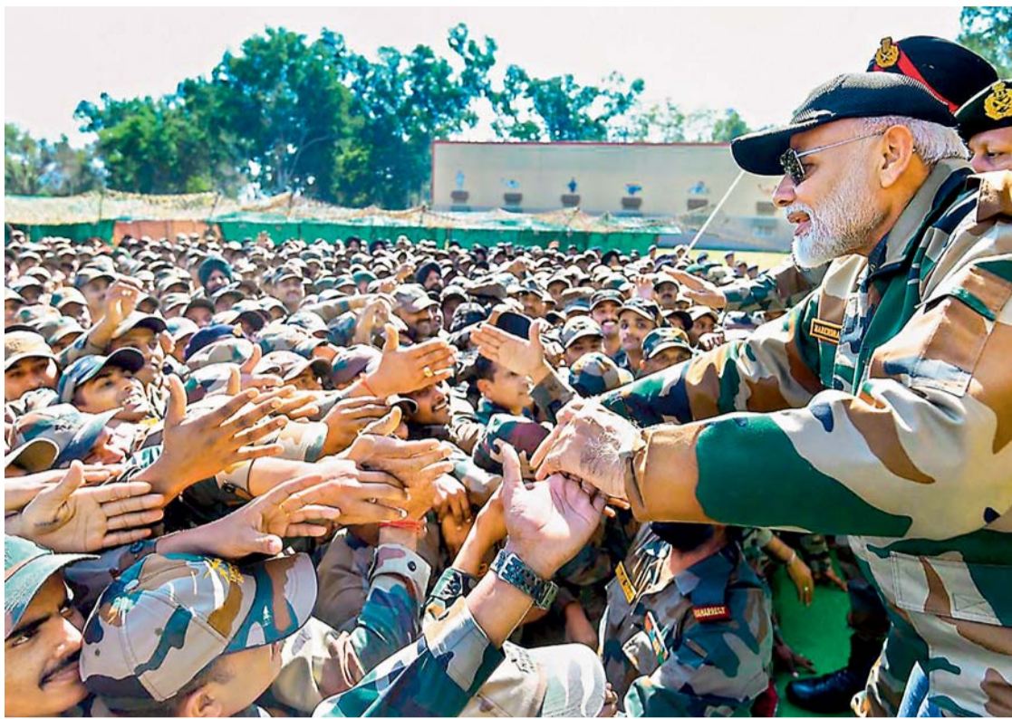
Prime Minister Narendra Modi on Sunday celebrated Diwali with troops deployed in Jammu and Kashmir's border district of Rajouri and praised them for their valour, saying it enables the government to take decisions hitherto considered impossible. — PTI