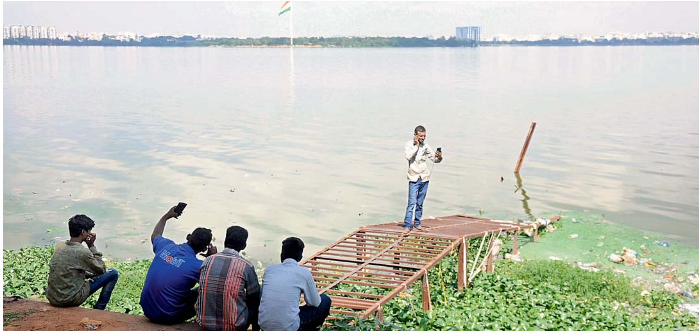
In a dangerous sign, people cross the railing to take selfies at Hussain Sagar, on Monday.