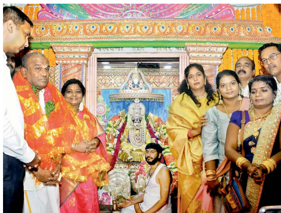
Governor Tamilisai Soundararajan and others post at the Bhagalakshmi temple where she had gone on Diwali.