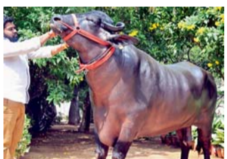
A 1,600 kg bull from Haryana will be a special attraction for the Sadar Utsav Mela on Tuesday.

Traffic from Old Excise Office lane will be diverted towards Vittalwadi. Traffic from Barkatpura Chaman will be diverted towards Barkatpura crossroads or Tourist Hotel. Also, traffic from Brilliant Grammar School (bear Narayanguda flyover) will not be allowed towards Reddy College and will be diverted towards Narayanguda crossroads.