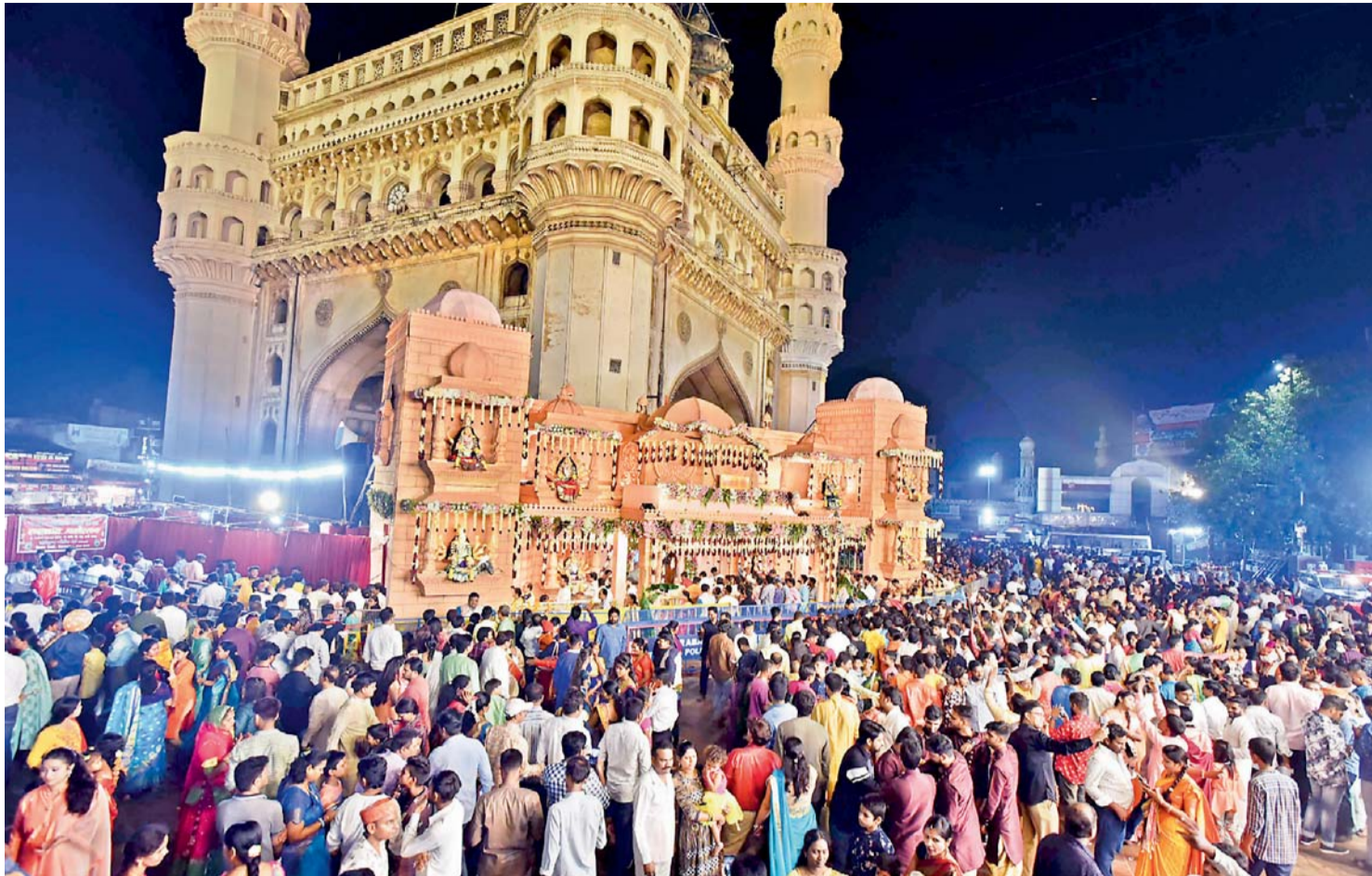
A large number of devotees wait for darshan at the Bhagyalaxmi Temple at Charminar on the occasion of Diwali.