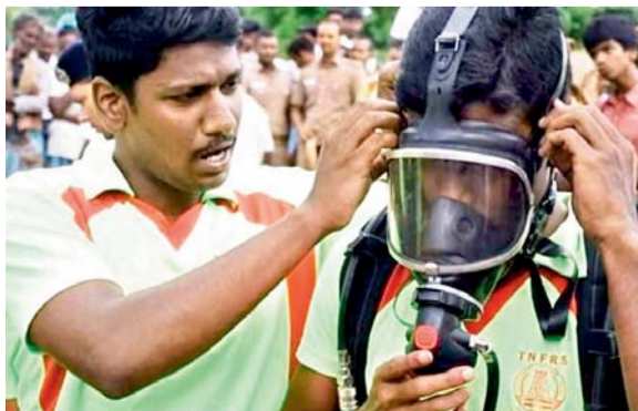
A fire fighter dons a mask to try out a planned descent into the alternate tunnel in Nadukattupatti.

Two Fire and Rescue Services personnel were lowered into the freshly drilled shaft, using a ladder and with necessary support like oxygen, for initial assessment of the condition inside, they said.