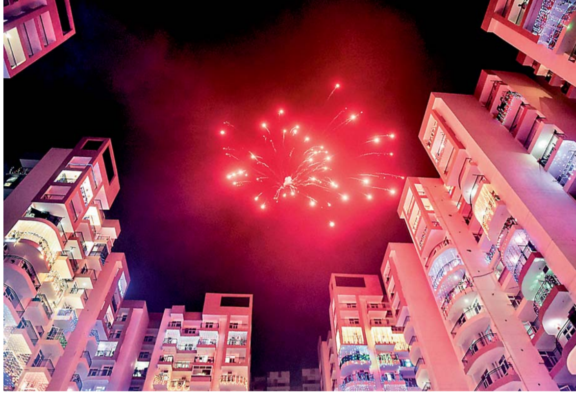
Fireworks illuminate the sky during Diwali celebrations in Ghaziabad.