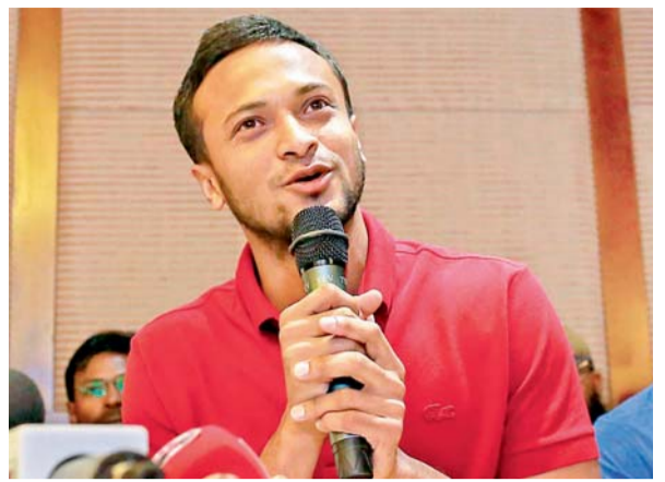
Bangladesh skipper Shakib Al Hasan.