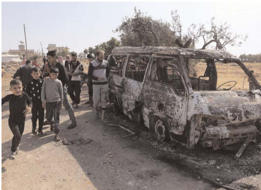
Kids look at a destroyed van near the village of Barisha, in Idlib province, Syria, after an operation by the US military targeted Abu Bakr al-Baghdadi.

Key to the Islamic States is its "kill where you are" ethos, encouraging a far-flung network of followers, including those in the United States, to commit violence wherever they can. That jihadist message is likely to live on, even with the death of al-Baghdadi.