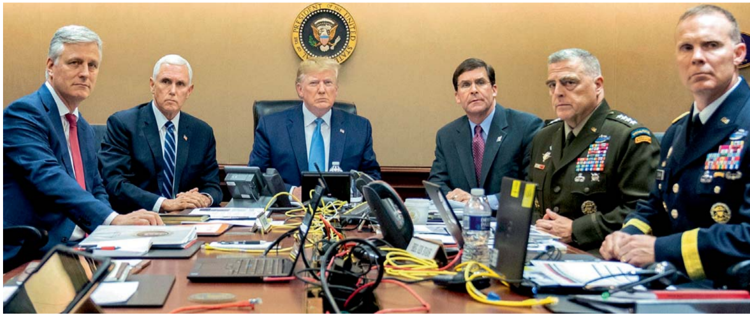
In this photo, President Donald Trump is joined by his team in the Situation Room of the White House in Washington.