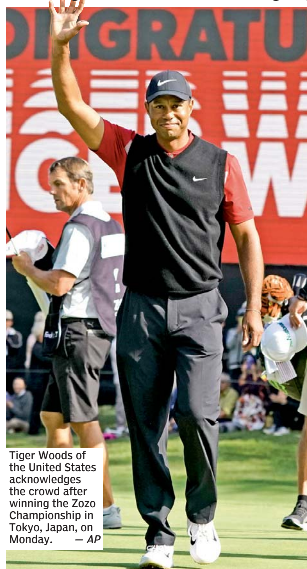
Tiger Woods of the United States acknowledges the crowd after winning the Zozo Championship in Tokyo, Japan, on Monday.

"Sam did it into his fifties and I'm in my early to mid-forties. I've been very fortunate to have had the career