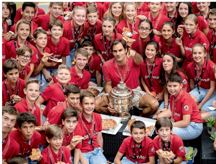
Roger Federer of Switzerland poses with the trophy and ball kids after defeating Australia's Alex De Minaur in the final of the Swiss Indoors ATP tennis tournament in Basel on Sunday. Federer won 6-2, 6-2.

"I couldn't be happier that I was able to do it here in Basel. It's been a great week, fans were wonderful, like in other years. I really enjoyed myself being back in Basel. I may have had some good luck (with a quarterfinal walk-over against Stan Wawrinka)," he said.