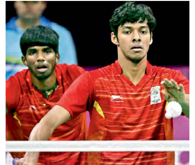
Satwiksairaj Rankireddy (left) and Chirag Shetty.

Lakshya, meanwhile, will look to grab his third title of the season after having claimed crowns at the Belgian international and Dutch Open. — PTI