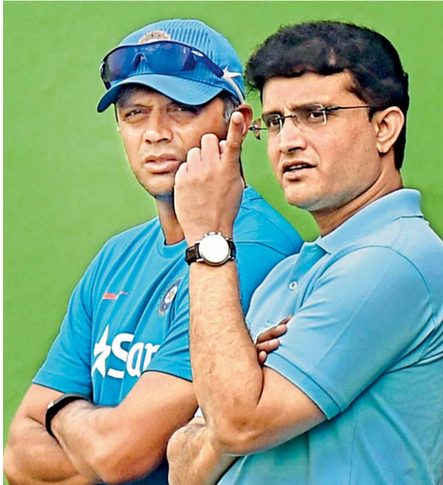
Rahul Dravid and Sourav Ganguly.