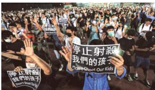
Rising tensions: Protesters near the site where the police shot a protester in Hong Kong on Tuesday.

More than 100 people were wounded during Tuesday’s