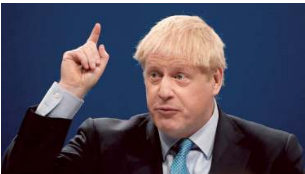
Give-and-take deal: U.K. PM Boris Johnson delivering a speech at the Conservative Party conference in Manchester.

to a Brexit deal. The U.K. proposes to do that by keeping Northern Ireland closely aligned to EU rules for trade in goods, possibly for an extended period. The proposal involves “an all-island regulatory zone on the island of Ireland, covering all goods including agri-food.” That would keep Northern Ireland in a regulatory zone with the EU for food, agricultural and industrial products, removing the need for checks, but the EU will carefully study the details. The status has no time limit though it would have to be renewed every four years by the Northern Ireland government, Mr. Johnson said. Under the plan there would still need to be customs checks, but Mr. Johnson suggested in his letter that they could be done away from the border at “other points on the supply chain.”