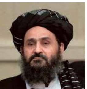
Mullah Abdul Ghani Baradar

Zalmay Khalilzad, Washington’s special peace envoy,