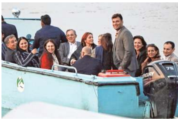
Ground survey: Members of the European Union delegation at the Dal Lake in Srinagar on Tuesday.

On arrival, the European Union (EU) delegates drove through Srinagar city from the airport to their hotel located near the Dal lake, under a heavy security blanket.