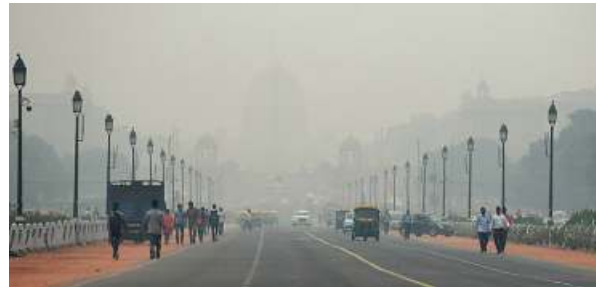
The visibility level dropped with smog shrouding the city on Tuesday.

The contribution of crop residue burning in neighbouring States to the air pol-