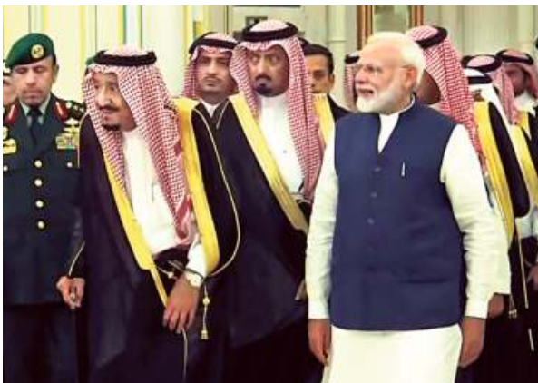
Prime Minister Narendra Modi with the King of Saudi Arabia, Salman bin Abdulaziz Al Saud, in Riyadh on Tuesday.

The Indian leader thanked the hosts for far-sighted economic planning for Saudi Arabia and praised Crown Prince Mohammed Bin Salman for his leadership role in giving a new vision to one of the largest energy suppliers in the world. "In talks with the Crown Prince today, we agreed on setting up the Strategic Partnership Council that will help India ad-