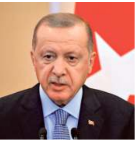
Recep Tayyip Erdogan

killing of 1.5 million Armenians by the Ottoman Empire between 1915 and 1923 amounted to genocide, a claim recognised by some 30 countries.