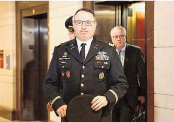
More testimonies: Lieutenant Colonel Alexander Vindman testified in the impeachment inquiry on Tuesday.

The rules give Mr. Trump and his lawyers their first opportunity to take a direct role and argue their case before the Judiciary Committee, calling for more testimony or evidence and cross-examining witnesses, the House Rules Committee