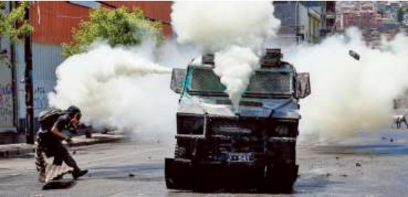
Domestic crisis: A riot police vehicle releasing tear gas during a protest against Chile’s government in Valparaíso.

vernment is to focus first and foremost on fully restoring public order and social peace,” he added.