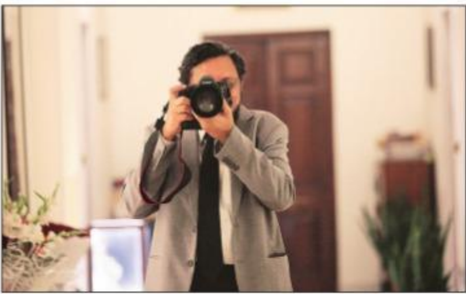
Justice Sharad Arvind Bobde tries out his new camera at his residence in New Delhi on Wednesday.