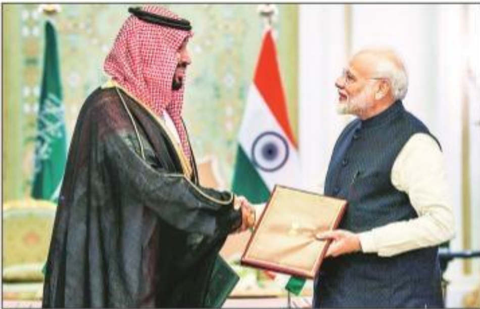
Prime Minister Narendra Modi with Saudi Crown Prince Mohammed bin Salman in Riyadh on Tuesday.