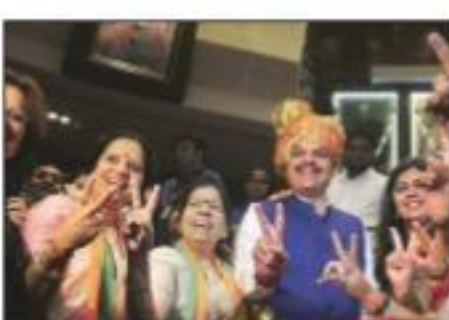
Fadnavis in Mumbai on Wednesday.

Sena MP Sanjay Raut, who had earlier voiced his party's demand for equal share in power, said it was necessary for the party to stay in the BJP-led alliance in the larger interest of Maharashtra, but without compromising on "respect".