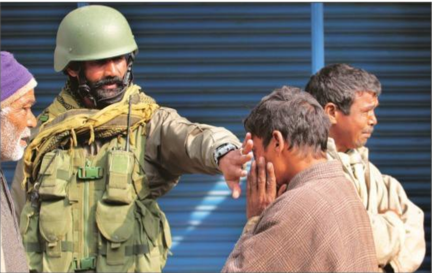
A soldier consoles migrant labourers in Kulgam.