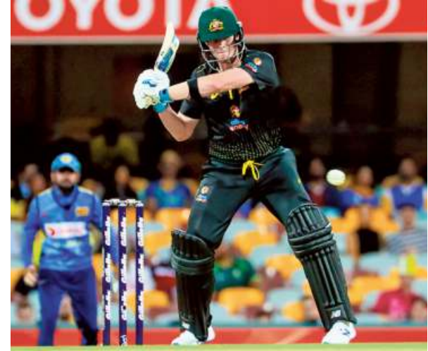
Back with a bang: Steve Smith marked his return to T20Is with an unbeaten half-century.

Steve Smith and David Warner's first batting partnership on home soil since their ball-tampering suspensions helped Australia to a series-sealing nine-wicket victory over Sri Lanka in the second T20 International at the Gabba on Wednesday. Smith (53 n.o., 36b, 6x4) joined Warner (60 n.o., 41b, 9x4) at the crease after the third ball of the innings and the pair's unbeaten 117-run stand mowed down Sri Lanka's total of 117 in 13 overs. The win gave Aaron Finch's team a 2-0 lead in the three-match series, having thrashed the visitors by 134 runs in Sunday's opener. Dominant performances back-to-back from Australia's bowlers ensured the series win, with the pacemen snaring four wickets to match the spinners as the Lankan batsmen struggled with the pace and bounce of the Gabba pitch. “Yeah, we played well tonight, I thought the bowlers did a terrific job early on,” said Smith. “It's good to be back now, obviously (there is) a T20 World Cup next year that I'd love to be a part of”