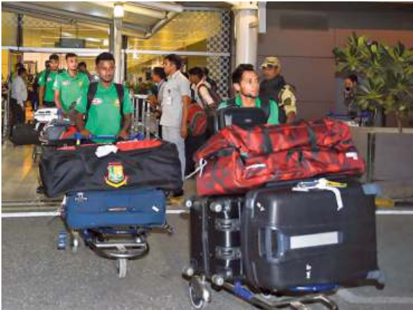
Tough road ahead: Bangladesh players arrive in New Delhi for their India tour which begins with the T20 series.

Controversies chased the players like shadows culminating in the suspension of Shakib Al Hasan, but Bangladesh's T20 skipper Mahmudullah said on Wednesday that the top player's absence from the India tour will act more as motivation than handicap. A 15-member squad arrived here, a day after one of its greatest players was handed a two-year ban by the ICC, for a tour that will have three T20Is and two Tests. “We have to play with our heart for the country,” Mahmudullah was quoted as saying by ESPN Cricinfo . Honour “I think this (Shakib's absence) will work as motivation for us. I think there's no greater honour than playing for the country. The responsibility to lead the side lies with me, so I will try to give it my all,” said the T20 skipper and a veteran of many battles. Mahmudullah, however, admitted that it will be a difficult assignment against In-