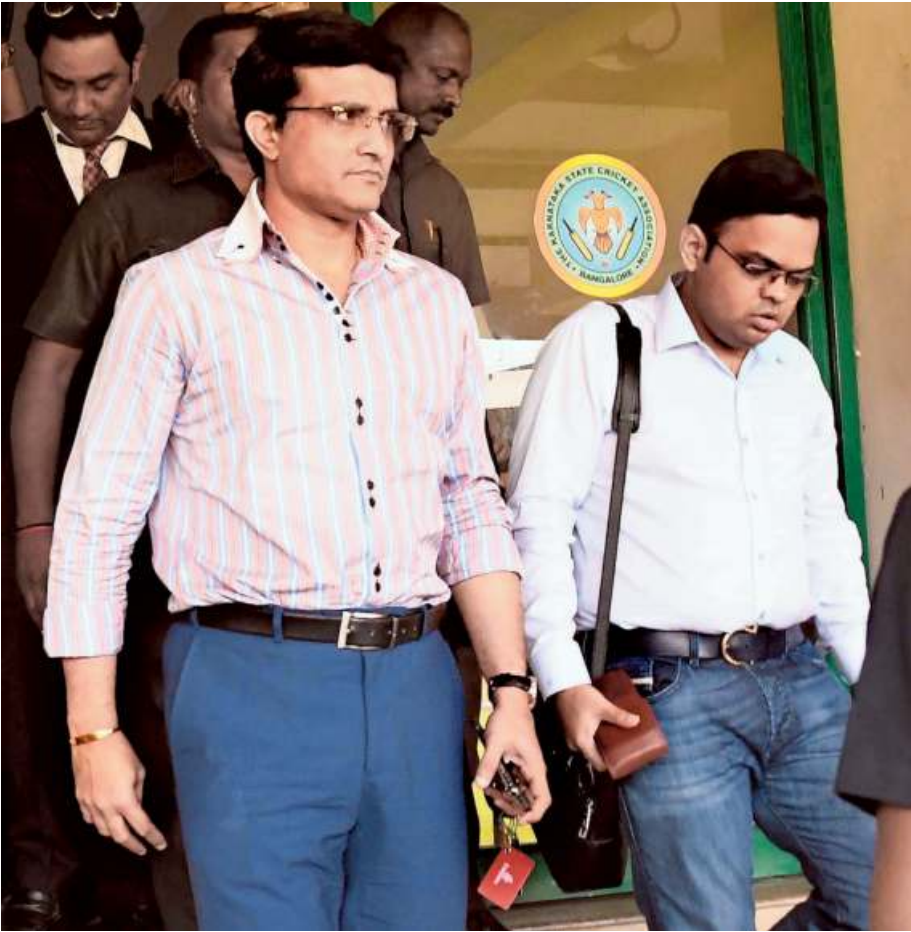
On a mission: BCCI president Sourav Ganguly and secretary Jay Shah arrive at the National Cricket Academy.

Grass-roots cricket “All the office-bearers wanted to meet Dravid, and it was a very good meeting,” said sources. “He spoke at length on how to take NCA and Indian cricket forward. It was a very detailed presentation. The NCA has turned into a