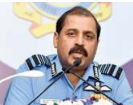
Air Chief Marshal R.K.S. Bhadauria in New Delhi on Friday.

The crash claimed the lives of all six personnel on board and one civilian on the ground. "The Court of Inquiry (CoI) into the accident completed its work last week... Disciplinary action will be taken against two officers involved in the crash,"