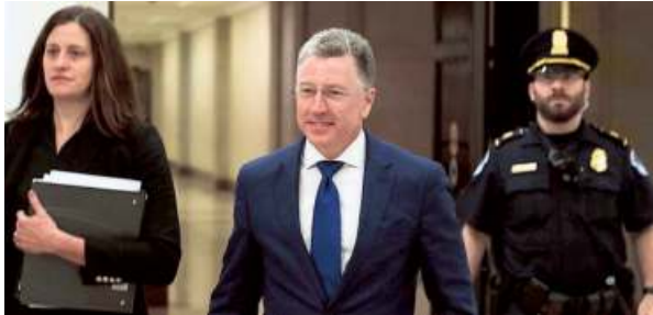
Legal tangle: Kurt Volker leaving after being questioned by House investigators in Washington on Thursday.

Their work on the statement is new evidence of how Mr. Trump began driving senior diplomats to bend American foreign policy to the President’s political agenda in the weeks after the July 25 call between the two leaders. The statement was worked on by Gordon Sondland, the U.S. Ambassador to the European Union, and Kurt Volker, then the State Department’s envoy to Ukraine, according to the three people in the know.