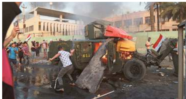
On the rampage: Anti-government protesters burning an armoured police vehicle during a protest in Baghdad. ■ AP

REUTERS BAGHDAD The death toll from days of violent demonstrations across Iraq surged to 44 on Friday, most of them killed in the last 24 hours, as unrest rapidly accelerated across the country despite a plea from the prime minister for calm. In an overnight TV address, Prime Minister Adel Abdul Mahdi said he understood the frustration of the public but there was no “magic solution” to Iraq’s problems. He made reform