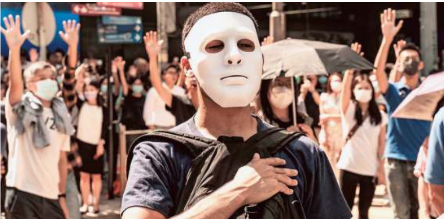
Face of protests: Demonstrators marching on a street in Hong Kong on Friday.

REUTERS HONG KONG Hong Kong’s embattled leader Carrie Lam invoked colonial-era emergency powers on Friday for the first time in more than 50 years in a dramatic move intended to quell escalating violence in the Chinese-ruled city. Ms. Lam, speaking at a news conference, said a ban on face masks would take effect on Saturday under the emergency laws that allow authorities to “make any regulations whatsoever” in whatever they deem to be in the public interest.