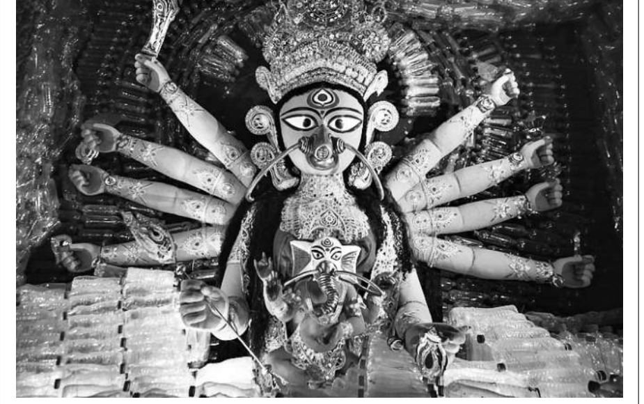
An idol of Durga, shown with a mask on to raise awareness against environment pollution and plastics, at a community puja pandal in Kolkata on Saturday

Will meet Modi to seek more funds for flood in K'taka: CM