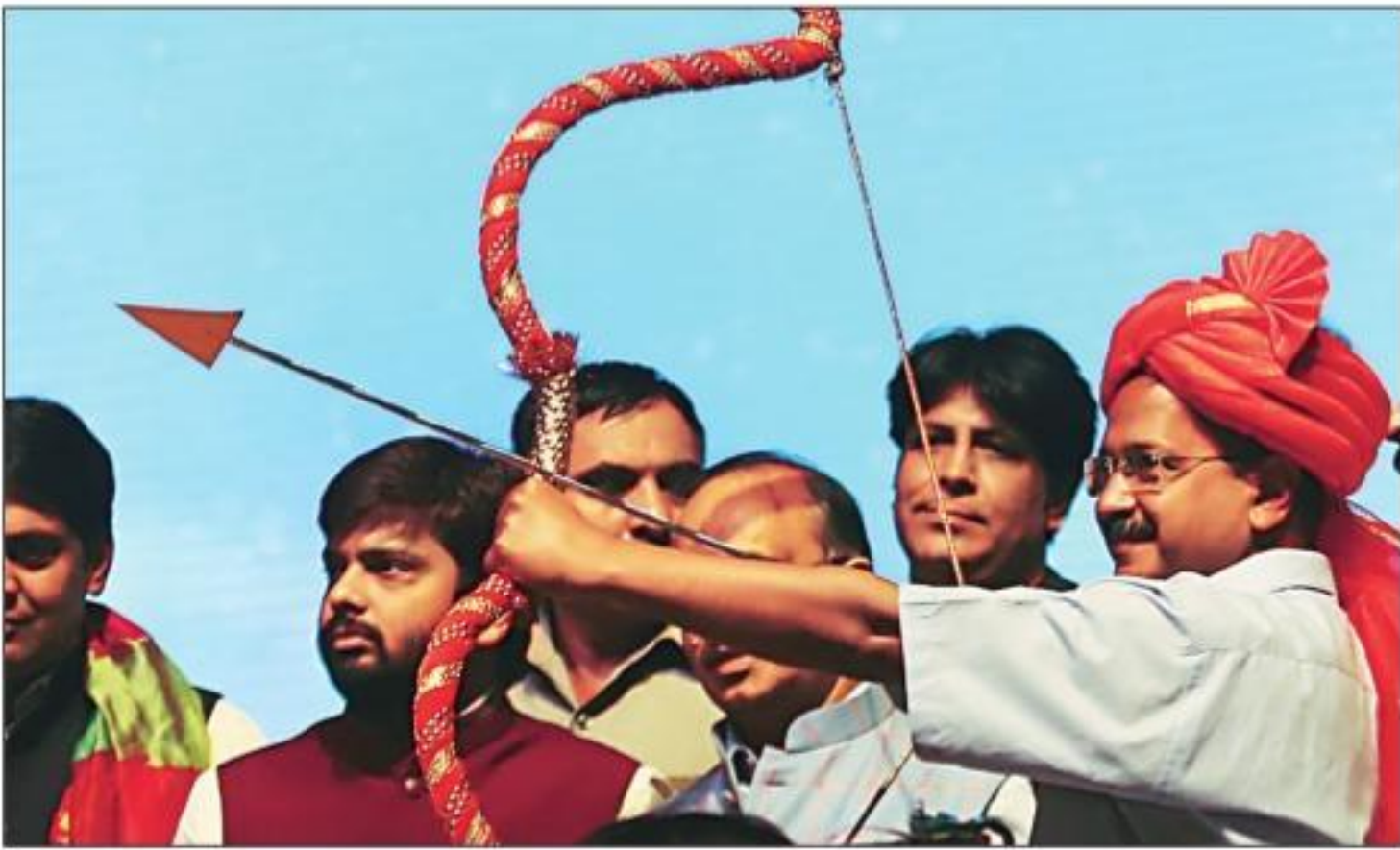
CM Arvind Kejriwal at a Dussehra event near Red Fort Tuesday. He said Delhiites have slayed dengue and managed to bring pollution levels under control, and urged people to defeat ‘Ravana-like forces’ in society.

“This is unfortunate and beyond my understanding. Why is (Narendra) Modi’s government working with such hostility towards us? He (Kejriwal) wasn’t going on a vacation but to hold discussions with mayors of 100 cities of Asia and present a better picture of our country on efforts to abate pollution. We ap-