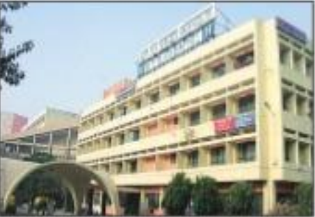
The study was started by Guru Tegh Bahadur (GTB) Hospital last year