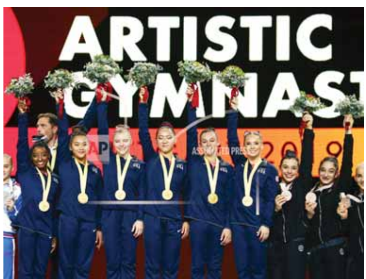
Team USA celebrates winning the gold medal in the women's team final at the Gymnastics World Championships in Stuttgart, Germany on Tuesday. Left is team Russia, silver medal, and right is team Italy, bronze medal.

The Louvre Conservation Center in Lievin, northern France, will help protect valuable works from the swelling Seine River as major floods grow more frequent and the riverside museum has found itself lacking safe storage space. Protecting the museum's works -- many of which are out of public view in the belly of the former palace -- has taken on additional urgency in recent years after severe floods in 2016 and 2018 forced the Louvre to evacuate endangered artworks from basements and to close exhibits.