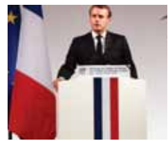
claimed by Islamist radicals since 2015.

At the same time he warned against lapsing into a climate of permanent suspicion, assuring: "This is not a fight against a religion but against the distortion of it which leads to terrorism." Thursday's attack brought to 255 the number of people killed in attacks blamed on, or