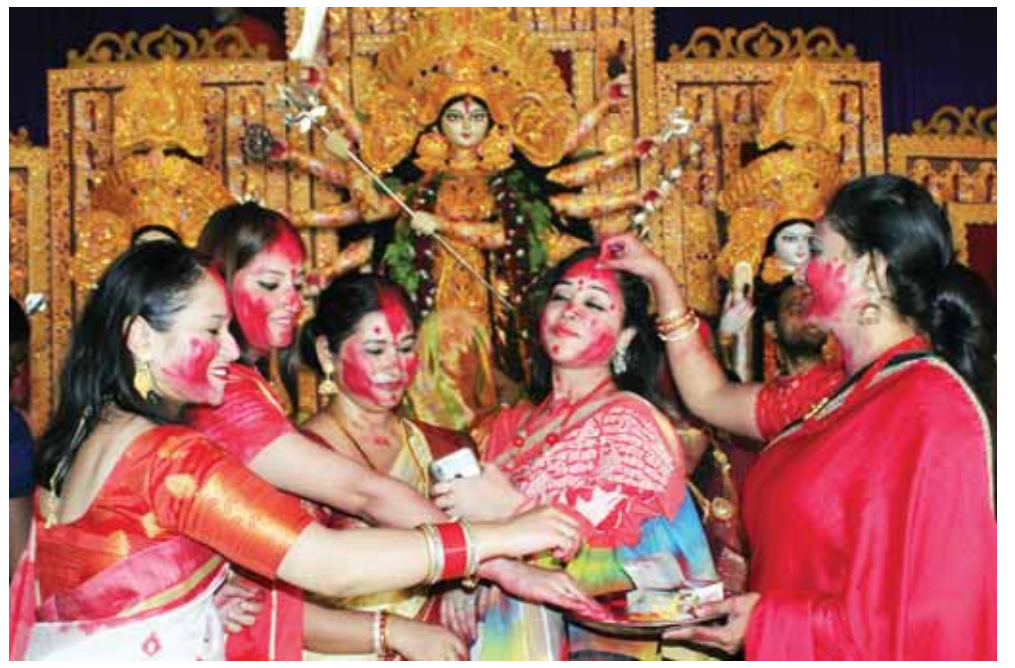
Married women celebrate as they apply vermilion during Sindoor Khela on Vijayadashmi in New Delhi on Tuesday