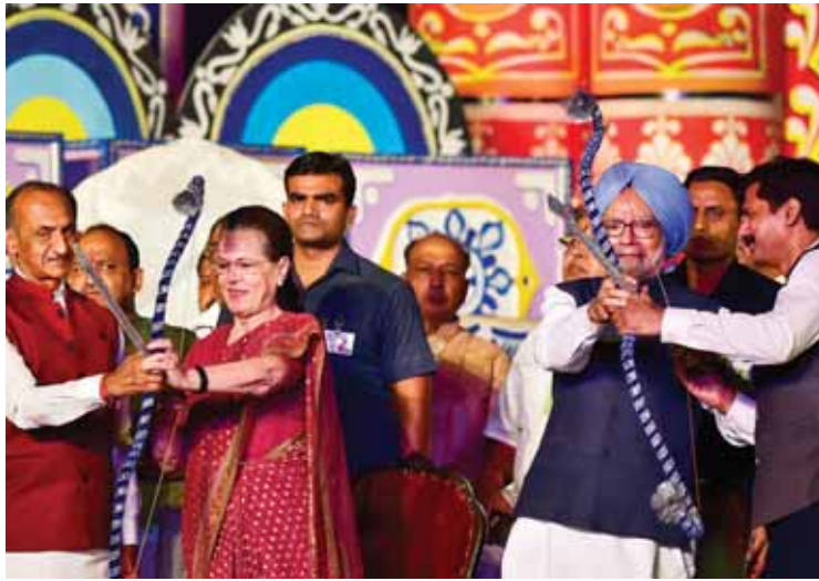
Congress president Sonia Gandhi and former Prime Minister Manmohan Singh prepare to shoot arrows at the effigy of demon-king Ravana during Dussehra celebrations at Red Fort in New Delhi on Tuesday

Addressing the RSS's Vijayadashmi rally in Nagpur on Tuesday morning, Bhagwat said it was wrong to use the term lynching in the Indian