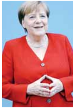
Johnson unveiled a new plan last week aimed at keeping Britain's border with EU member Ireland free-flowing after Brexit -- a crucial issue in the divorce talks between Brussels and London.

In Berlin, a spokesman for the German government confirmed to AFP the two leaders had spoken but said he would not comment on the content of the call.