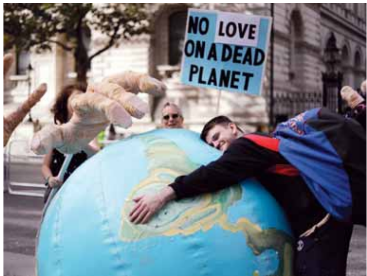
An Extinction Rebellion climate change protester hugs an inflatable planet Earth near Downing Street in London on Tuesday. Hundreds of climate change activists camped out in central London on Tuesday during a second day of world protests by the Extinction Rebellion movement to demand more urgent actions to counter global warming.

Netanyahu is not required to step down as prime minister if indicted, only if convicted with all appeals exhausted.