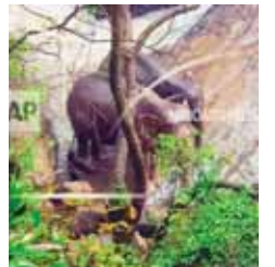
died when trying to reach a dead calf.

Park officials say the first group of elephants evidently