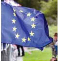
response to a Brexit plan proposed by Johnson.

The German government had no immediate comment. EU leaders have demanded more "realism" from Britain in