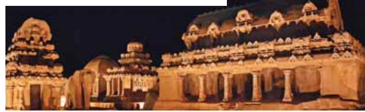
An illuminated view of Mahabalipuram temples ahead of the second informal summit between Prime Minister Narendra Modi & Chinese President Xi Jinping in the seaside temple town of Mamallapuram on Tuesday

whom the Chinese rulers had entered into a security pact to counter the influence of Tibet, according to Narayanan, the former NSA. S Ramachandran, veteran archaeologist, said Tamil Nadu and China had ties dating back to the Song Dynasty (960-1279).