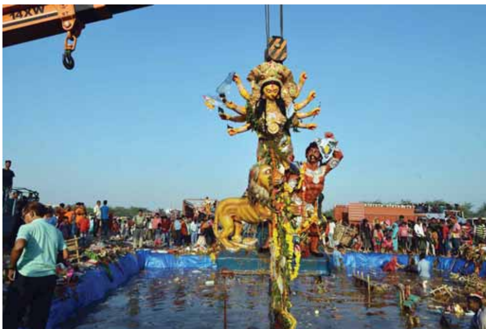
Devotees immerse idol of Goddess Durga in the Kalindi Kunj pond at the end of Durga Puja festival in New Delhi on Tuesday

Further, the committee has also launched a massive awareness drive to educate and awaken visiting devotees to maintain hygiene, cleanliness etc," he added.