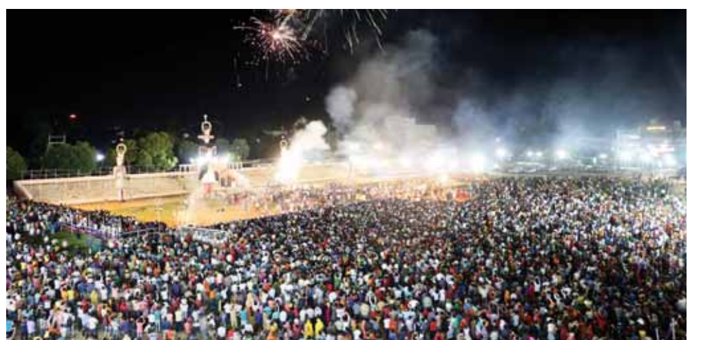
Devotees watch an effigy of demon king Ravan being burnt on the occasion of Vijayadashmi in Ajmer on Tuesday

Amid tight security cover, puja organisers were seen flocking the Ganges ghats in the city, which has been decked up for the occasion.