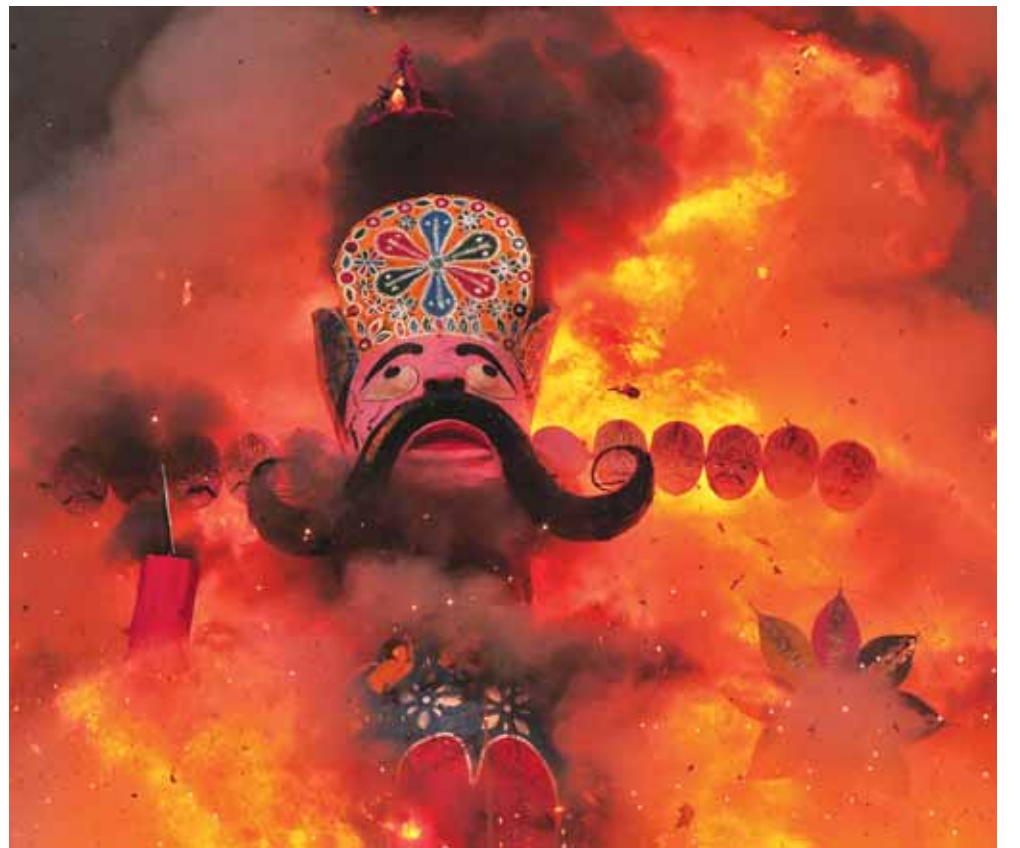
The effigy of demon king Ravana in flames during Dussehra celebrations in Jammu on Tuesday