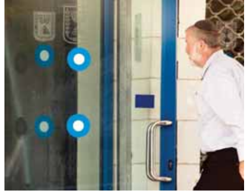
Israel's attorney general Avichai Mandelblit arrives for the pre-indictment hearing for Prime Minister Benjamin Netanyahu at the Ministry of Justice in Jerusalem on Monday. State prosecutors and Netanyahu's lawyers are wrapping up the pre-indictment hearing over a slew of corruption allegations.

allegations against him, calling the corruption investigation a "witch-hunt" and alleging it has been motivated by his enemies' desire to force him from office.