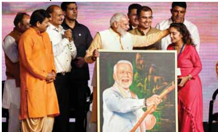
Prime Minister Narendra Modi being presented with a portrait by a girl while attending Dussehra celebrations of Dwarka Sri Ram Leela Society at Dwarka in New Delhi on Tuesday. BJP MPs Manoj Tiwari and Parvesh Singh Verma are also seen.

speaking at a Dussehra event organised by Dwarka Sri Ram