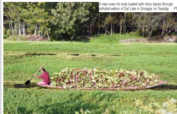
A man rows his boat loaded with lotus leaves through polluted waters of Dal Lake in Srinagar on Tuesday