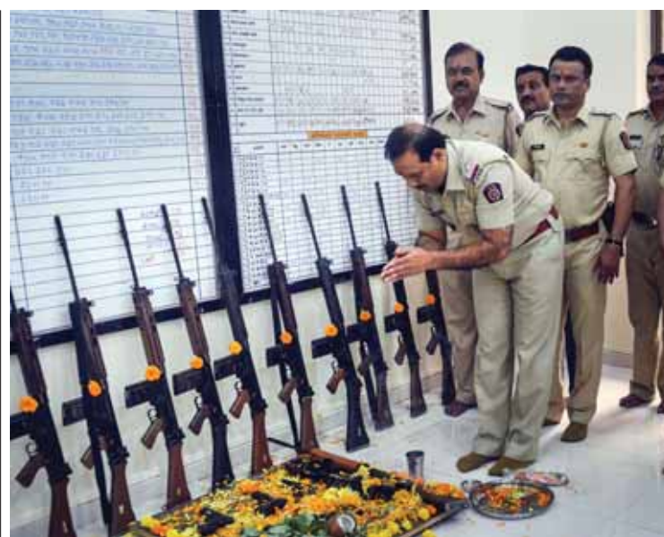
Police officers perform traditional Shastra Puja (weapon worship) at a police station on the occasion of Vijaya Dashmi in Mumbai on Tuesday

He also asked the party workers to ensure the victory of the party in the October-21 bypolls on Mandawa (Jhunjhunu) and Khimsar (Nagaur) assembly constituencies of the state.