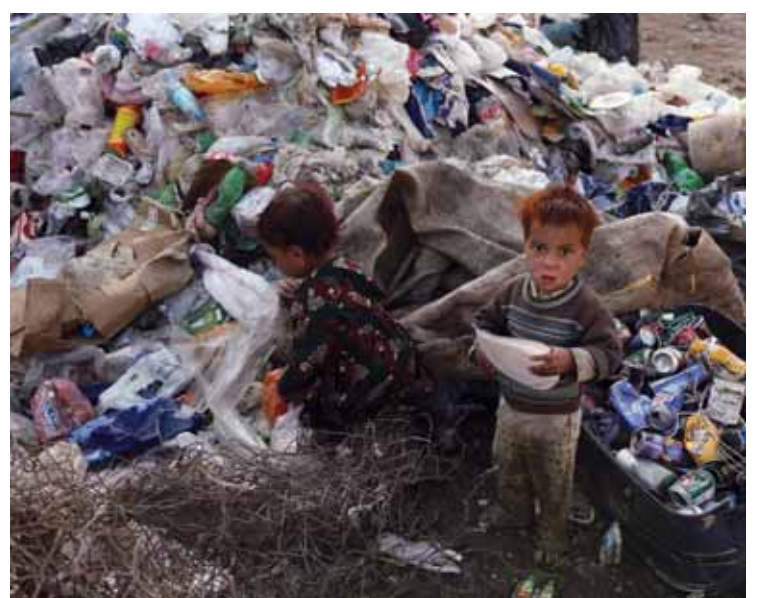
An Afghan brother and sister play at a recycling center in Kabul, Afghanistan on Tuesday