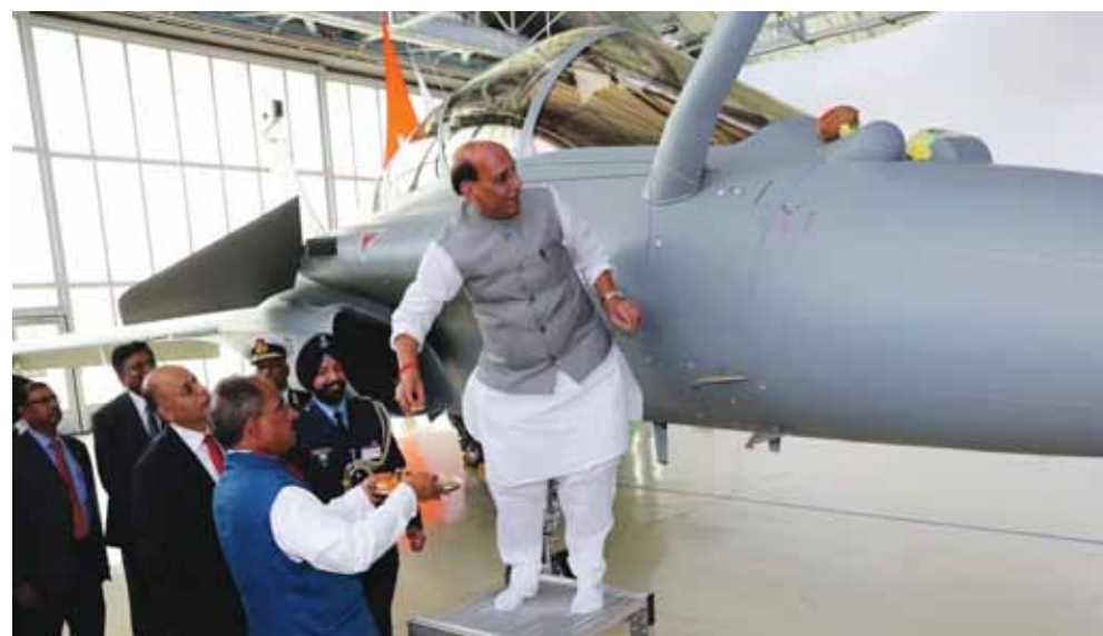
Defence Minister Rajnath Singh has a ritual gesture onto a Rafale jet fighter during a handover ceremony at the Dassault Aviation plant in Merignac, near Bordeaux, southwestern France on Tuesday