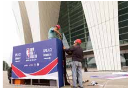
Workers dismantle signage for an NBA fan event scheduled to be held on Wednesday night at the Shanghai Oriental Sports Center in Shanghai, China on Tuesday. Chinese state broadcaster CCTV announced Tuesday it will no longer air two NBA preseason games set to be played in the country.

An associated hashtag, "Several stars quit NBA games", was the most-discussed on China's leading social media platform Weibo on Tuesday