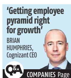
COMPANIES Page 18

Cognizant plans to remove around 7,000 mid- to senior-level jobs and shut down its content moderation business, further impacting 6,000 jobs, as part of its '2020 Fit for Growth Plan'. The Nasdaq-listed IT services firm also posted largely in-line numbers for the September quarter on Thursday. The firm has close to 70 per cent of its global headcount in India.