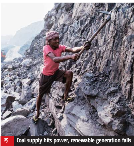
P5 Coal supply hits power, renewable generation falls

The sector, with above 40 per cent weight in the index of industrial production, grew 1.3 per cent in H1FY20, against 5.5 per cent in the same period of the previous fiscal. Production by the eight industries declined 0.8 per cent in the Q2FY20, against 3.4 per cent growth in Q1 and 5.4 per cent expansion last year. Turn to Page 19 ▶