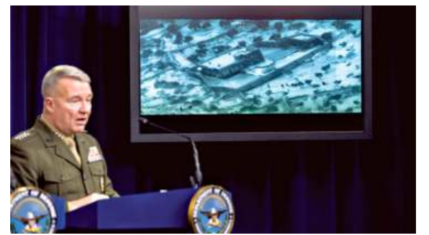
Ground zero: Gen. Kenneth McKenzie giving detailed account of the U.S. raid that resulted in the death of IS chief Abu Bakr al-Baghdadi. He also released videos of the operation.

"The Islamic State shura council convened after confirming the martyrdom of