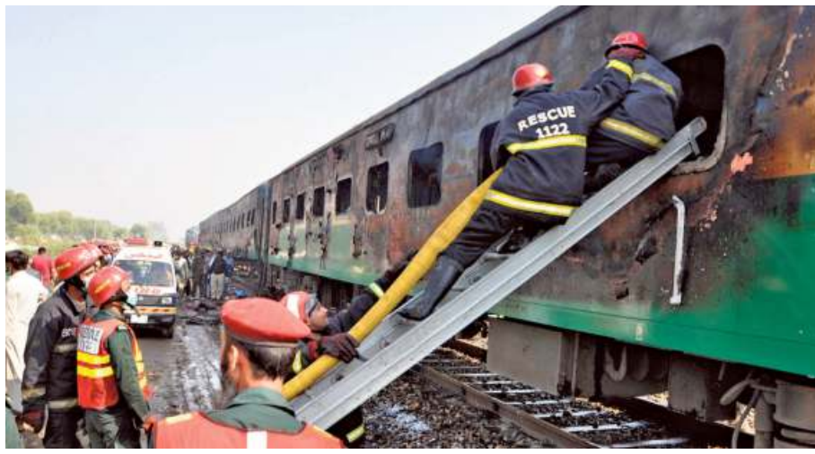
Rescue effort: Workers looking for survivors on the train in Liaquatpur.

Some of the passengers had been cooking breakfast when two of their gas cylinders exploded, Ali Nawaz, a senior Pakistan Railways official, said.