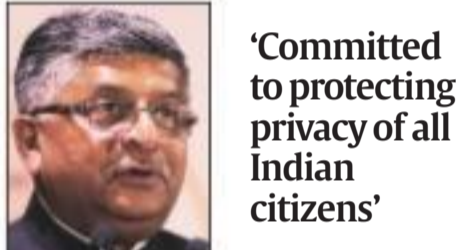
'Committed to protecting privacy of all Indian citizens'

ON THE day The Indian Express reported that WhatsApp had confirmed that Indian journalists and human rights activists were among targets of surveillance by operators using Israeli spyware Pegasus to take over phones via WhatsApp, the government,