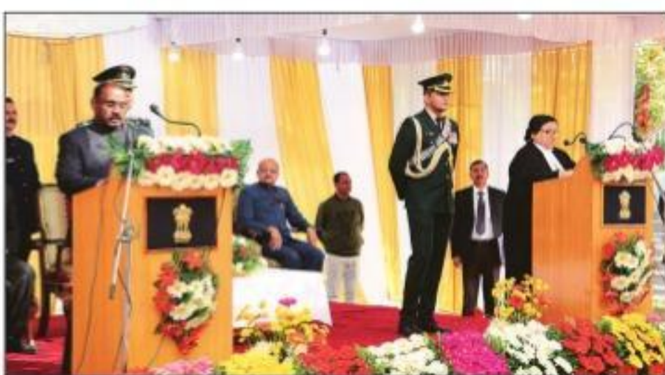
Girish Chandra Murmu (left), Radha Krishna Mathur take oath as the first L-Gs of J&K and Ladakh respectively on Thursday.