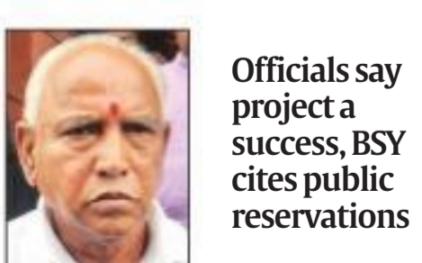
Officials say project a success, BSY cites public reservations

But on September 30, ignoring objections from the Revenue Department, the new BJP government cancelled an order issued four years ago, making UPOR cards mandatory for property registration under the project.