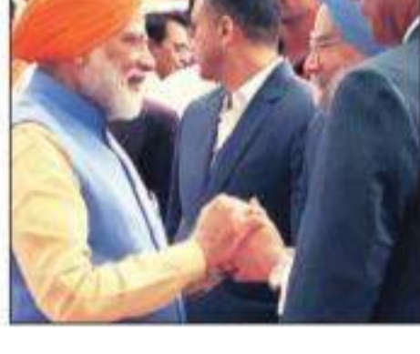
Modi with Manmohan Singh