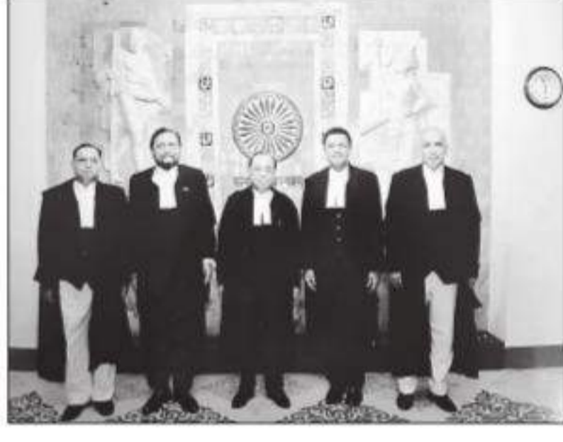
AFTER THE RULING: Justice Ashok Bhushan, Justice S A Bobde, Chief Justice of India Ranjan Gogoi, Justice D Y Chandrachud and Justice S A Nazeer.