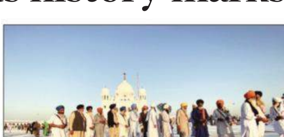
Pilgrims visit Kartarpur, Saturday.

Welcoming the Indian pilgrims, including his cricketing friend and MLA Navjot Singh Sidhu, Imran Khan said that if the Kashmir issue was resolved, borders could open and trade