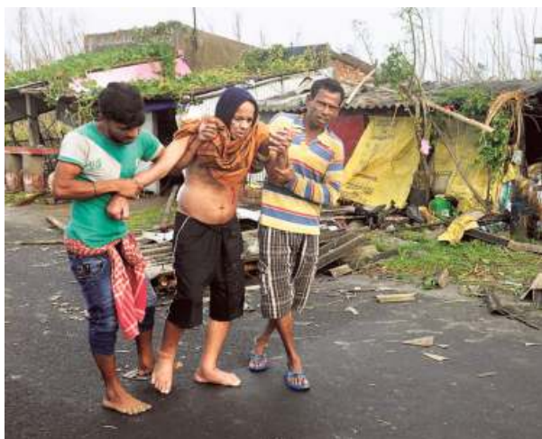
Heavily hit: Scenes of destruction in the Bakkhali area in West Bengal's South 24 Parganas district. At least 2,473 houses were destroyed in several coastal districts. ■ ANI