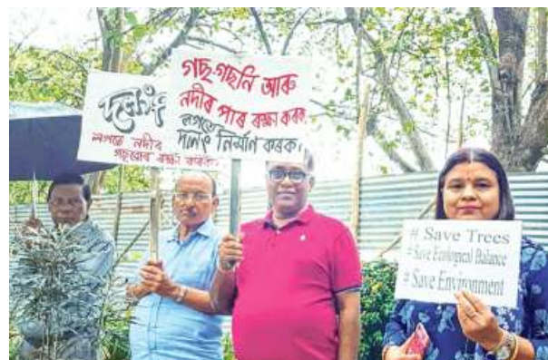
The demonstrations were inspired by protests in Mumbai against the axing of trees in Aarey Colony.

Sunday's human-chain protest was a follow-up of the Coordination Committee of Citizens' October 30 memorandum to the State Finance and PWD Minister Himanta Biswa Sarma for re-designing the proposed bridge to save the trees and the riverfront.