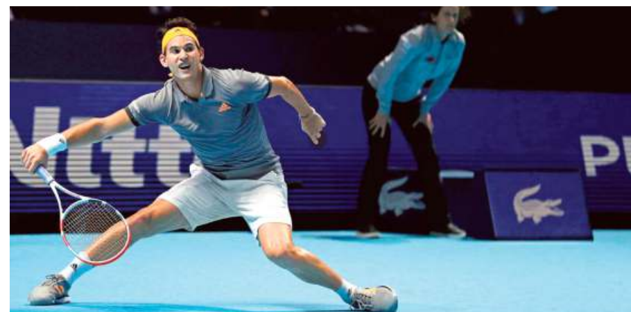
Winning strategy: Thiem's aggressive game paid dividends against Federer.

Djokovic, aiming to claw back the year-end number one ranking from Rafael Nadal, had destroyed debutant