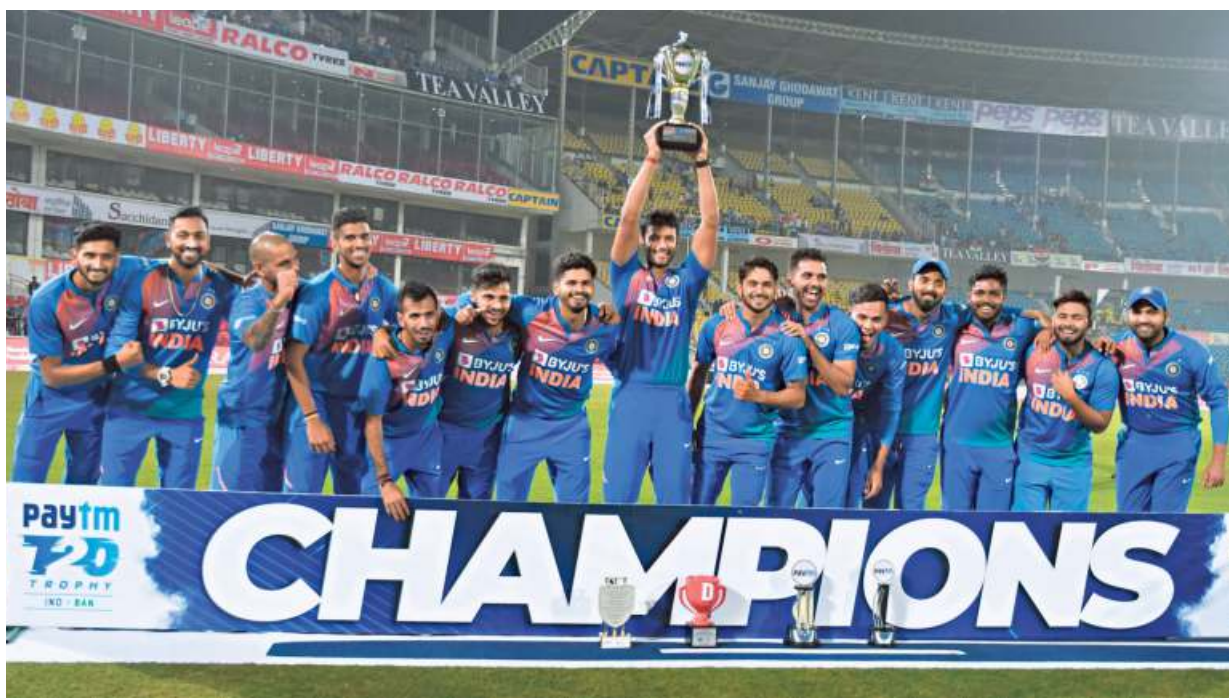
Way to go! India rallied from an initial setback to run out deserving winner of the series.

"Uparwala karaata hain (God makes it happen)," he said, rather modestly, at the presentation. "You don't think you will ever take six for seven in a T20. Usually I