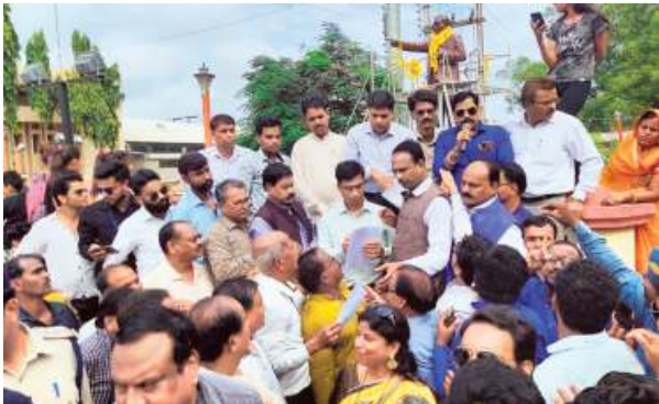
Members of Dalit groups taking part in the Swabhiman rally in Neemuch on November 3.