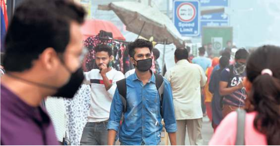
PM2.5 levels in the city reached nearly four times the safe limit on Monday.