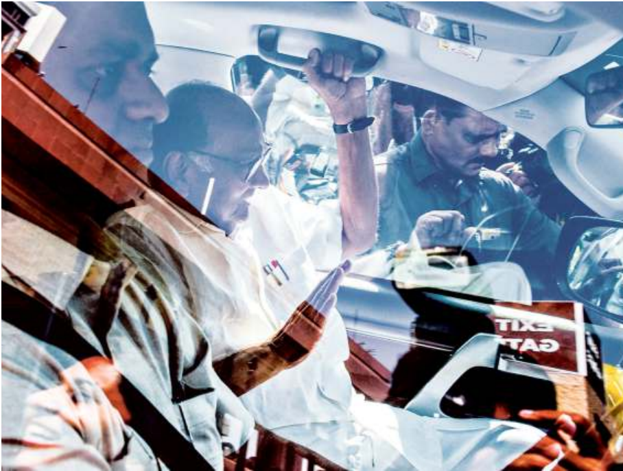
Day of parleys: Nationalist Congress Party president Sharad Pawar leaves a five star hotel in Mumbai on Monday after meeting Shiv Sena chief Uddhav Thackeray.

As this development unfolded in Delhi, senior Sena leader and Rajya Sabha member Sanjay Raut held a press conference around 10 a.m. in Mumbai. “The Governor has given us 24 hours’ time while the BJP was given 72 hours. It is our responsibility to form a government, but when many people are taken together, it requires time. Some people are working to push this State towards President’s