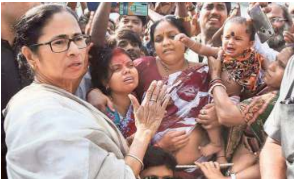
West Bengal Chief Minister Mamata Banerjee meeting Cyclone Bulbul victims in Kakdwip on Monday.