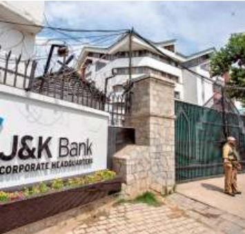
The ED suspects that several companies were incorporated only for laundering money.

Two of the cases being investigated by the ED are related to a group whose two companies are said to be involved in a bank fraud involving over ₹300 crore.