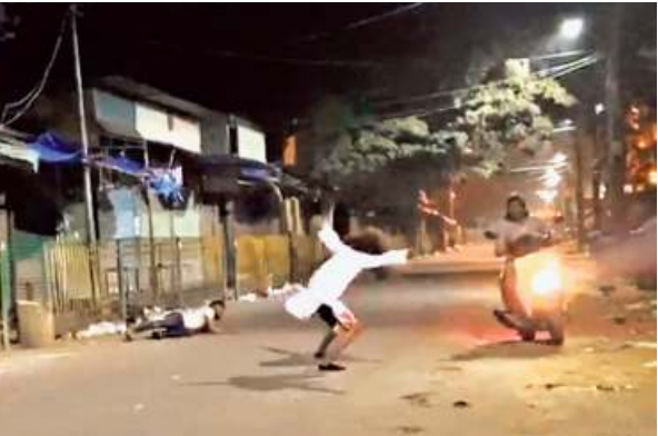
Joke is on you: A video grab shows a person dressed as a ghost trying to scare a two-wheeler rider.

The accused were into making prank videos and uploading them on social media for traction. As per the plan, one of the accused, wearing a long white kurta and a wig and splashing red paint over the dress to make it look like blood, started scaring motorists, pedestrians and people sleeping on pavements, and created