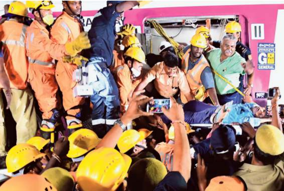
Mega effort: The loco driver being brought out of the mangled MMTS coach by the Railway and NDRF personnel after an eight-hour-long operation.