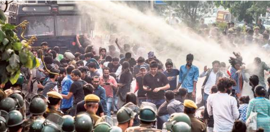
High drama: Police personnel using water cannon to disperse students protesting against the JNU administration's 'anti-students' policies on Monday.

The agitated students broke through barricades set up at the campus gates as well as barricades on Nelson