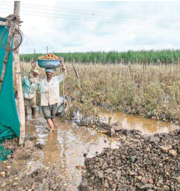
Need of the hour: Heavy monsoon and post-monsoon rain has damaged crops across the State this year.