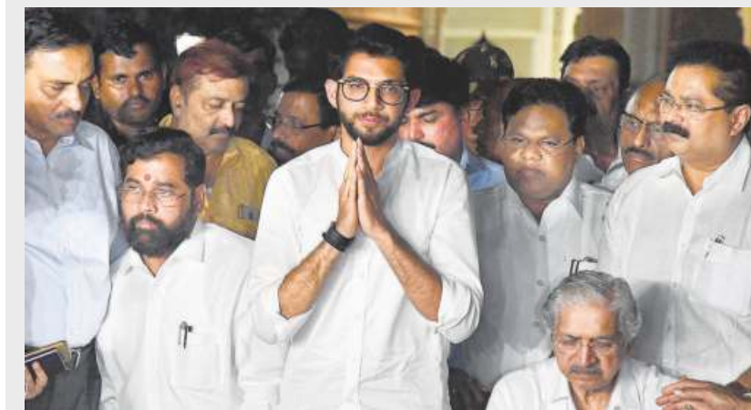
Turmoil continues: Shiv Sena youth wing chief Aaditya Thackeray addressing media after meeting the Governor in Mumbai on Monday.

The developments came on a day when the Shiv Sena's lone representative in the Union Cabinet, Arvind Sawant, resigned as the Union Heavy Industries Minister, and the party severed its ties with the National Democrat-