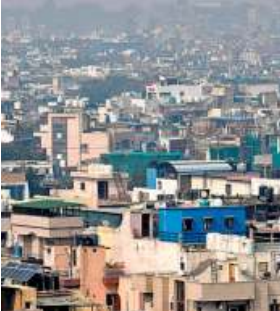
The population of NCR is expected to increase from 6 crore now to 11 crore in 2041.