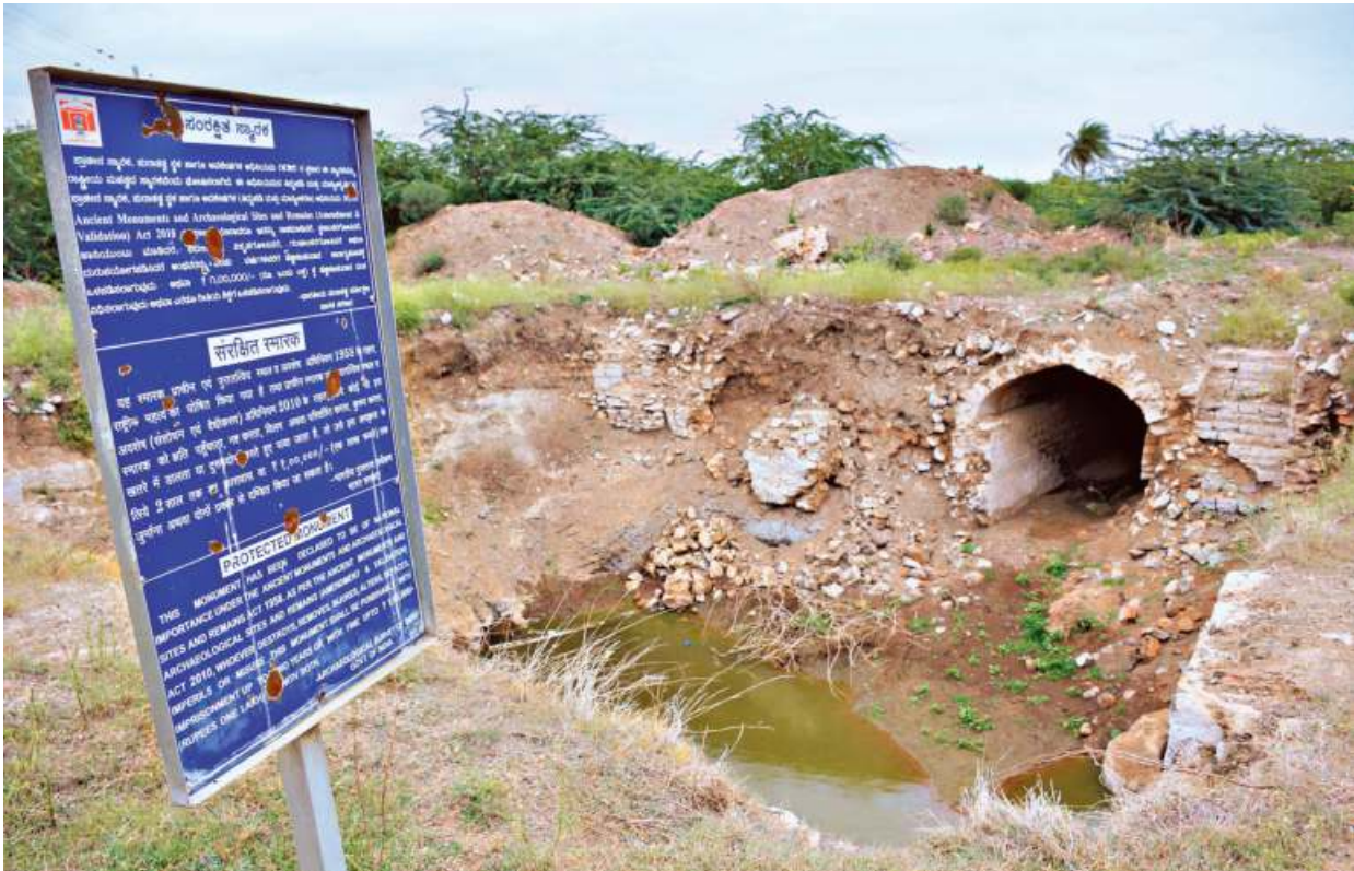
Ahead of times: According to historians, the Adil Shahis built the Karez underground water system in the 16th century to supply water to Vijayapura in Karnataka.