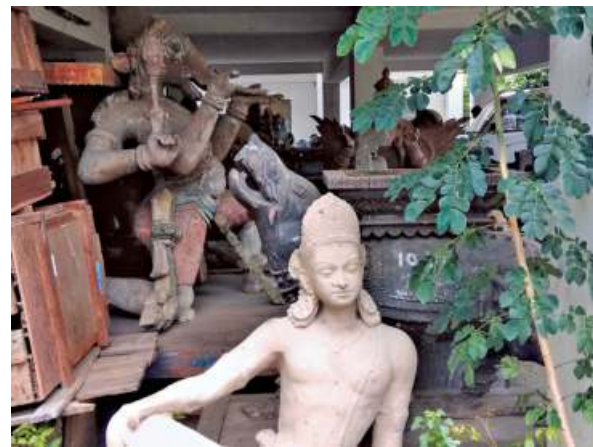
Without care: Priceless heritage lies haphazard at the CB-CID Economic Offences Wing premises in Guindy.

As per the Criminal Procedure Code, the antiques are seized by an investigation officer and are returned to the rightful owner or temple on-