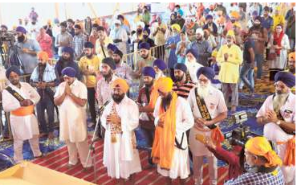
Devotees attend the 550th birth anniversary celebrations of Guru Nanak in Bidar on Monday.

Guru Nanak is believed to have visited Bidar during the 'dakshinapatha' or his southern sojourn. Legend has it that he stopped in the hilly town of Bidar while re-