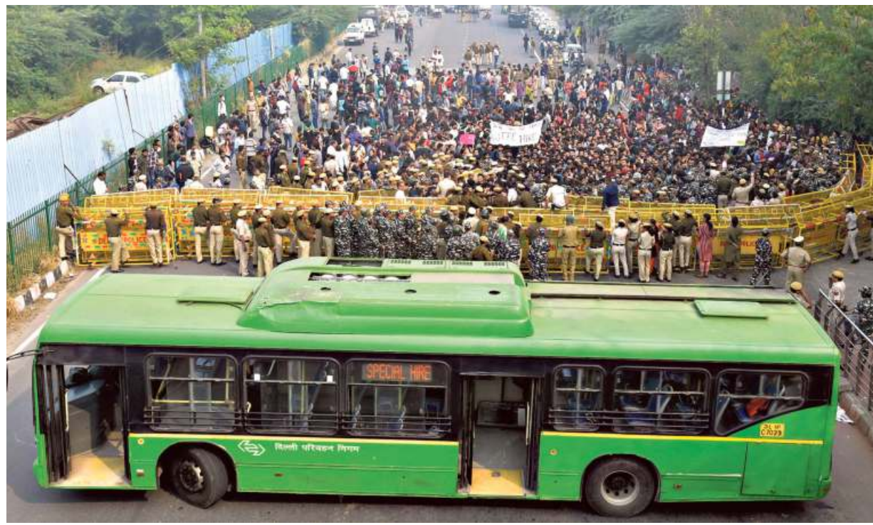
March halted: Jawaharlal Nehru University students being stopped by police in New Delhi on Monday as they protested against fee hike. Union Minister Ramesh Pokhriyal was stranded at the venue of a convocation. (PAGE 9)