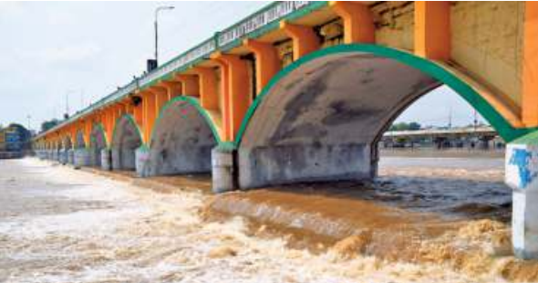
The policy currently in force prescribes minimum water flow level for rivers to meet ecological needs.

In September, Union Water Resources Minister Gajendra Shekhawat said that the Centre was planning to update the NWP and make key changes in water gover-