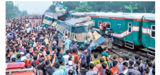
Fatal impact: People gathered at the spot in Brahmanbaria district where two trains collided head-on on Tuesday.

PRESS TRUST OF INDIA DHAKA At least 16 people were killed and 60 others injured in a head-on collision between two trains in Brahmanbaria district in central Bangladesh on Tuesday. A railway spokesman said the the accident appeared to have occurred when Chit-