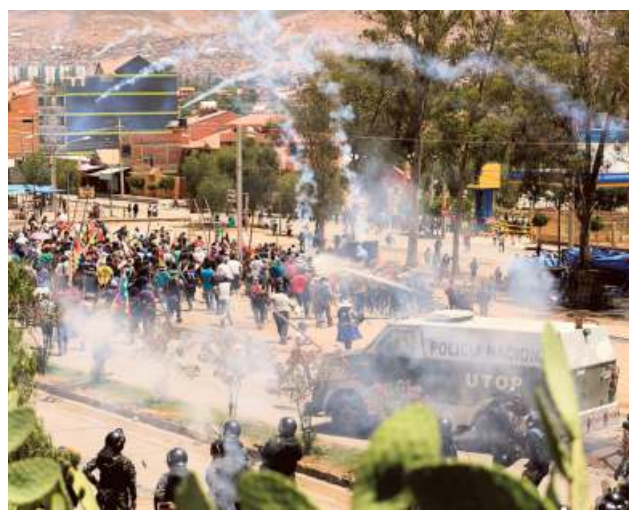
On the boil: Security forces firing tear gas shells at supporters of former President Evo Morales in Cochabamba; and Mr. Morales, right, upon landing in Mexico City on Tuesday.

In defiance of term limits Takeoff was delayed, with supporters surrounding the airport, then the plane was denied permission to fuel in Peru, Mexico's Foreign Minister Marcelo Ebrard told a news conference. So it stopped instead in Paraguay before arriving in Mexico City. In Bolivia's highland capi-