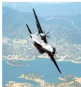
A file photo of the C-295 transport aircraft.

Tata-Airbus aircraft will replace the Air Force's ageing fleet of Avros