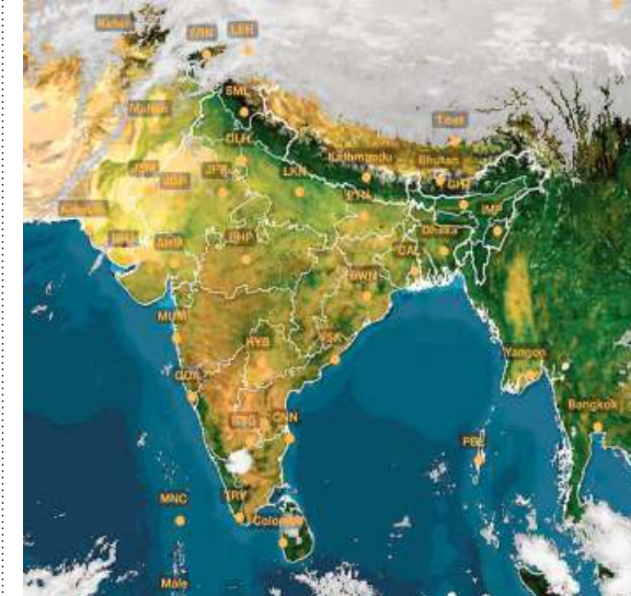
TEMPERATURE DATA: IMD, POLLUTION DATA: CPCB, MAP: INSAT/IMD (TAKEN AT 18.00 HRS)

RAINFALL, TEMPERATURE & AIR QUALITY IN SELECT METROS YESTERDAY