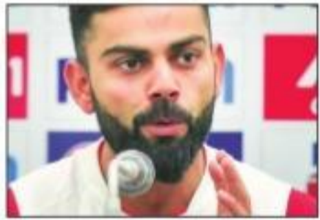
Virat Kohli in Indore on Wednesday.

Kohli was speaking to reporters on the eve of the Test against Bangladesh in Indore — and days after Australian allrounder Glenn Maxwell's