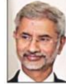
External Affairs Minister S Jaishankar

AT A time when India is negotiating its way through a dynamic geopolitical landscape — from the US to China and Pakistan to the Middle East — External Affairs Minister Subrahmanya Jaishankar has been entrusted with the task of translating the government's foreign policy objectives into concrete outcomes.