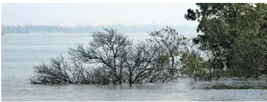
Fast disappearing: Mangroves have been cut not only for aquaculture, but also for building embankments and for human settlements.

Inhabited areas at risk Despite this, scientists, wildlife experts and local NGOs have been highlighting the constant degradation of the mangrove forest in the Sun-