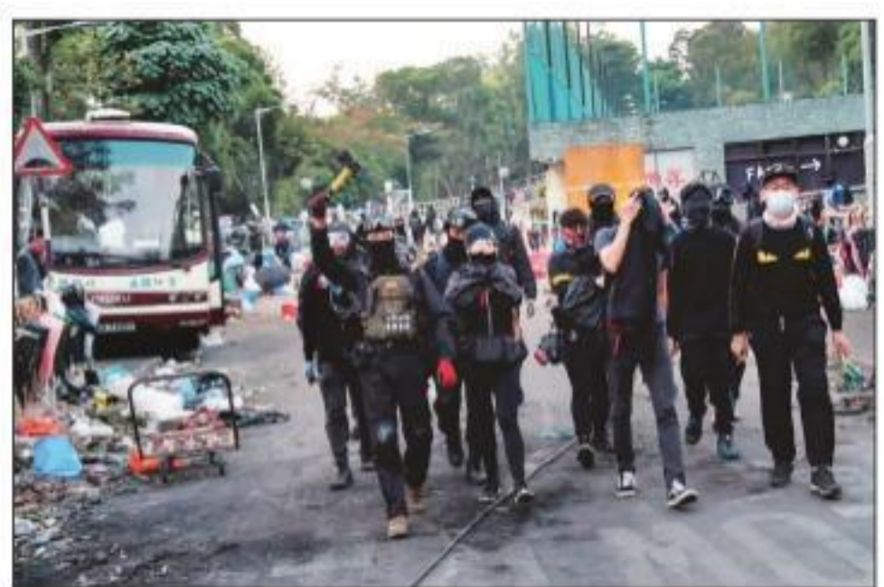
Protesters in Hong Kong on Thursday. REPORT, PAGE 15

Shetty and Rankireddy reached Hong Kong Monday from Fuzhou where they made