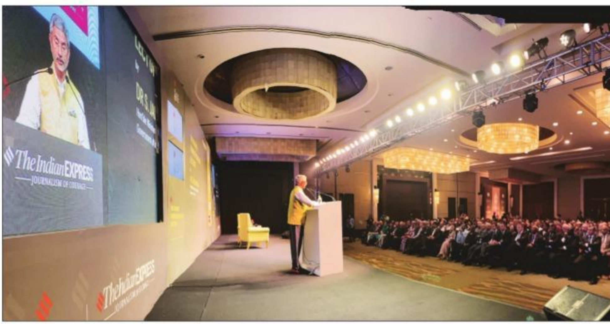
External Affairs Minister S Jaishankar at the fourth Ramnath Goenka Memorial Lecture in New Delhi, Thursday.

"In emergencies, law CONTINUED ON PAGE 2