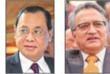
From top left: CJI Gogoi, Justices Khanwilkar, Malhotra

In turning to a larger Bench, three of the five judges on the Constitution Bench — Chief Justice of India Ranjan Gogoi, Justices A M Khanwilkar and Indu Malhotra — sought clarity on issues ranging from the essential religious practice test, including the "apparent conflict"