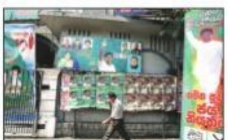
Posters of UNP's Sajith Premadasa, Colombo.

Maithripala Sirisena, who rode a surge of public anger against the Rajapaksa family to win by a massive margin four years ago, is not in the fray. And, one of the main contenders this