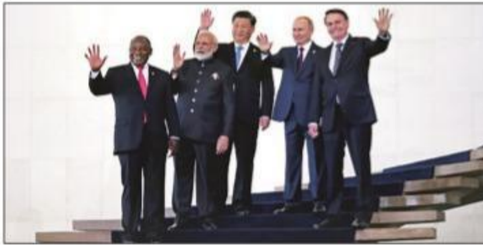
Narendra Modi with Cyril Ramaphosa, Xi Jinping, Vladimir Putin and Jair Bolsonaro in Brasilia on Thursday.

The two leaders agreed that the new 'high-level mechanism on trade and economy', decided