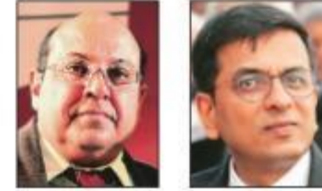
Justices R F Nariman, D Y Chandrachud

Writing for both, Justice Nariman took a stern view of the protests that followed the September 28, 2018 judgment