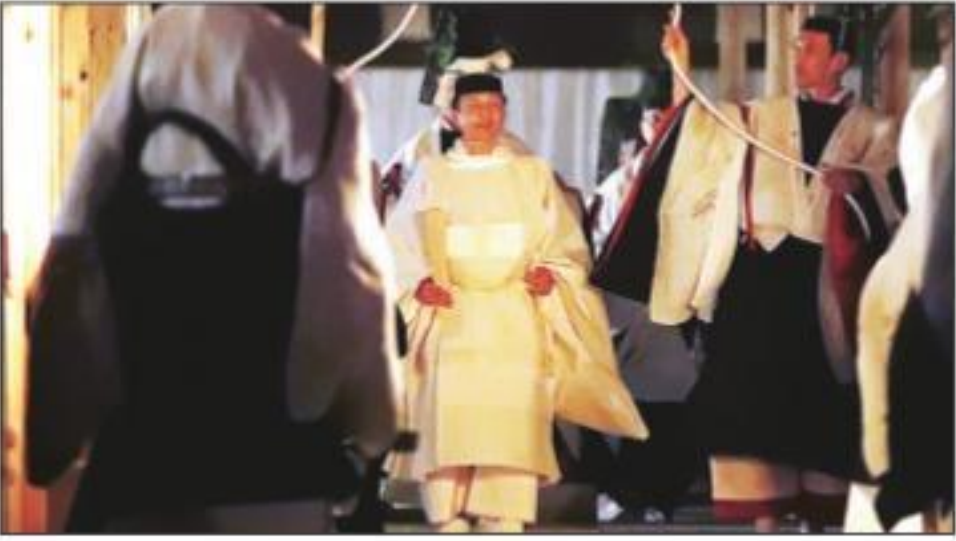
Naruhito on his way to attend 'Daijosaï', the most overtly religious ceremony of the emperor's accession rituals, at the Imperial Palace in Tokyo on Thursday.

Preparations began months ago, with the construction of a