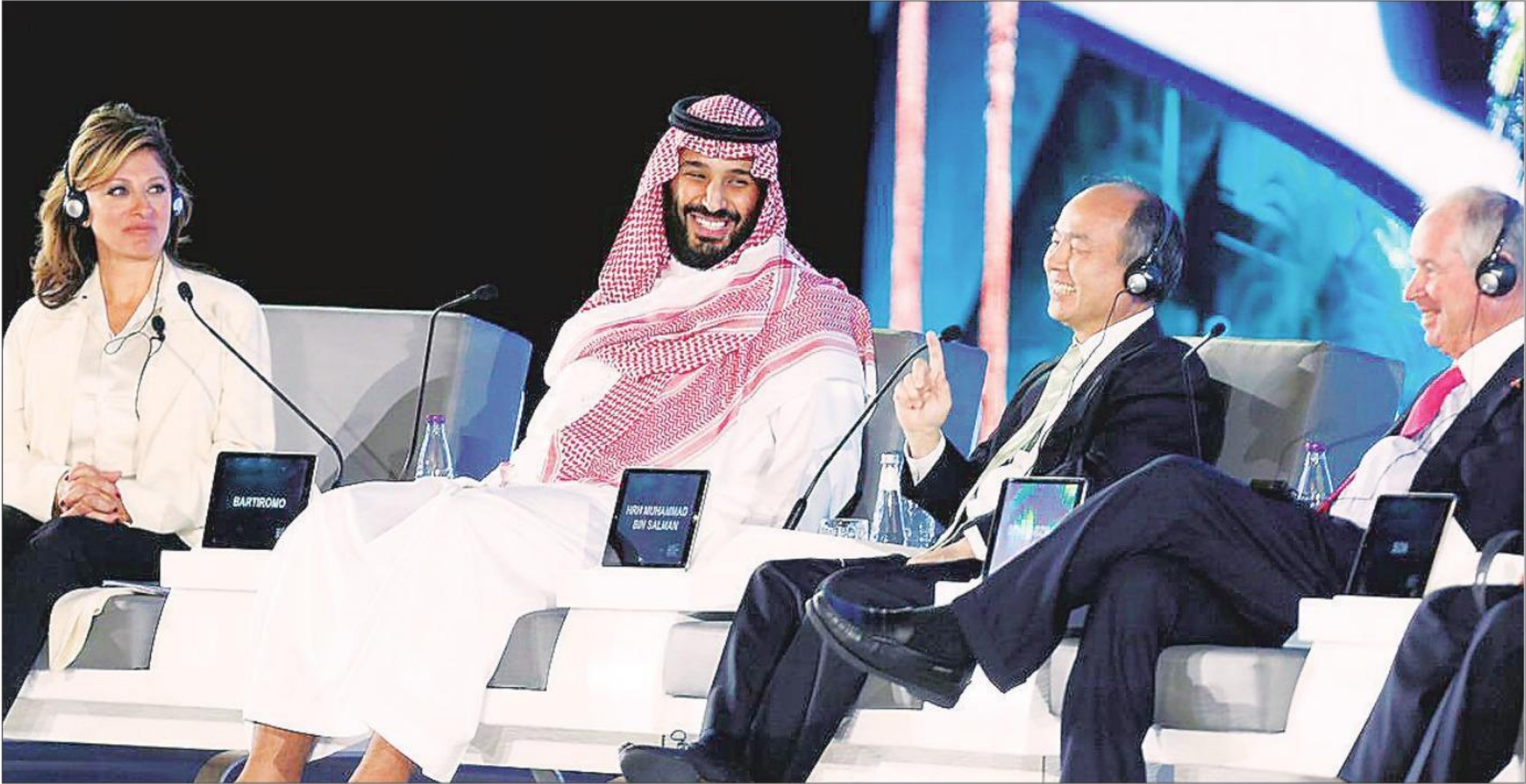
The first Future Investment Initiative, in 2017, was a coming-out party for the economic-reform programme of Muhammad bin Salman, the crown prince.

Saudi Arabia should listen to critics of its reform programme. Instead it locks them up