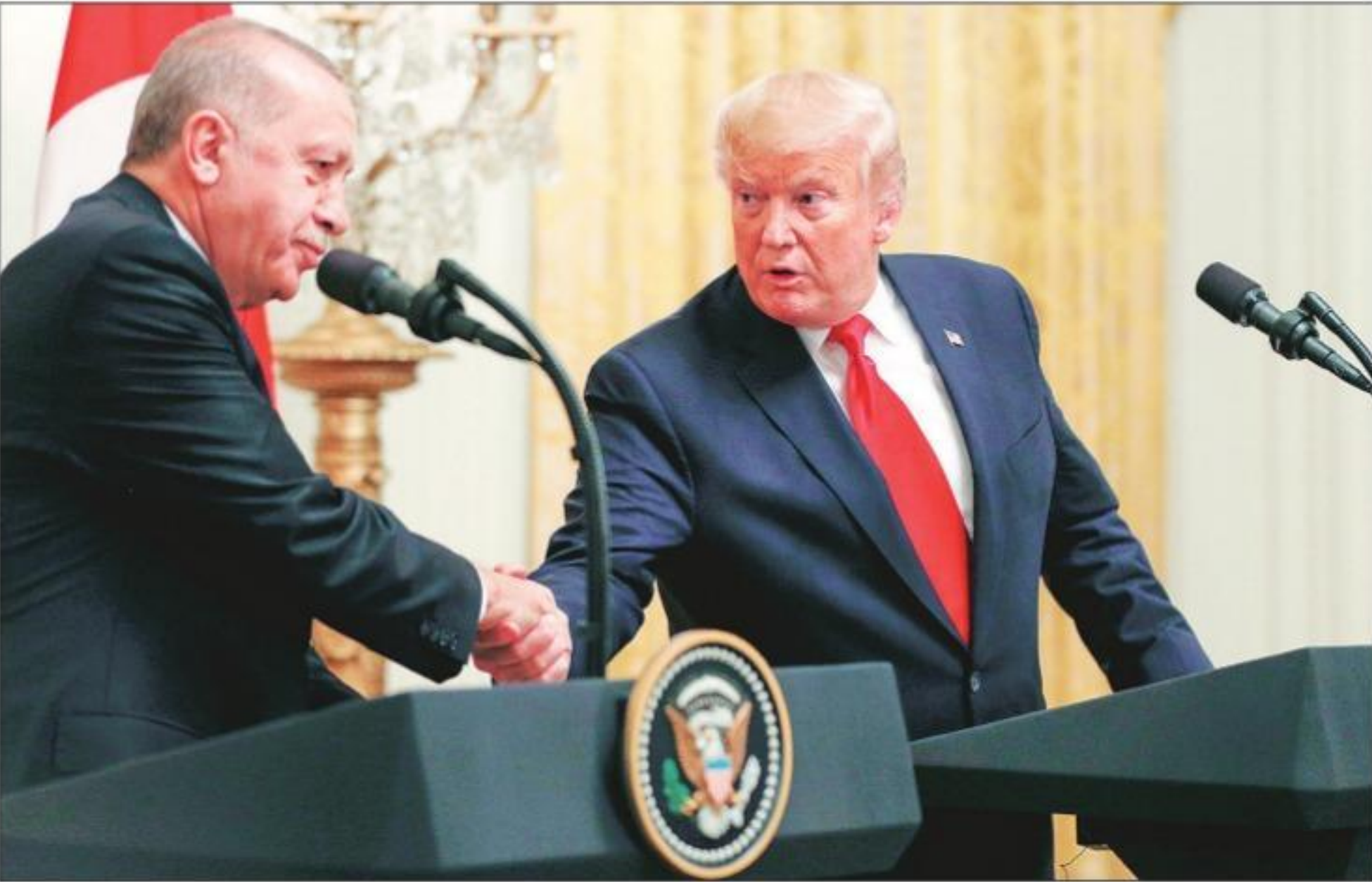
US President Donald Trump and Turkish President Recep Erdogan at the White House on November 13.