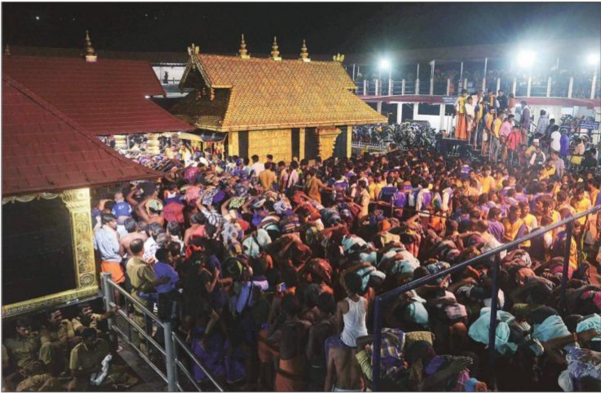
Devotees at the Sabarimala temple in 2016. This was before the Supreme Court lifted a ban on women of menstruating age from entering the temple.

What did the court say about recalibrating such decisions? CONSTITUTIONAL MORALITY: The court said ‘morality’ or ‘constitutional morality’ has not been defined in the Constitution. “Is it overarching morality in reference to preamble or limited to religious beliefs or faith? There is need to delineate the contours of that expression, lest it becomes subjective.” In the 2018 Sabarimala verdict, the majority opinion authored by then CJI Dipak Misra defined ‘morality’ in Article 25 to mean constitutional morality. Article 25 reads, “Subject to public order, morality and health and to the other provisions of this Part, all persons are equally entitled to freedom of conscience and the right freely to profess, practise and propagate religion”. Referring to Article 25(1), the 2018 judgment said: “We must remember that when there is a violation of the fundamental rights, the term ‘morality’ naturally implies constitutional morality and any view that is ultimately taken by the Constitutional Courts