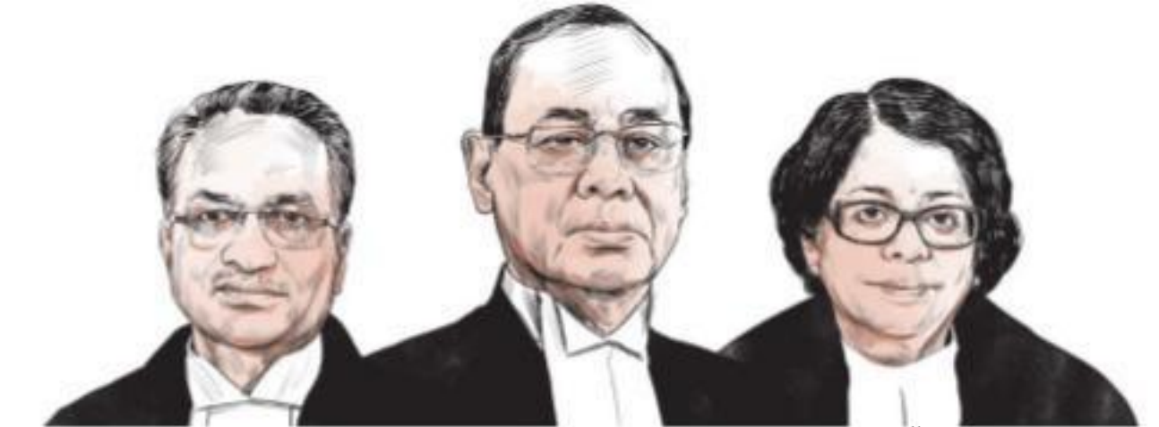
Illustrations: Suvajit Dey

must be in conformity with the principles and basic tenets of the concept of this constitutional morality.”