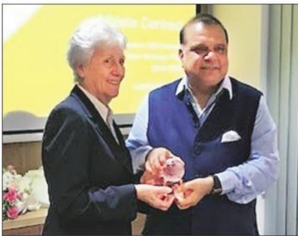
IOA president Narinder Batra with CGF counterpart Louise Martin in New Delhi on Thursday.