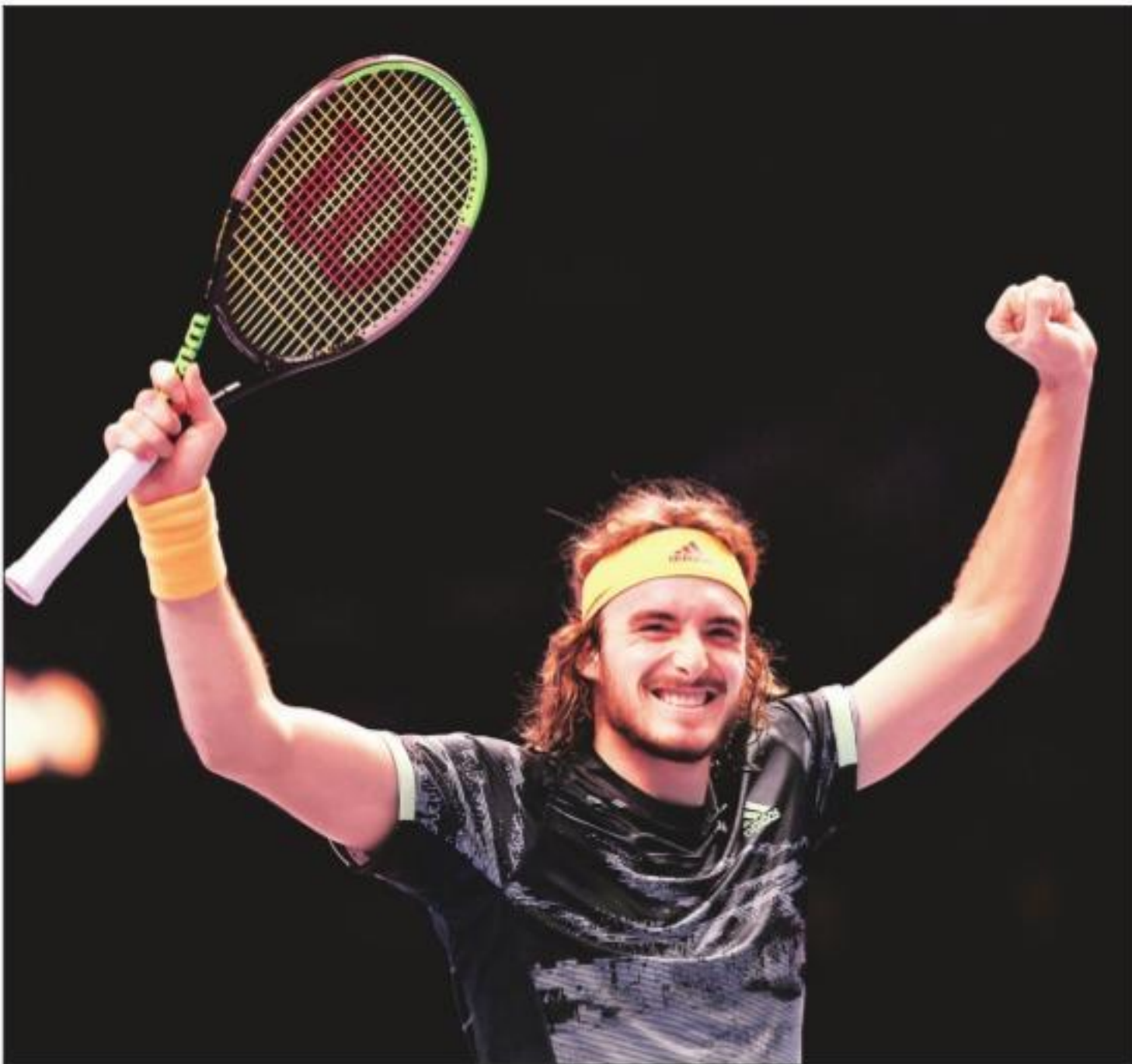
Despite reaching the semifinals, Stefanos Tsitsipas said he will not take his foot off the pedal against World no 2 Rafael Nadal on Friday.

But the form of Monday's group-stage win over Nadal deserted him as Tsitsipas, with whom he is said to have a frosty