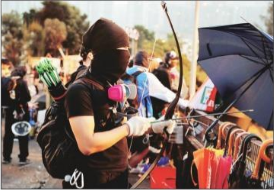
Protesters during a standoff with riot police at the Chinese University of Hong Kong.

The protests started in June over an extradition bill that has since been withdrawn, and have morphed into broader demands for democracy and police accountability. In recent days, the locus of tension between protesters and the police has moved