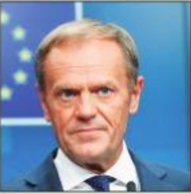
DONALD TUSK European Council President

Brussels: Britain will lose influence in international affairs and become a "second-rate player" after it leaves the European Union, European Council President Donald Tusk said on Wednesday. Backers of Britain's 2016 vote to exit the EU, the world's largest trading bloc, say that the country will achieve a new global status unhackled from EU rules and closer to the United States. Tusk said only a united Europe could confront an assertive China and play an effective global role. "I have heard repeatedly from Brexiters that they wanted to leave the European Union to make the United Kingdom global again, believing that only alone, it can truly be great..." Tusk said in a speech.