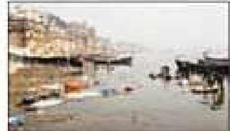
Maximum fine for obstructing the flow of the river.