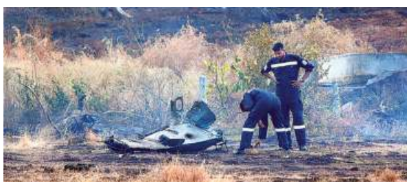
Close shave: The left engine of the aircraft had flamed out and the right engine caught fire. *ATISH POMBURFEKAR

the left engine had flamed out and the right one had caught fire. Attempts to recover the aircraft by following the standard operating procedures were unsuccessful due to the nature of emergency," the statement said.