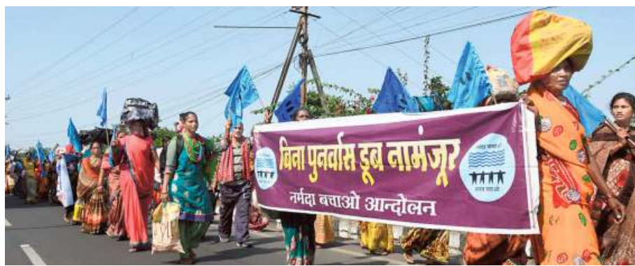
On the edge: Farmers, potters and fishermen displaced by the Sardar Sarovar Dam project taking out a rally in Bhopal on Saturday.