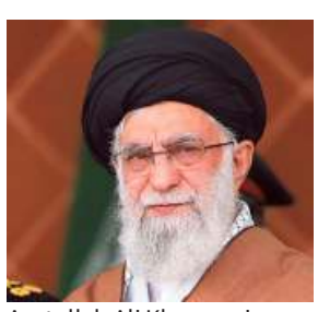
Ayatollah Ali Khamenei

"Some people are no doubt worried by this decision... but sabotage and arson is done by hooligans not our people. The counter-revolution and Iran's enemies have always supported sa-