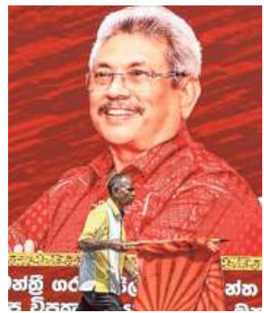
A supporter of Gotabaya Rajapaksa carrying a party flag in Colombo.

'Saviour' who ended war To many in Sri Lanka's majority Sinhala-Buddhist community, Mr. Gotabaya Rajapaksa, 70, is a "saviour" who spearheaded the military victory over the rebel LTTE a