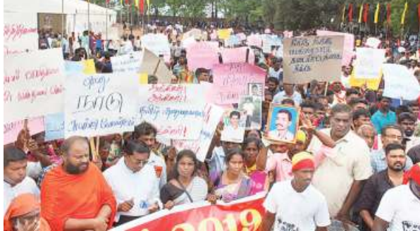
Sri Lankan Tamils at a rally in Jaffna, demanding international probe into the alleged atrocities during the civil war.

"We fervently hope for peace and amity, restoration of harmony and lasting goodwill among all communities under your administration,"