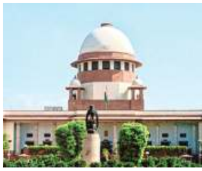
The code will address the Ministers' private and public activities.

The question was framed after family members of the Bulandshahr rape case victim complained about former Uttar Pradesh Minister Azam Khan's public statements that the rape case was