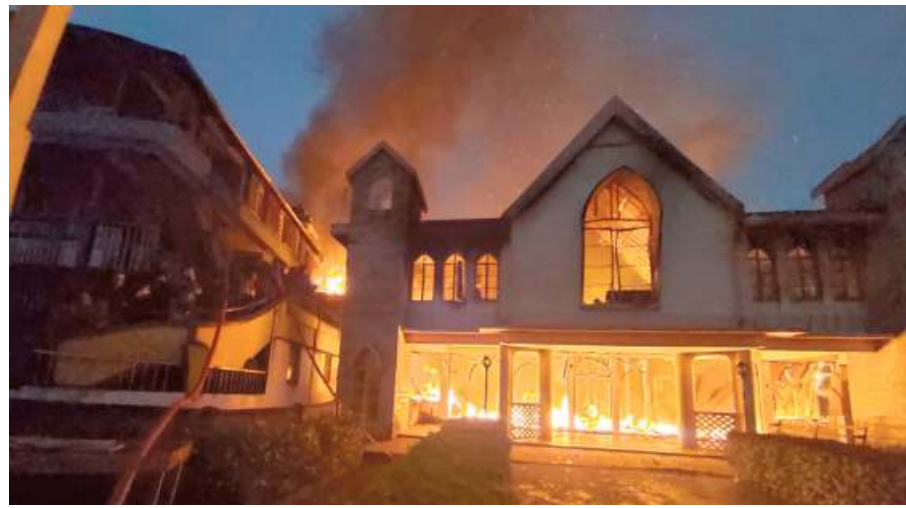
Violent blaze: A huge fire destroyed a century-old church and an adjoining house in Shillong on Sunday morning. An elderly couple was killed in the incident.