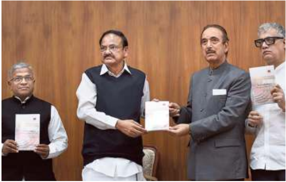
Rajya Sabha Chairman Venkaiah Naidu, Deputy Chairman Harivansh Narayan Singh, Opposition Leader Ghulam Nabi Azad and Trinamool Congress leader Derek O'Brien releasing the book commemorating the 250th session.

Extended debates The longest debate on any given subject till date was on the government's failure to provide adequate security to former Prime Minister Rajiv Gandhi in wake of his assassination at Sriperumbudur by LTTE cadres. The discussion went on for 12 hours and four minutes on June 4, 1991. Demolition of the Babri Masjid was debated days after the incident from December 18-21, 1992, for 11 hours and 37 minutes. The Upper House which on March 9, 2010, cleared the Women's Reservation Bill that proposes to reserve 33% of all seats in Lok Sabha for women, has a dismiss-