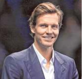
Tomas Berdych.