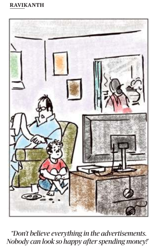
"Don't believe everything in the advertisements. Nobody can look so happy after spending money!"

Readers can send in queries on personal finance and investing to moneywise@thehindu.co.in. Our experts who write on personal finance will answer these queries. Moneywise will not give specific recommendations for investment in a particular mutual fund scheme, share or fixed deposit.