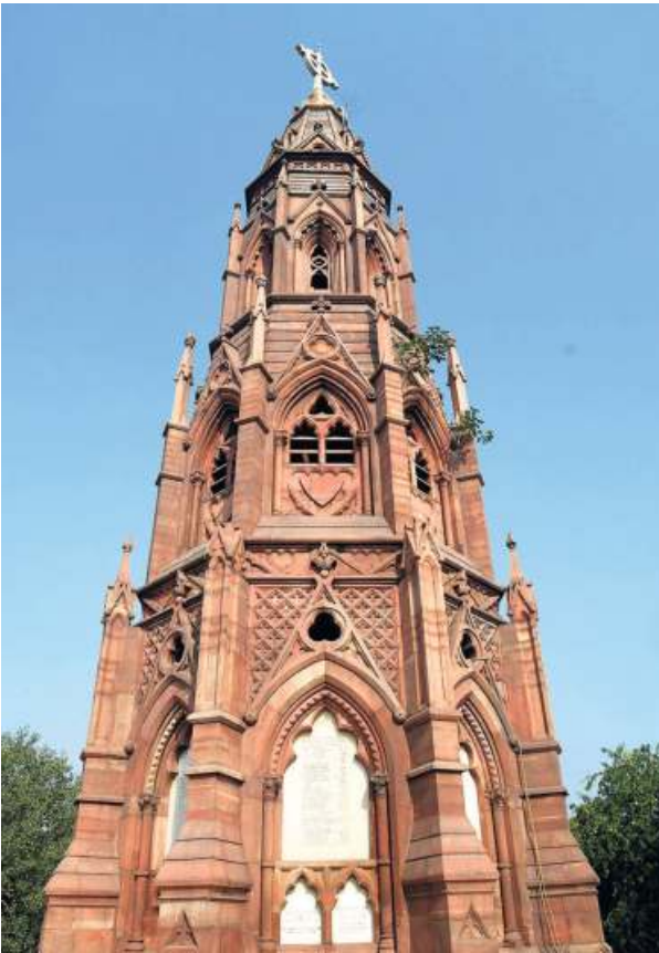
Majestic architecture Ajitgarh tower; (below) Flagstaff Tower

peror met only his confidantes in the tower to discuss matters of State.