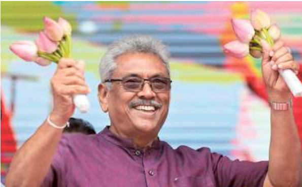
Looking ahead: Local diplomats have been holding meetings with the Rajapaksas, expecting to build on traditional ties between New Delhi and Colombo.

Sri Lanka insisted it had informed Indian officials about the plan in advance, and that the docking was routine, but the event put the Rajapaksa regime and the Modi government on collision course. Matters came to a head shortly after, when an Indian diplomat based in Colombo was accused of conspiring with the Opposition leaders to defeat President Rajapaksa, and subsequently re-