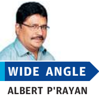
WIDE ANGLE

While many teachers dream of getting a government job, the process of applying for one seems like a nightmare