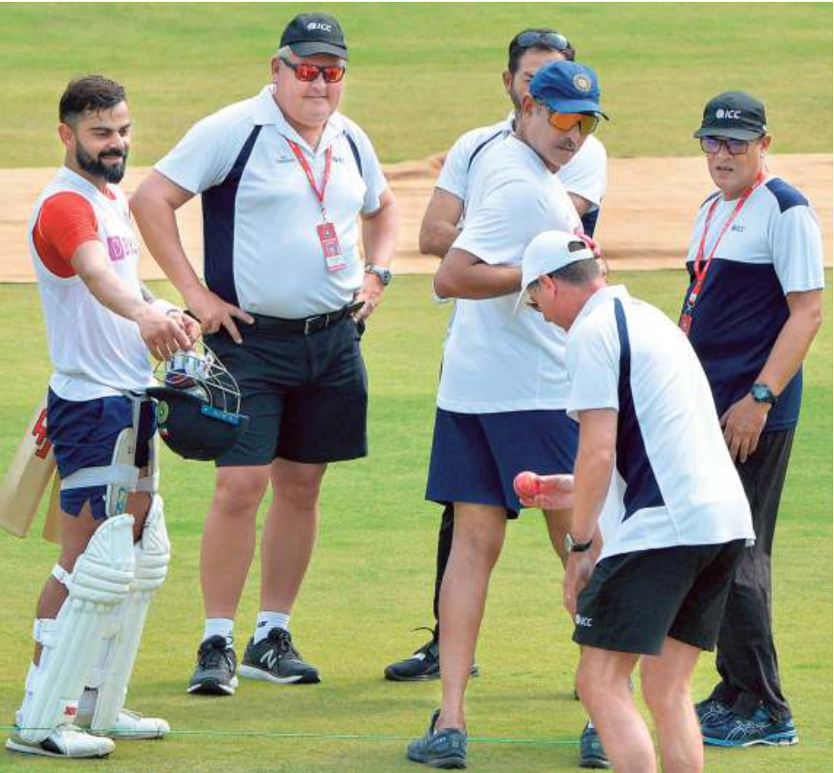
Let's have a look: It will be a guessing game for Virat Kohli and coach Ravi Shastri on how the pink ball will behave.

Pujara, Pant, Gill, Vihari and spin twins Ashwin and Jadeja turn up for training session while the biggies, including skipper Kohli, Rohit and Rahane, give it a miss