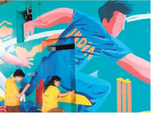
Decking the walls: Artists painting the Eden Gardens to tell the story of a cricketer's journey from the maidan to the national side.