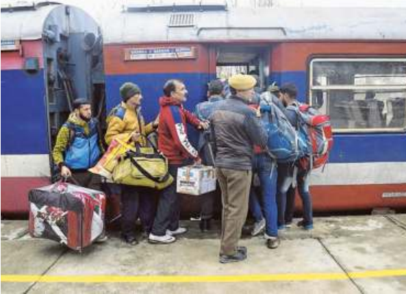
In demand: Passengers boarding a train for Banihal from Srinagar on Sunday.