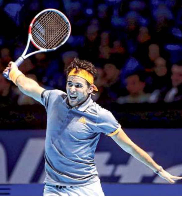
Power packed: Dominic Thiem was tougher in the big moments against Alexander Zverev.

ATP FINALS AGENCE FRANCE-PRESSE LONDON Dominic Thiem defeated defending champion Alexander Zverev to join Roger Federer's conqueror Stefanos Tsitsipas in the final of the ATP Finals here. The Austrian fifth seed saw off the big-serving German 7-5, 6-3 on Saturday after Greece's Tsitsipas had beaten Federer 6-3, 6-4. Fourth time lucky Thiem is playing in his fourth ATP Finals but during his first three trips to the season finale, he won only three matches and never advanced out of the group stage at the O2 Arena. Zverev landed 75% of his first serves but Thiem was tougher in the big moments, breaking in the 12th game of the opening set and in the sixth game of the second set. Crucial double fault Germany's Zverev, who beat Novak Djokovic in last year's final, went toe to toe with Thiem in a relatively uneventful first set but served a double fault to lose the opener 7-5. He regrouped and settled back into his serving rhythm at the beginning of the second set but was broken again to trail 4-2. Thiem fended off a couple of break points in the following game and served out to take the match, winning with a forehand down the line. Other result: Doubles (final): Pierre-Hugues Herbert & Nicolas Mahut bt Raven Klaasen & Michael Venus 6-3, 6-4.