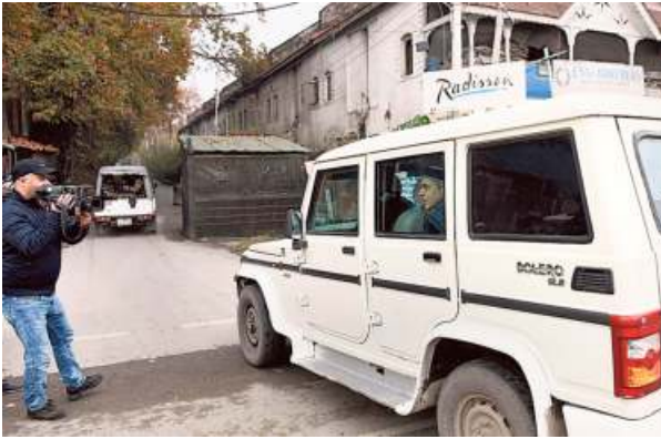
On the move: Political detainees being shifted to the MLA Hostel from the Centaur Hotel in Srinagar on Sunday.