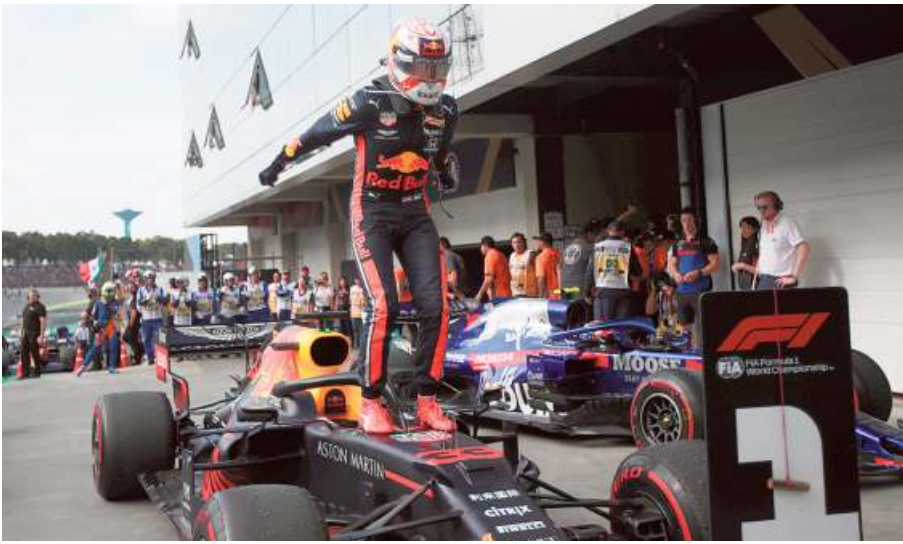
Super Sunday: Max Verstappen celebrates his Brazilian GP win.

REUTERS SAO PAULO Max Verstappen won a thrilling Brazilian Formula One Grand Prix for Red Bull on Sunday with Pierre Gasly a surprise second for Toro Rosso. Six times world champion Lewis Hamilton finished a close third for Mercedes but under investigation by the stewards after a late collision with Red Bull's Alex Albon that denied the Thai a first podium appearance.