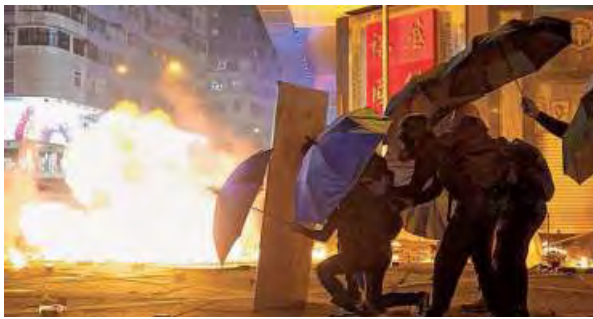
No let-up: Protesters taking cover from tear gas canisters in Kowloon area of Hong Kong on Monday. • AP

AGENCE FRANCE-PRESSE HONG KONG Dozens of Hong Kong protesters escaped a two-day police siege on a campus late on Monday by shimmying down a rope from a bridge to awaiting motorbikes in a dramatic and perilous breakout that followed a renewed warning by Beijing of a possible intervention to end the crisis engulfing the city.