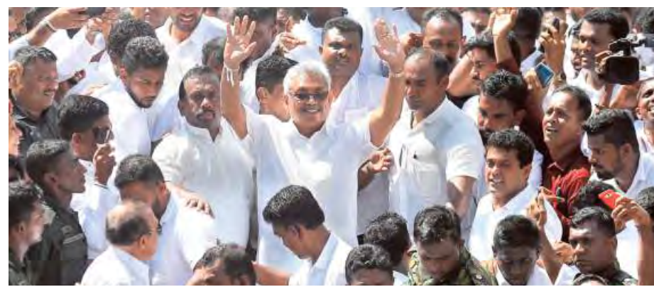
Centre of attraction: President Gotabaya Rajapaksa greeting people after the swearing-in ceremony at the Ruwanwelisaya Buddhist shrine in Anuradhapura on Monday.

"The main message of the election is that it was the Sinhala majority vote that allowed me to win the presidency," the former Defence Secretary said. "I knew that I could win with only the