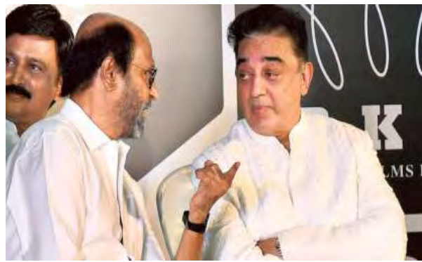
MNM party President Kamal Haasan and actor Rajinikanth seen together at an event earlier in November. FILE PHOTO

After actor Vijay's father S.A. Chandrasekaran set the ball rolling by saying he wished to see Mr. Rajinikanth and Mr. Haasan in an alliance for the 2021 polls, Mr. Rajinikanth appeared to take a dig at Chief Minister Edappadi