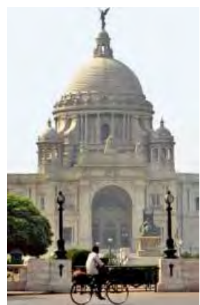
Victoria Memorial was opened to the public a few years after the massacre.

In Bengal, the response to the massacre was not limited to a letter by Tagore to Viceroy Chelmsford on